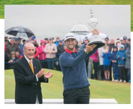
Irish Open 2017 winner Jon Rahm

This event made a major local impact, generated significant international media coverage and enhanced our reputation as a golfing and leisure destination.