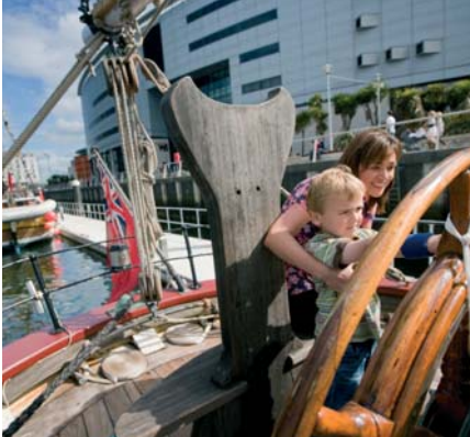
Titanic Maritime Festival

The UEFA Women's Under 19 European Football Championships and the Women's Rugby World Cup delivered exceptionally large visitor numbers - nearly 50,000 across the two events, equating to almost 40,000 bednights.