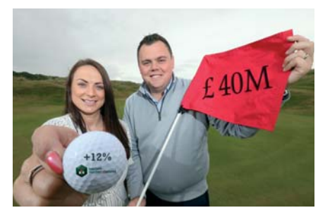
Revenue from golf tourism has increased to £40 million

Last year our work on the Golf Tourism Strategy helped deliver a 12% increase in golf tourism revenue to just under £40m from 123,200 golf visitors.