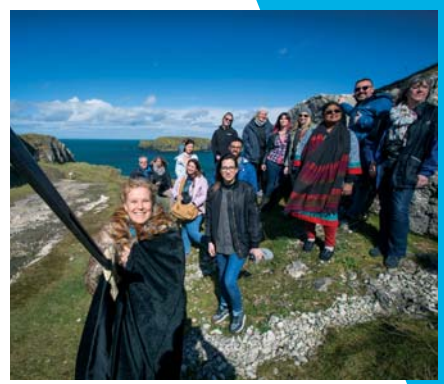
Game of Thrones® international media visits