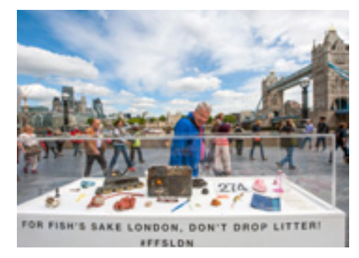
Cabinet of Curiosities by the Thames

making it easy for us to track public engagement on social media.