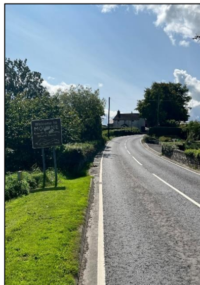
Ballylough Road, Castlewellan