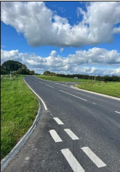
Downpatrick Road, Ardglass