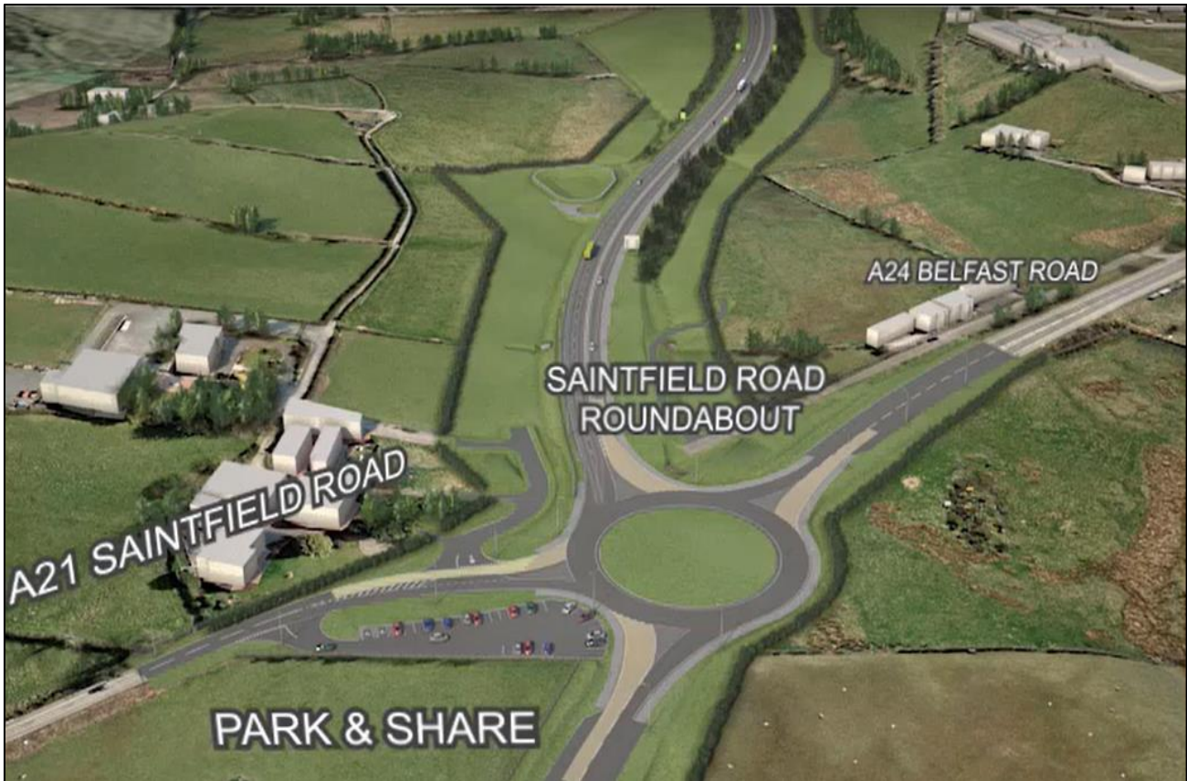
Image of Northern Junction at Saintfield Road