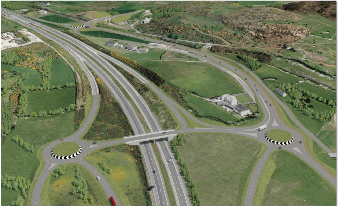
Image of Ellisholding Road Junction at A1