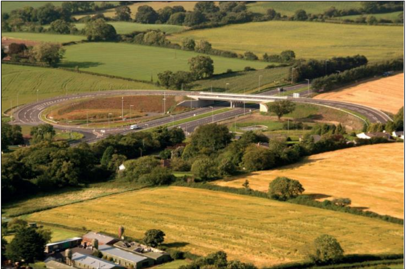
Existing Compact Grade Separated Junction at Pantridge Link, Hillsborough

In addition, the proposal includes the provision of a northbound on-slip at Castlewellan Road at Banbridge, a link between the existing underpass junction at Hillsborough Road, Dromore and Milebush Road and the closing of nine minor road junctions along this section of the A1.