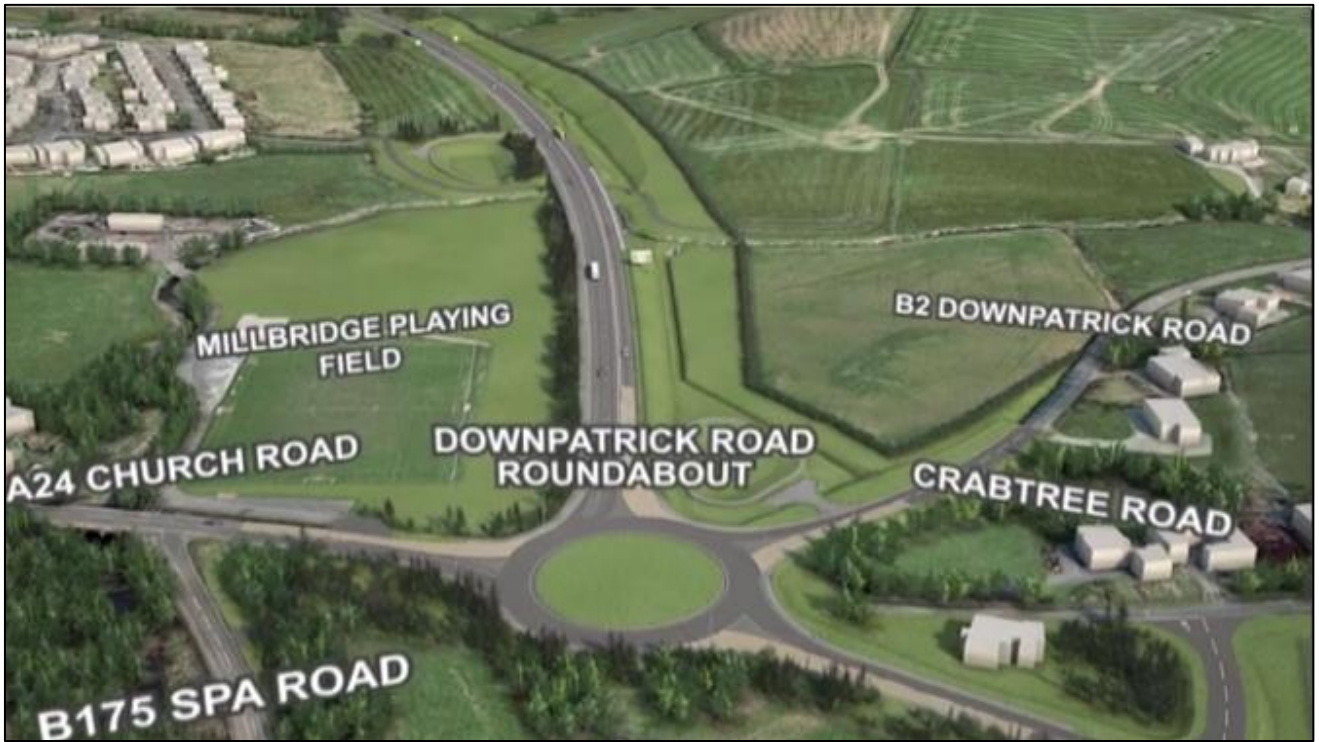
Image of Southern Junction at Drumaness Road