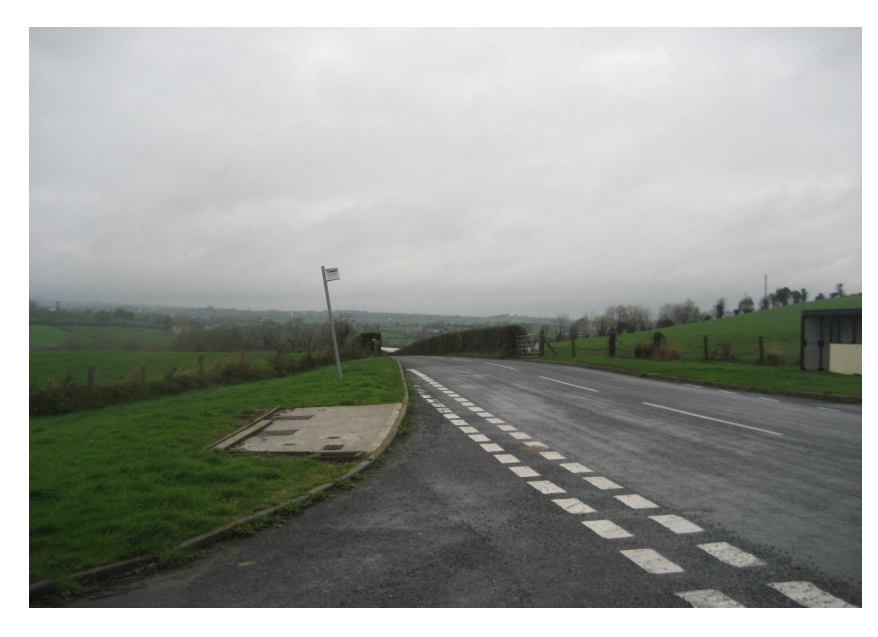
Before the scheme

This scheme to provide improved visibility by removing the crest at this junction and improvements to the junction radii and localised carriageway widening is now completed.