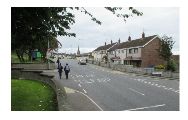
Before the scheme

This scheme, to improve traffic progression, has spanned the 16/17 and 17/18 financial years. The scheme will provide road widening with formalized 'on-street parking areas' for local residents on both sides of the street. Traffic calming measures, in the form of road humps are also being provided along Fountain Street and in Kennedy Square. Work is scheduled to be completed by June 2017.