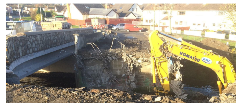
The old Bridge being demolished (the new bridge is on the left)

Other structures strengthened during the period -