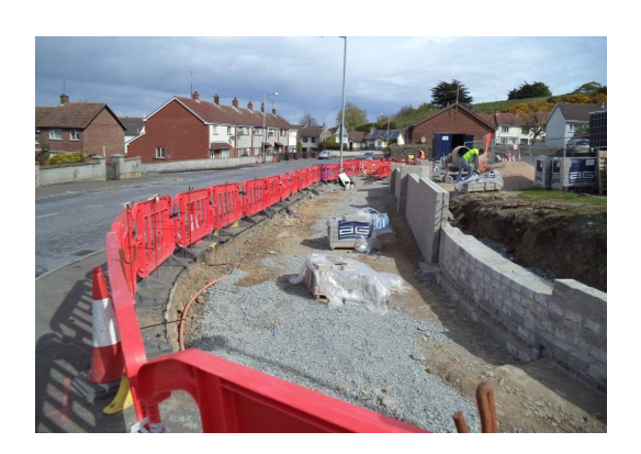
Work ongoing April 2017