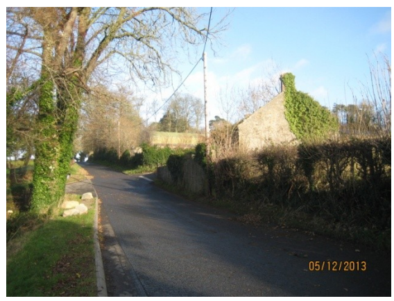
Junction prior to road works