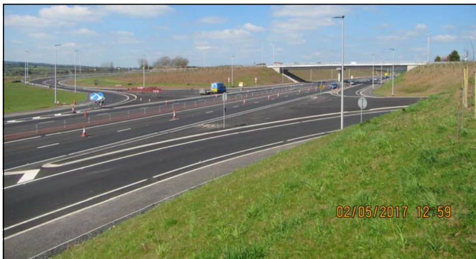
Lisnasoo Junction facing North

This new dual carriageway which is expected to be open to traffic ahead of programme in June 2017, will improve both journey times and journey time reliability for this stretch of the A26, thus reducing driver frustration and improving the safety performance of the route for all road users.