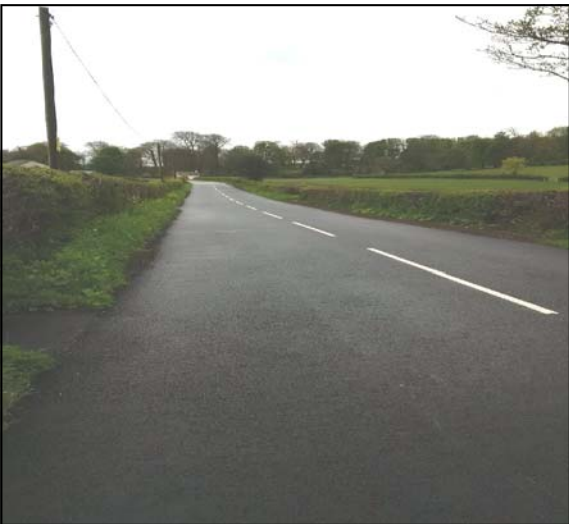
U4031 Deerpark Road, Larne 3.95kms of Asphalt Surfacing costing £291,000.