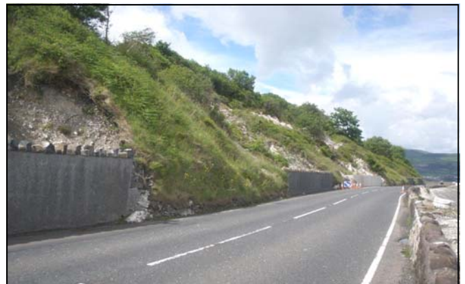
A2 Coast Road, Glenarm. Proposed Slope Stabilisation Scheme 2017 /18. Estimated cost £200,000.