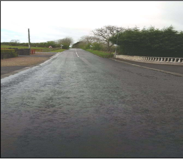
B53 Kilgad Road, Kells 2.86kms of Asphalt Surfacing costing £238,000.