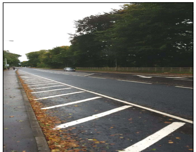
A42 Galgorm Road, Ballymena 790 metres of Asphalt Surfacing costing £300,000.