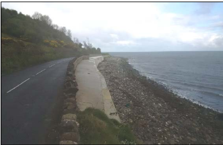
A2 Coast Road. Completed Sea Defence Scheme, Milltown Bridge to Drumnagreagh, Ballygalley