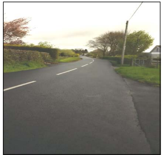
C37 Lower Ballyboley Road, Ballyclare 3.1kms of Bitmac Surfacing costing £236,000.