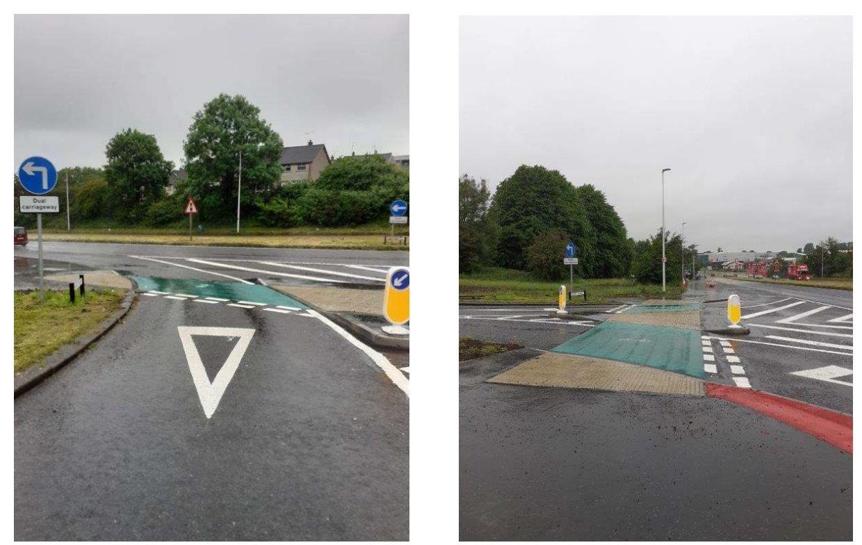
Giving cyclists priority over vehicles.

Both these schemes have extended the existing provision along Larne Road Link and further promote active travel in the area.