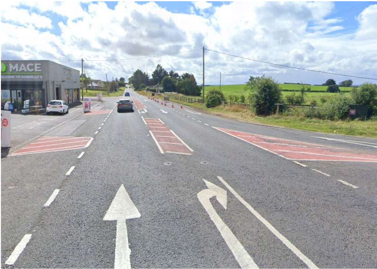
McGregor's Corner, A43 Cushendall Road

Following a number of road traffic collisions reported by residents and elected representatives, and after site visits to observe driver behaviour, high friction surfacing has been laid on the A43 Cushendall Road, at McGregor's Corner (Drumagrove/Knockan/Cushendall Roads staggered crossroads). It is considered that the provision of the red HFS will improve driver discipline, ensuring that motorists do not stray into previously only hatched areas, which are not to be driven on. This will highlight the busy staggered crossroads in an enhanced manner resulting in fewer collisions.