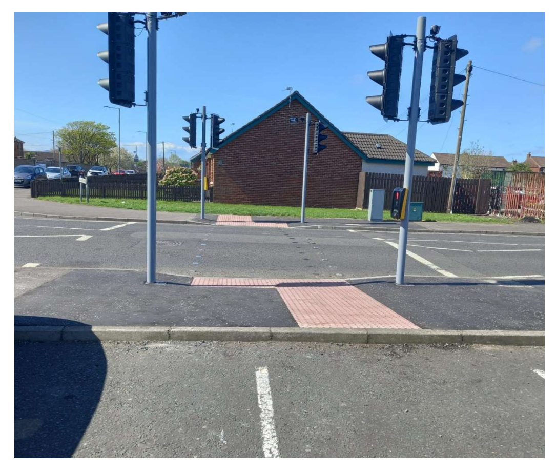
Victoria Road Puffin Crossing

Puffin Crossings utilise the latest traffic signal technology and allows sensors on the pole tops to detect if pedestrians are crossing slowly and subsequently hold the red traffic signal longer to allow pedestrians to cross in safety. In addition, if a pedestrian presses the button and walks away, the controller will cancel the pedestrian request, improving traffic progression and making the lights more efficient for all road users.