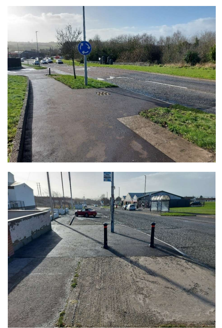
Linn Road, Larne

After receiving a request from Translink, and reviewing a number of Bus Stop locations on their Goldline service in Larne, the Department has provided two separate hard stand areas on Linn Road, which will allow wheelchair users to avail of the new accessible buses on Translink's Goldline service.