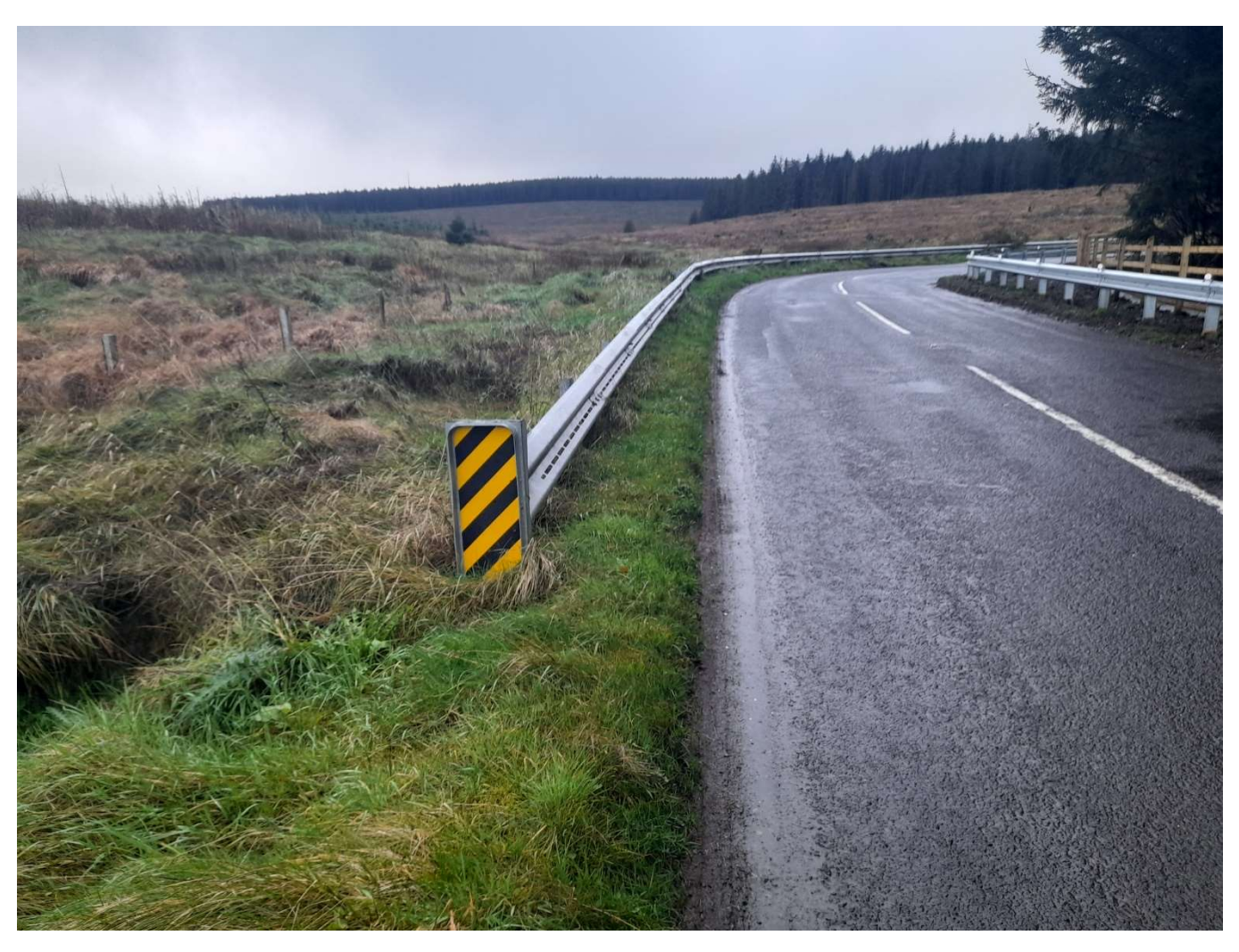
Starbog Road – Upgraded vehicle restraint system.