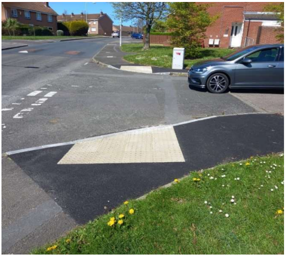
Dunluskin GaRoadens, Carrickfergus

The Department has provided dropped kerbs and tactile paving to create a number of formal crossing points on Downshire Gardens, Selby Road, Craigs Road, Tudor Link, Tudor Drive, Tudor Park, Dunluskin Gardens and Oakfield Drive in Carrickfergus after receiving requests from various local elected representatives on behalf of residents with limited mobility. This will improve accessibility for all users, especially those with limited mobility, wheelchair users and those with pushchairs.