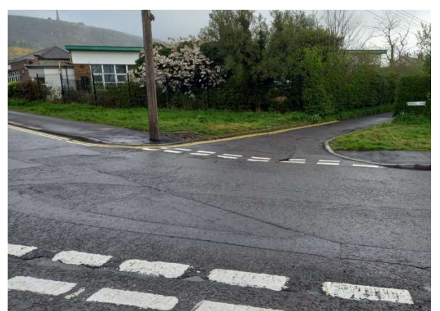
School Lane, Greenisland

The Department has provided dropped kerbs, junction road marking and enhanced existing road markings to assist pedestrians when crossing the Upper Station Road at its junction with School Lane. This is a well-used crossing for parents, pupils and local residents attending Greenisland Primary School and will assist with accessibility for all users.