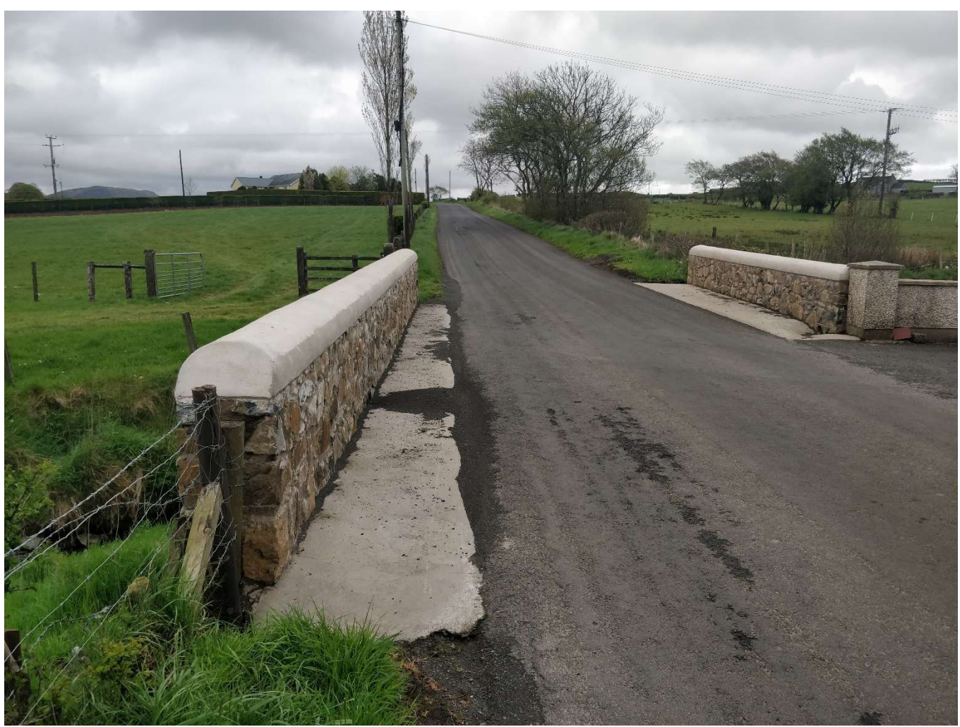
Magillstown Bridge, Lisnahilt Road, Ballymena – Parapet Work