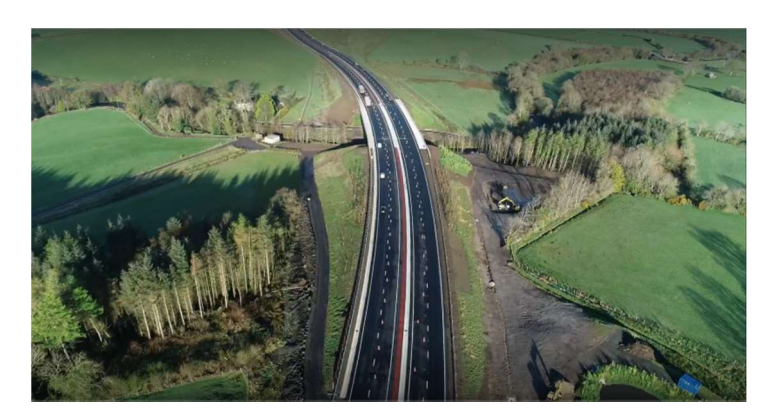
A6 Dual Carriageway over the River Roe.