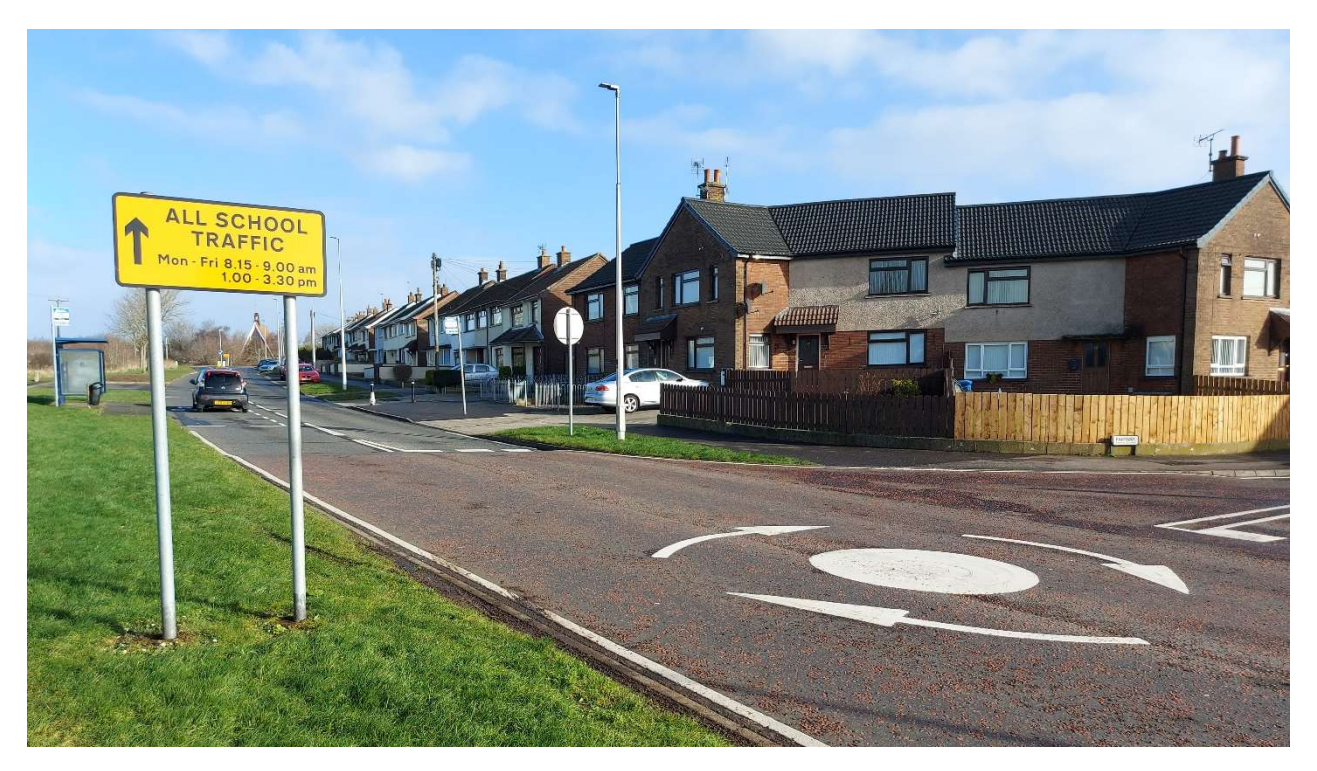
Linn Road, Larne

After being approached by the PTA of St. Anthony's Primary School, Larne about concerns over traffic congestion at the peak drop off and pick up times. Dfl Roads staff carried out site visits upon receiving the complaint which confirmed the issues staff, pupils and local residents were facing on the compact roads during the morning and afternoon peaks. Dfl Roads has consequently implemented an advisory one way system for school users.