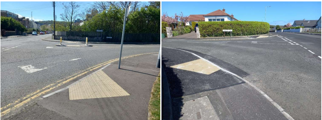
Kings Road Whitehead

The Department has provided dropped kerbs and tactile paving to assist pedestrians when crossing Donegall Park and Kings Road in Whitehead, after receiving requests from a number of local residents with limited mobility. This will assist with accessibility for wheelchair users, those with pushchairs and limited mobility.