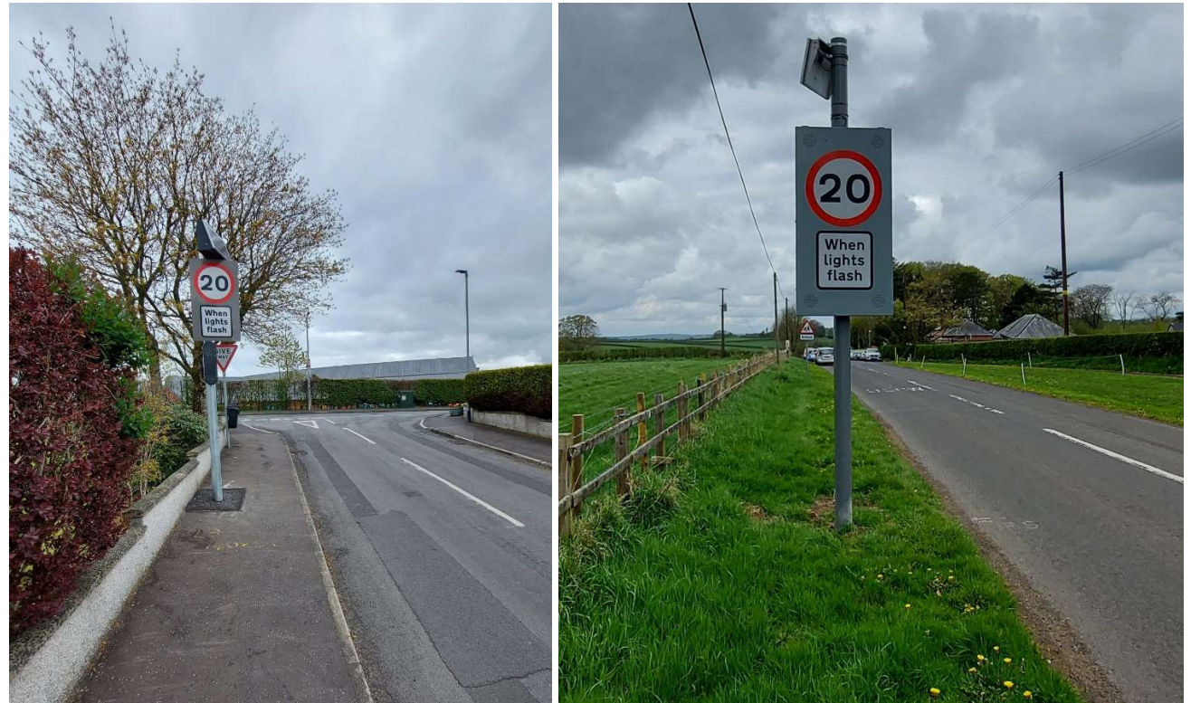
Lismurn Park, Ahoghill