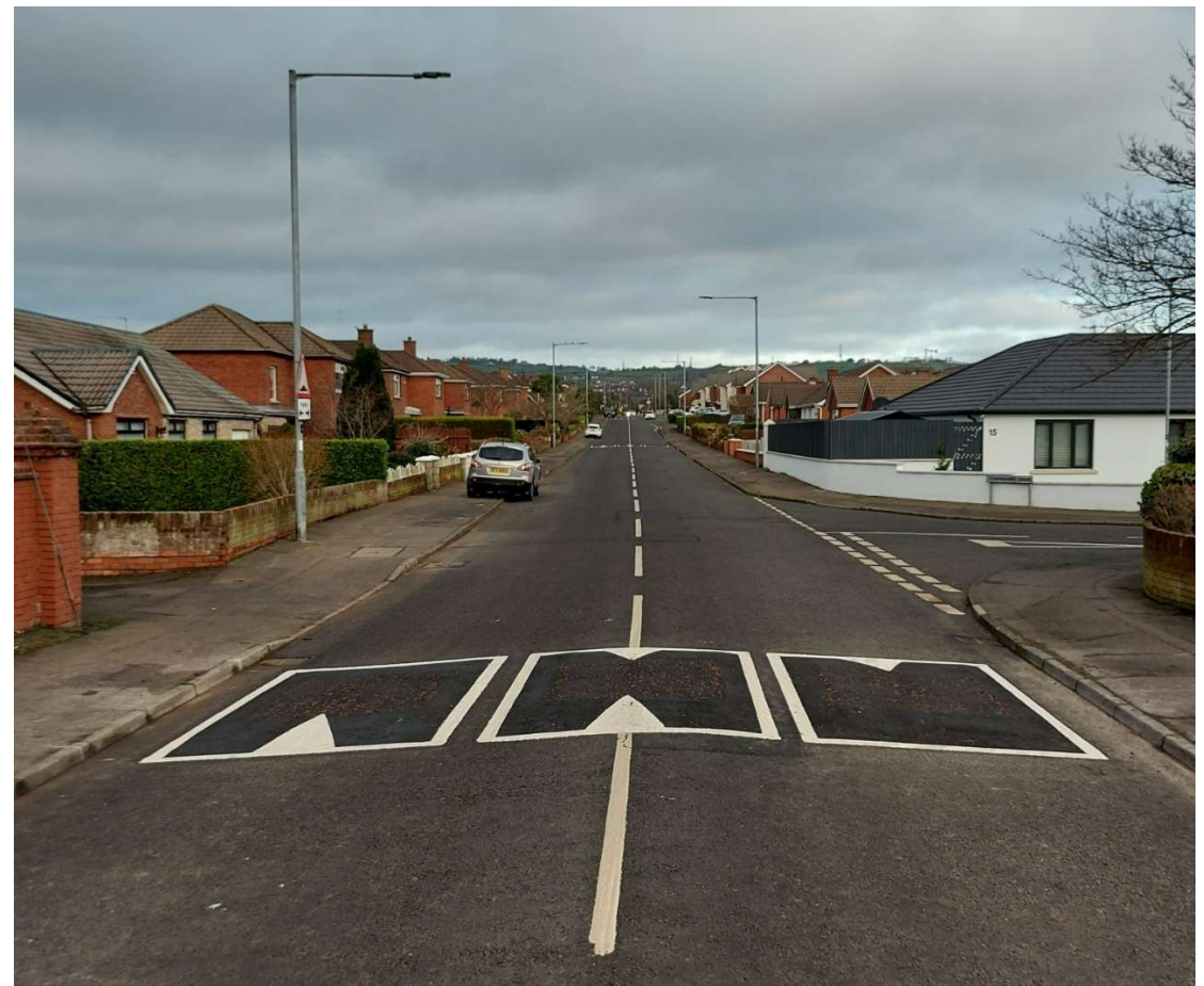
Downshire Road, Carrickfergus

A traffic calming scheme on Downshire Road in Carrickfergus is now complete. This road leads to a local secondary school and joins the busy A2 Larne Road carrying school traffic, school children walking to school, as well as a large number of local residents. The area will benefit greatly from traffic calming measures and improved road safety, and has already been warmly welcomed by local residents.