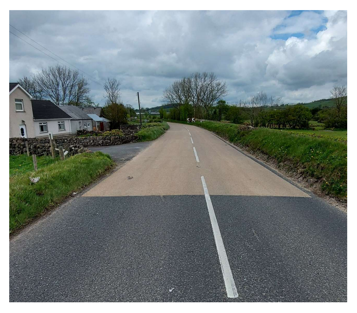
A42 Carnlough Road, Broughshane

It is considered that these measures will help to improve road safety and reduce collisions on this bend.