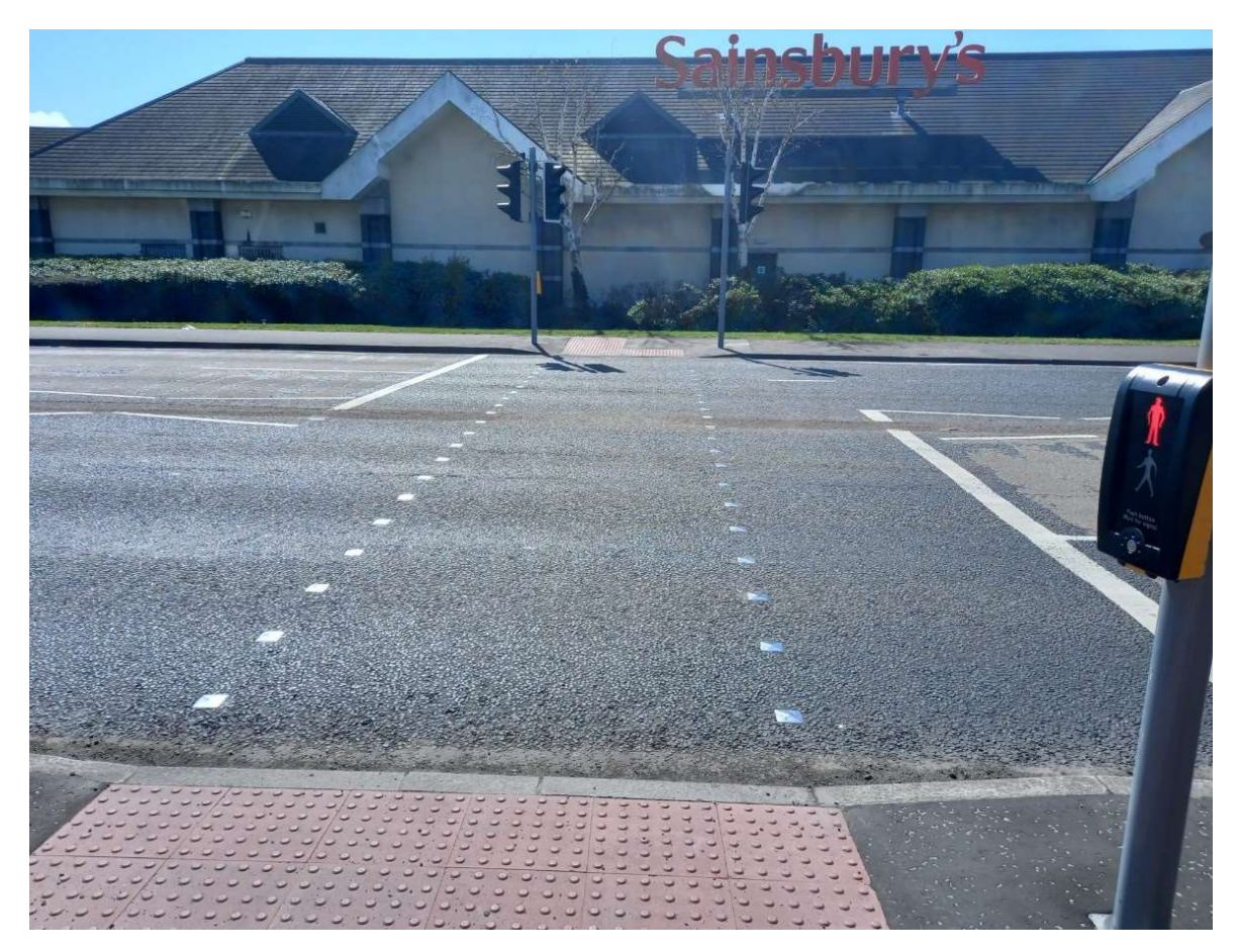
A2 Belfast Road Puffin Crossing

Puffin Crossings utilise the latest traffic signal technology and allows sensors on the pole tops to detect if pedestrians are crossing slowly and subsequently hold the red traffic signal longer to allow pedestrians to cross in safety. In addition, if a pedestrian presses the button and walks away, the controller will cancel the pedestrian request, improving traffic progression and making the lights more efficient for all road users.