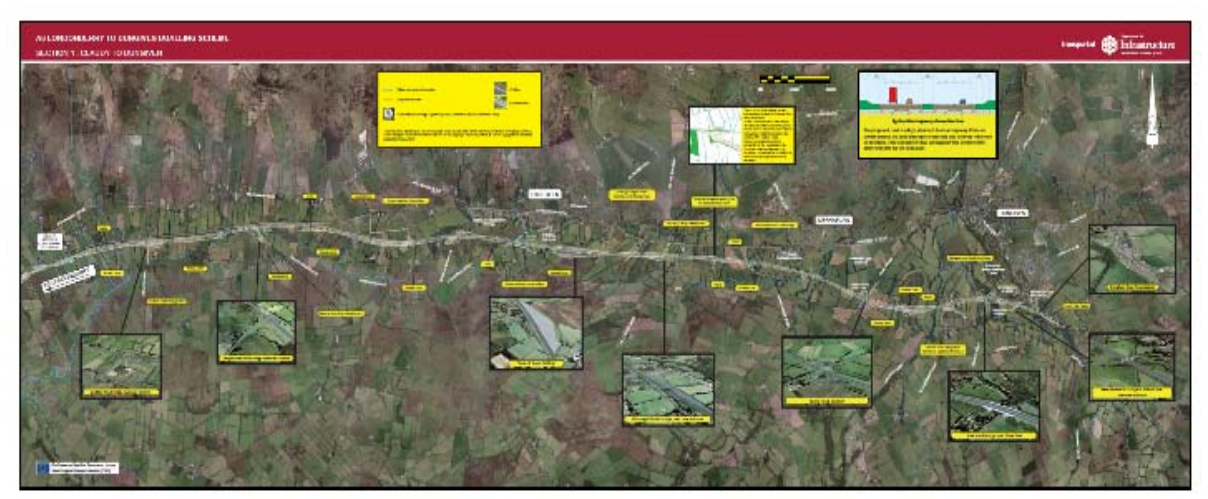
Claudy to Dungiven Section of the A6 Improvement Scheme

Visit <a href="https://www.infrastructure-ni.gov.uk/topics/road-improvements/a6-londonderry-dungiven">https://www.infrastructure-ni.gov.uk/topics/road-improvements/a6-londonderry-dungiven</a> to find out more about the scheme.