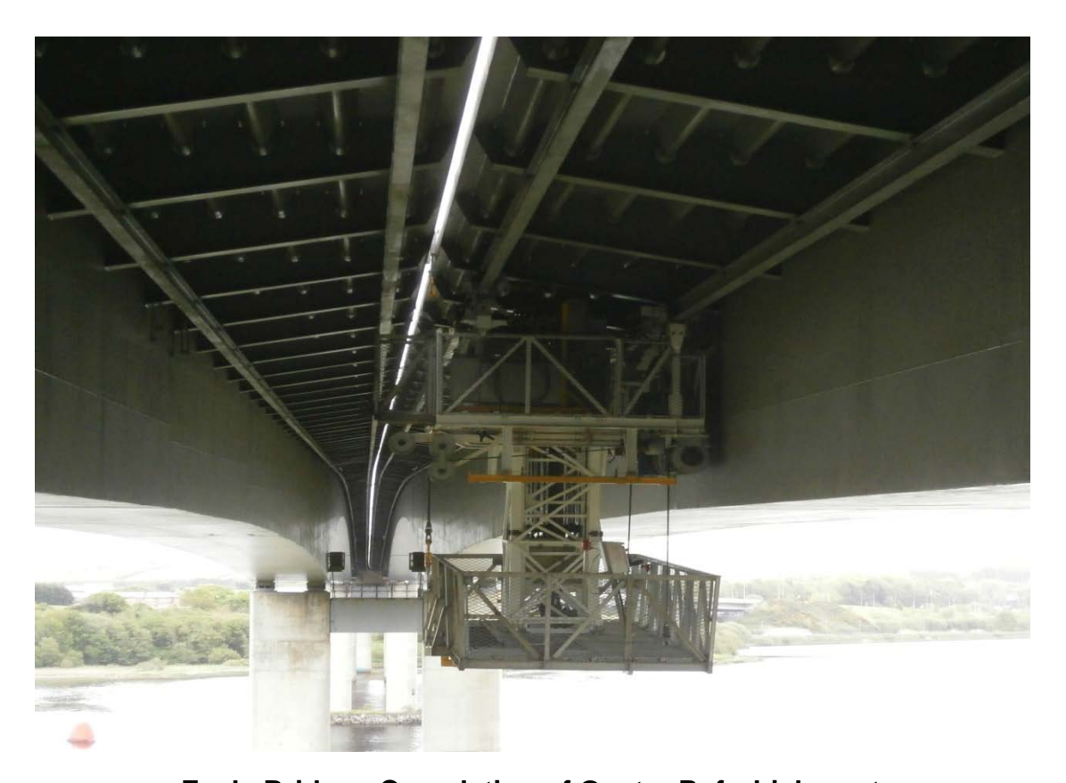
Foyle Bridge - Completion of Gantry Refurbishment

Subject to available funding during 2017-2018 Bridge Management Section intends to carry out work to structures in the Derry City and Strabane District Council area representing an investment of approximately £157K in the local infrastructure.