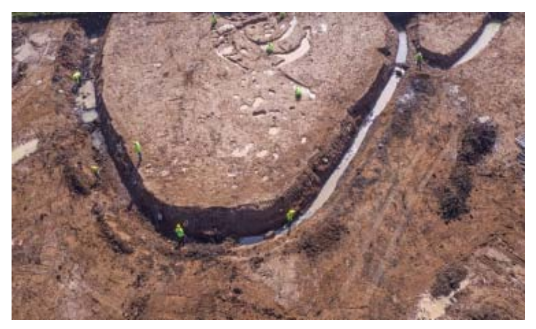
Archaeology Site – Enclosure in Artresnahan townland

The Department, in consultation with NIEA Historical Environment Division, has implemented a significant Archaeological Investigation Strategy to determine the sterility of the site prior to the commencement of any major earthworks. The investigation has recovered a number of important artefacts which will form the basis of a further NIEA publication. The investigations supplement the understanding of the cultural heritage and history of this area. Works on the Randalstown to Toome section of the scheme are progressing, with fencing to secure the site perimeter substantially complete. A significant number of culverts and watercourse diversions have also been completed in readiness for Earthworks this summer. On the Toome to Castledawson Section of the scheme some culvert works and site enabling works are now complete, with Earthworks on the Castledawson to Moyola section to advance through this summer.