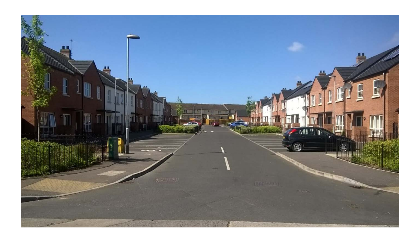
Recently Adopted; Glenabbey Drive