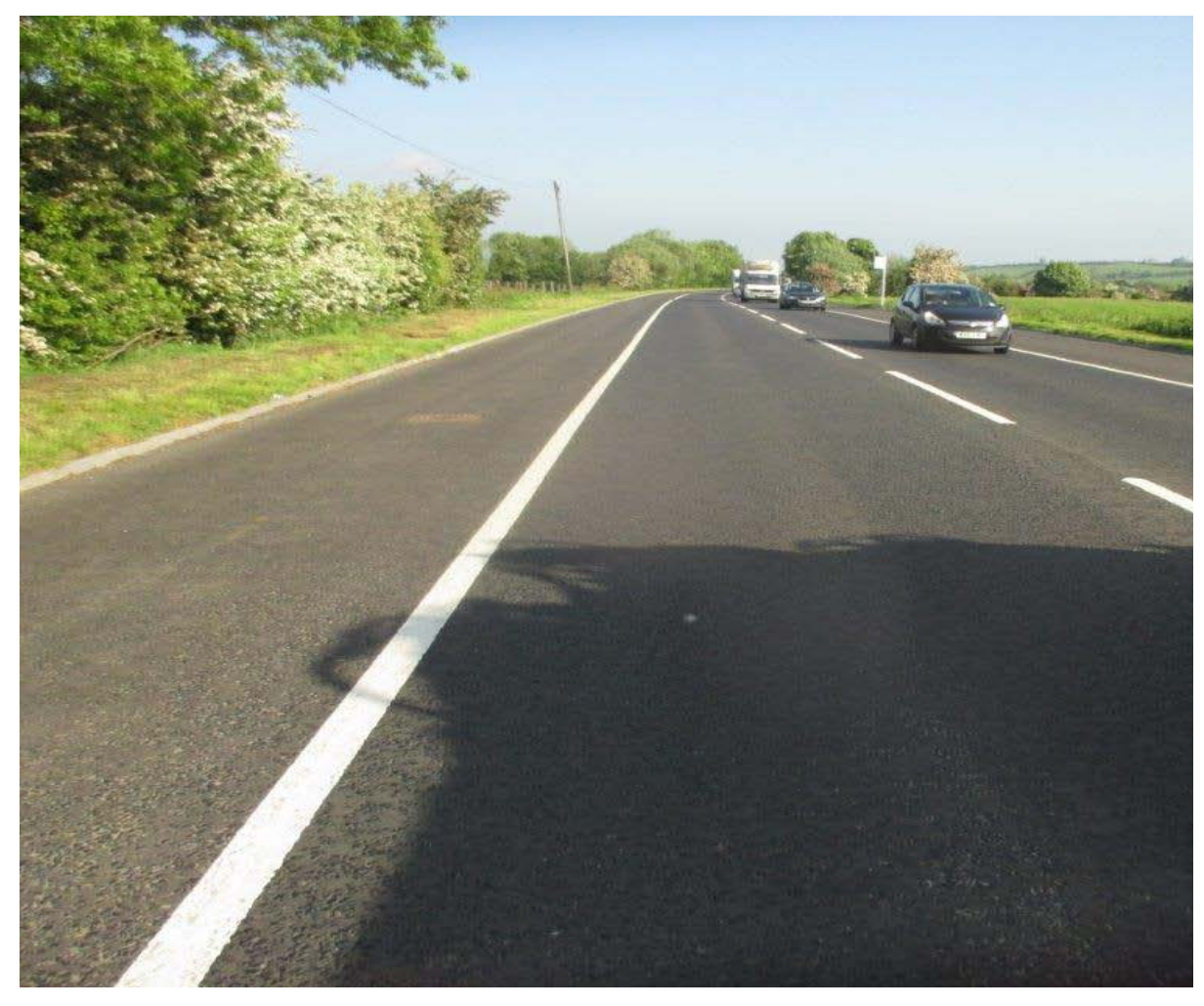
Mulvin Road, Victoria Bridge

55.9 km of road have been resurfaced in the financial year 2016-2017 at a cost of £4.6 million.