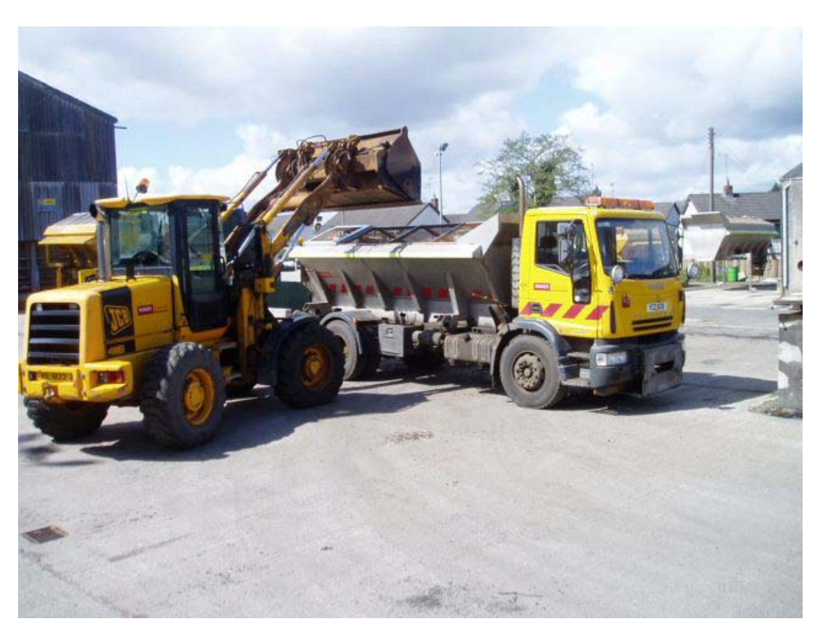
Loading one of the gritting lorries with salt

The winter was milder than previous years but with many marginal nights when treatment was still required. The season had also to be extended due to low temperatures being experienced on 24<sup>th</sup> April 2017.