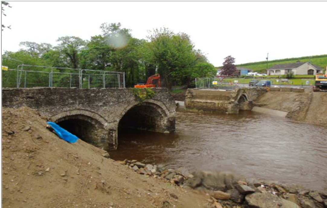
Completion of Ballynameen Bridge

Subject to available funding during 2018-2019 Bridge Management Section intends to carry out work to structures in the Derry City and Strabane District Council area representing an investment of approximately £1.75 million in the local infrastructure.