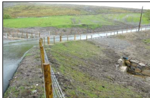
Bridge 60281/B47, Cranagh, Carriageway subsidence, partial spandrel collapse