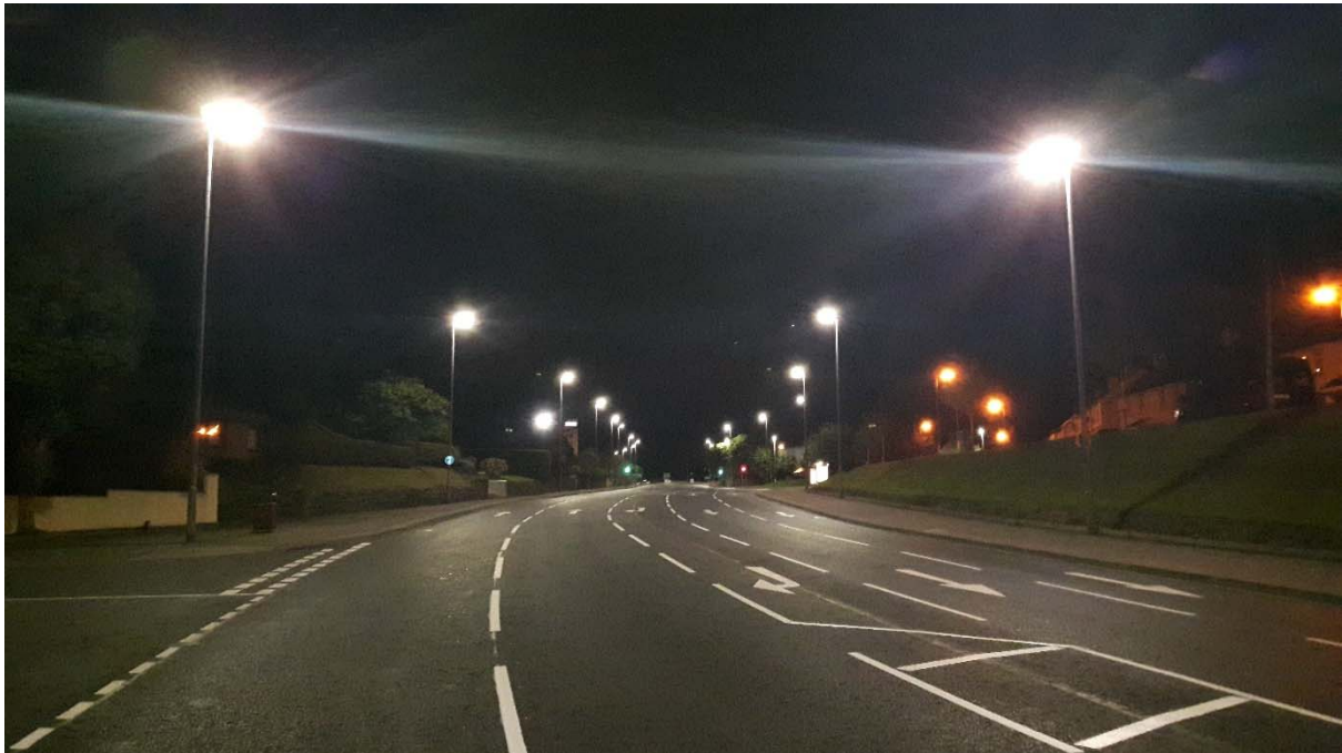
Dungiven Road, L'Derry