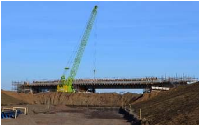
Construction of Derrygowan Bridge

In June 2017 major works began on site with earthworks, drainage, fencing and a number of structures now well advanced. A number of the major junction bridges are progressing with the aim of opening the first section of the scheme between Toome and Randalstown in mid-2019. Completion of the section between Castledawson and Toome is anticipated in mid-2021.