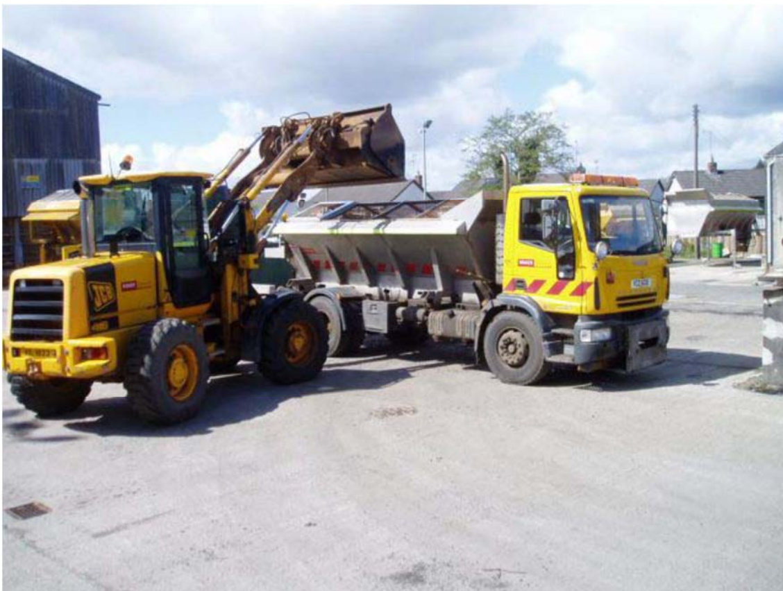
Loading one of the gritting lorries with salt

The winter was much colder than previous years but with many marginal nights when treatment was still required. The season had also to be extended due to low temperatures being forecast for week commencing 23 rd April 2018.