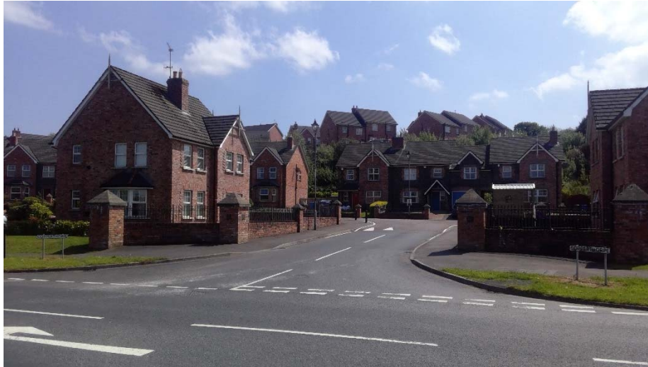
Recently Adopted, Copperthorpe Fincairn Derry/Londonderry