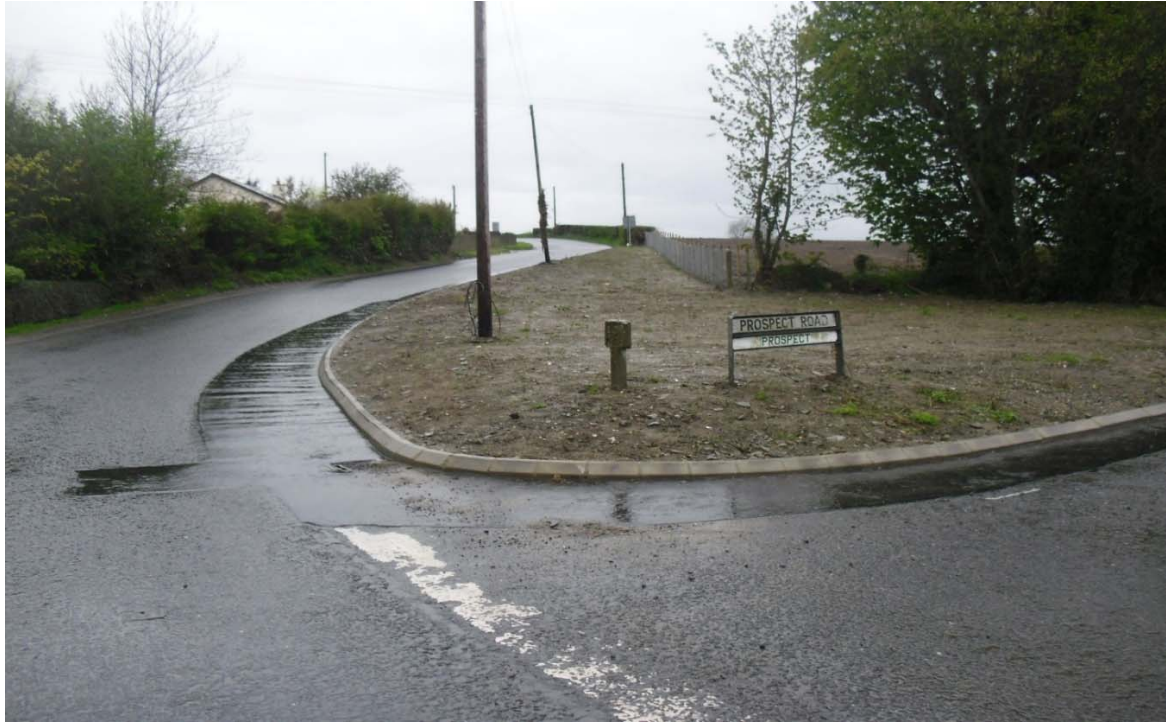
Bellspark Road/Prospect Road Junction