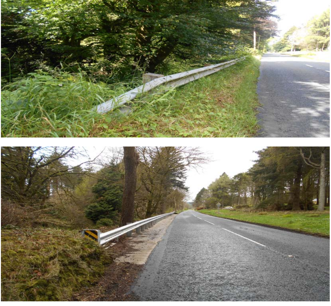
Road Restraint System Upgrade work completed at a total cost of £14,663