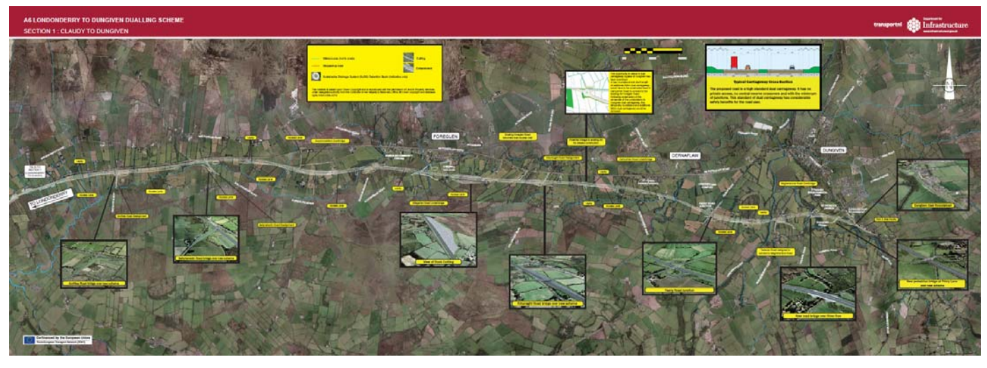
Claudy to Dungiven Section of the A6 Improvement Scheme

Subject to successful completion of the procurement process it is intended that construction of the Dungiven – Drumahoe section would commence in spring 2018.