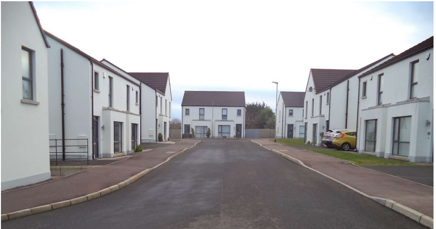
Westbury, Station Road, Portstewart