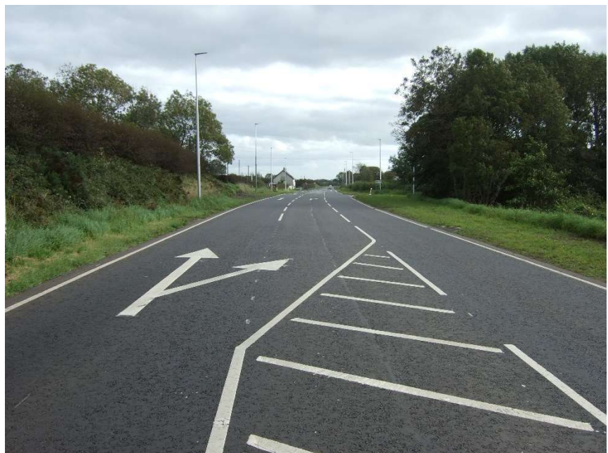
Completed B62 Ballybogy Road scheme at Revallagh