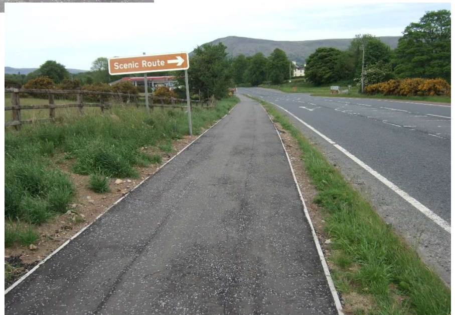
Foreglen Road, Owenbeg - Completed Scheme