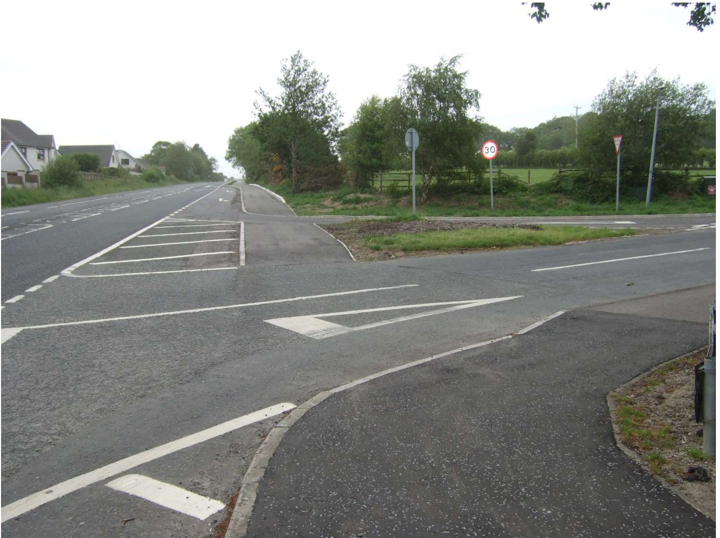
Foreglen Road, Dernaflaw - Completed Scheme

The scheme provided 980m of shared footway and cycleway on the existing hard shoulder along this section of Foreglen Road. These works have extended the existing provision of footways and cycleways at Dernaflaw and will facilitate active travel in this area.