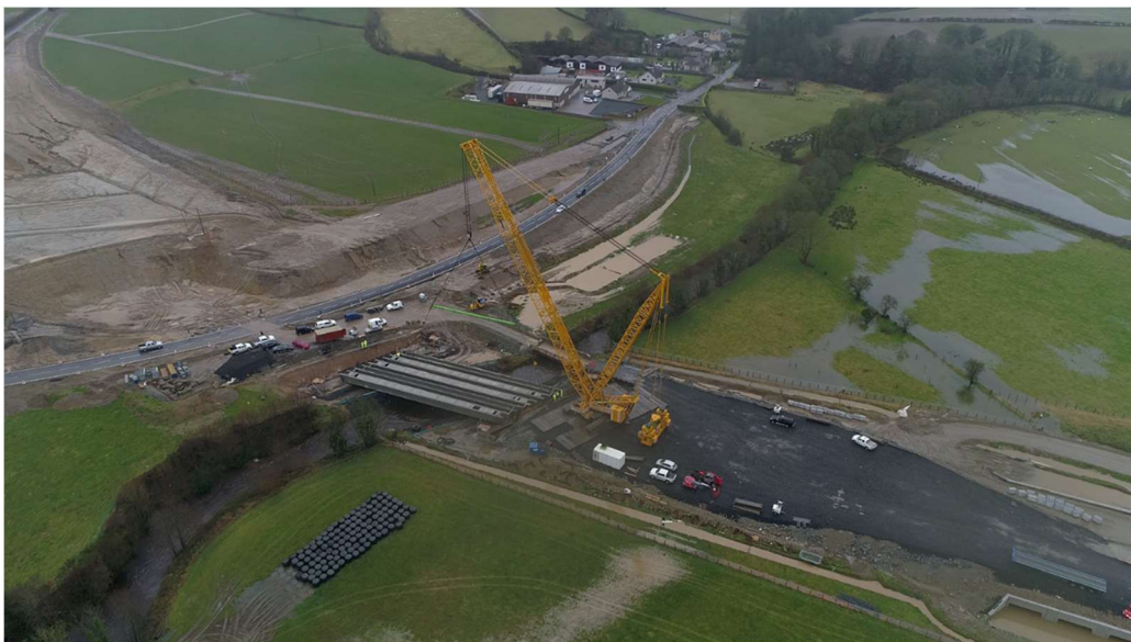
Beams being installed on the Owenrigh River Bridge

For further information on the works and Traffic Management is on the scheme website at: https://a6d2d.com/