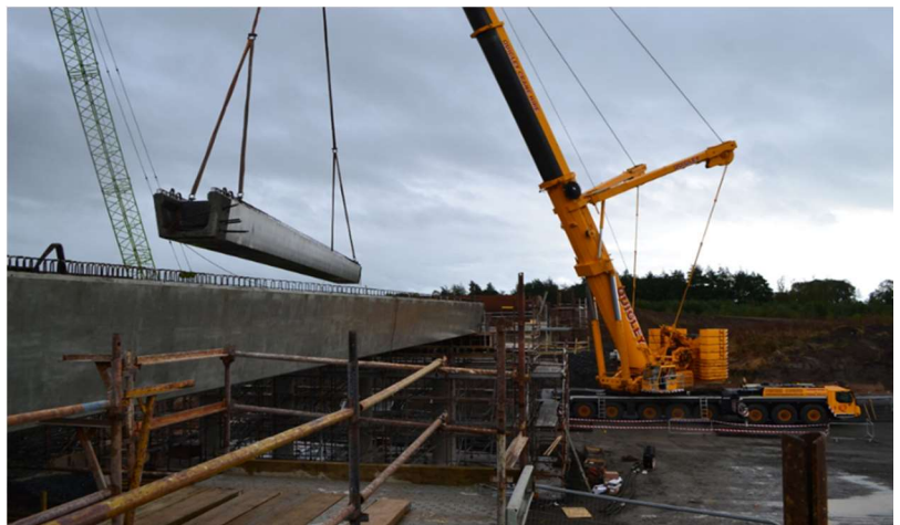
Final beam lift at Hillhead junction overbridge

Works continue on the Hillhead and Deerpark compact grade-separated junctions and it is planned that traffic will be using these later this year. The laying of bituminous roadbase and binder along these stretches has also commenced. Construction works recommenced on the 18 March 2020, within the sensitive swan area between the Toome Bypass and Deerpark Road.