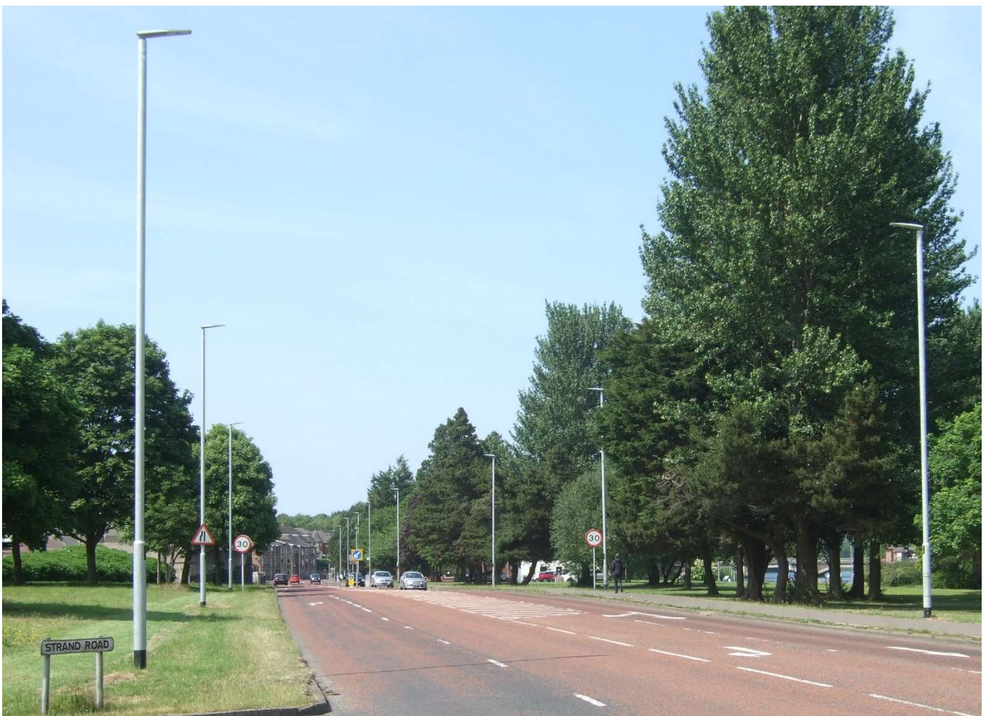
Completed Strand Road Lighting Upgrade