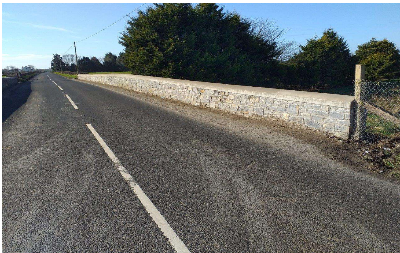
Completed scheme - Ballinlea Bridge, Ballycastle