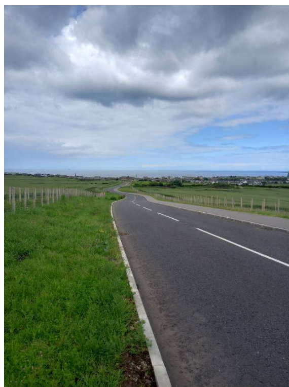
Freehall Road, Castlerock – Scheme Completed