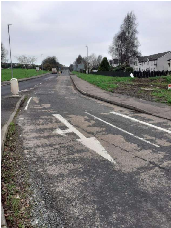
Greenhall Highway pre-construction

This road improvement scheme was completed in May 2022 and included redirecting the necessary utility equipment, as well as construction of an additional lane. This scheme will help to ease congestion along Greenhall Highway at the approach to Greenmount Roundabout.