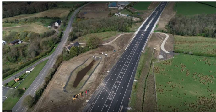
A6 Dual Carriageway at Liberty Glen

Further information on the works and traffic management is available on the scheme website at: https://a6d2d.com/