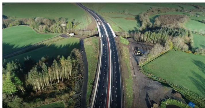
A6 Dual Carriageway over the River Roe.