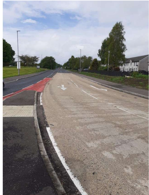
Greenhall Highway post-construction