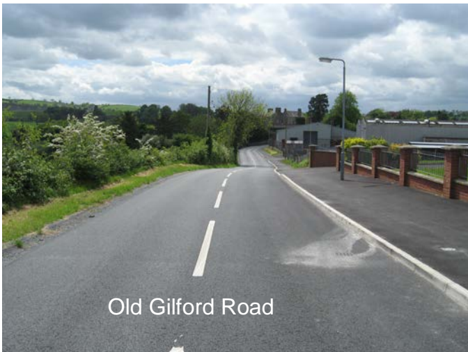
Old Gilford Road