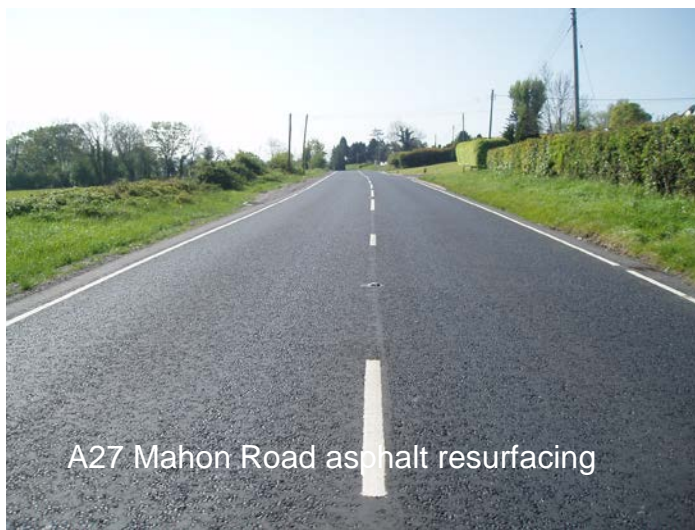
A27 Mahon Road asphalt resurfacing

Across the Council Area asphalt was laid at the following locations during the 2016-17 financial year :-