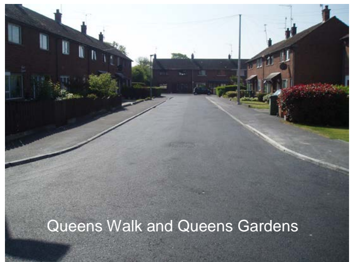
Queens Walk and Queens Gardens