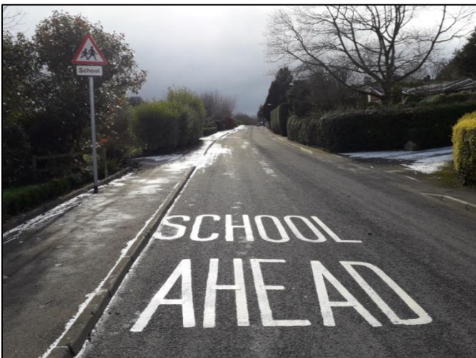
Killuney Park Road, Armagh