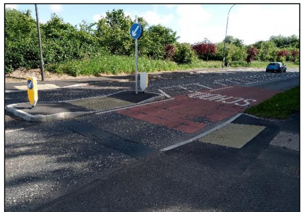
Pedestrian Island and Footway link