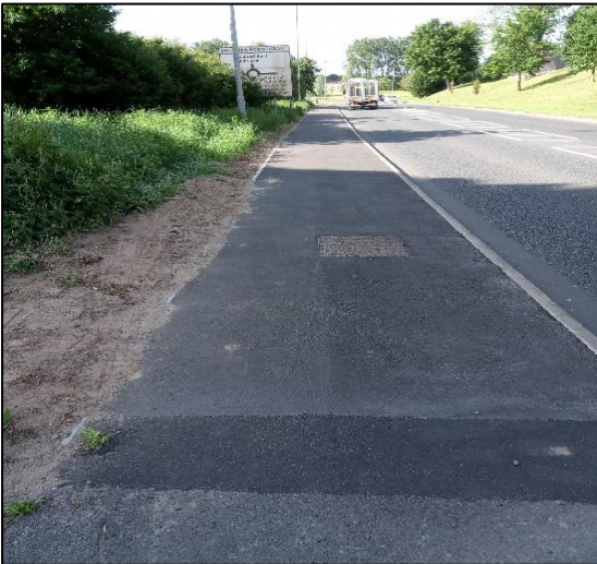
New footway provided at Tullygally East Road