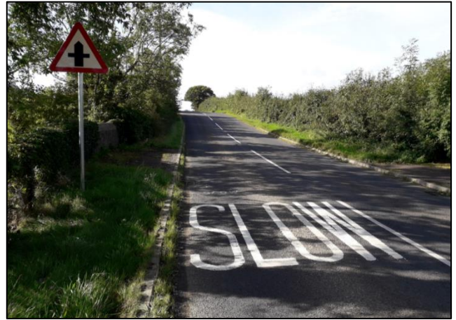
Moyrourkan Road, Markethill.