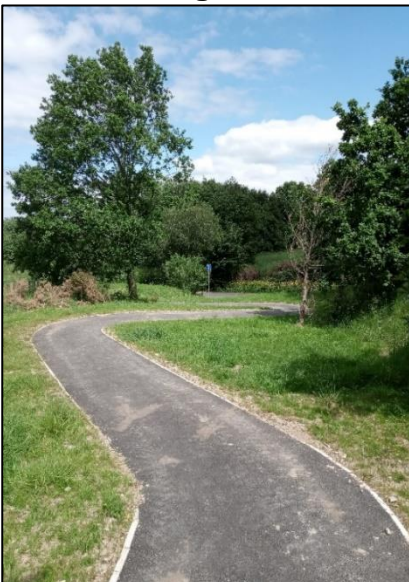
Upgraded Footway and link provided to Bus Stop