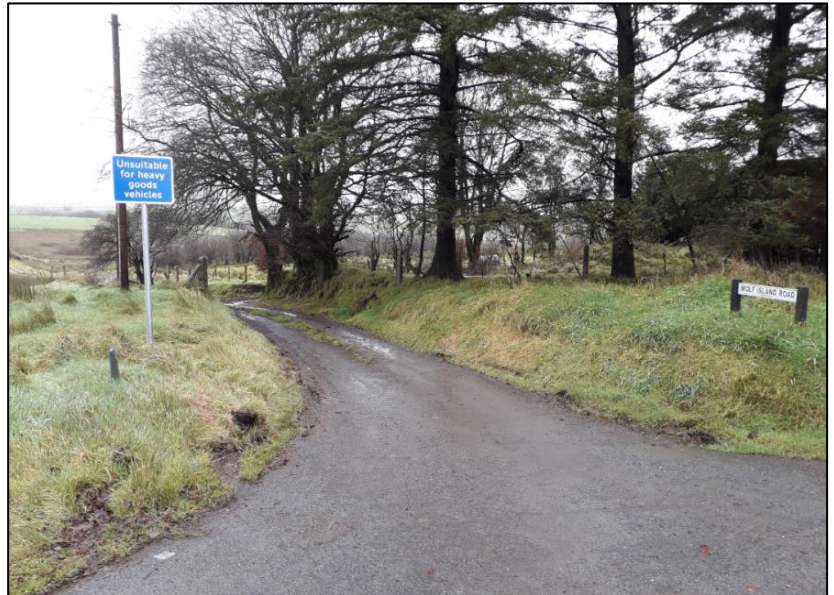
Wolf Island Road, Keady