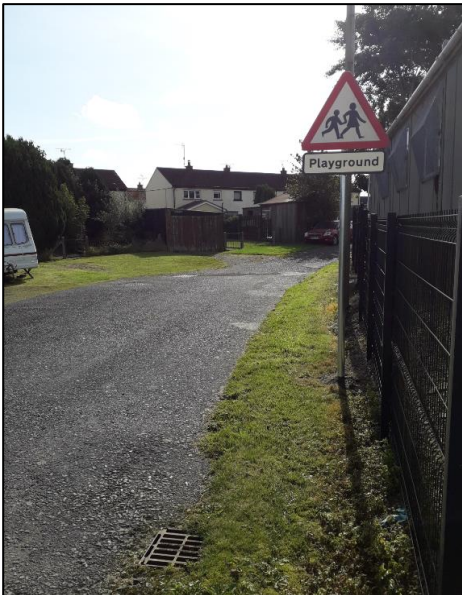
Mossfield Estate, Glennane