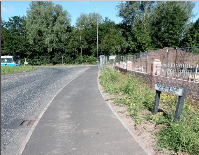
Footway link provided from Brownlow Road to Tullygally Road