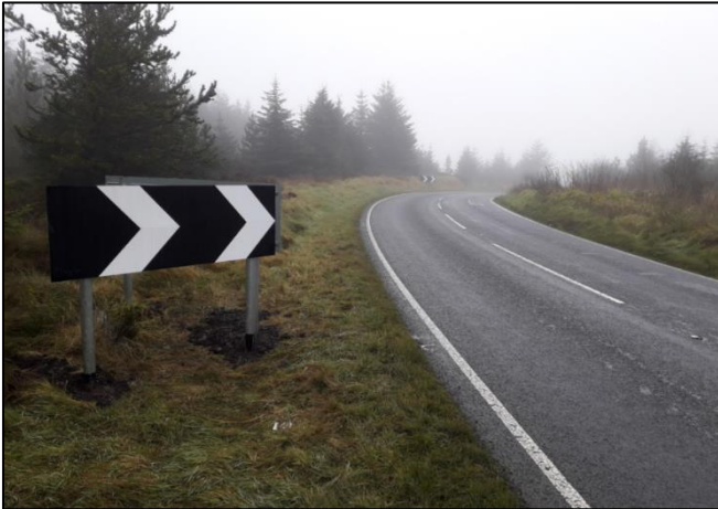
A29 Keady Road, Newtownhamilton