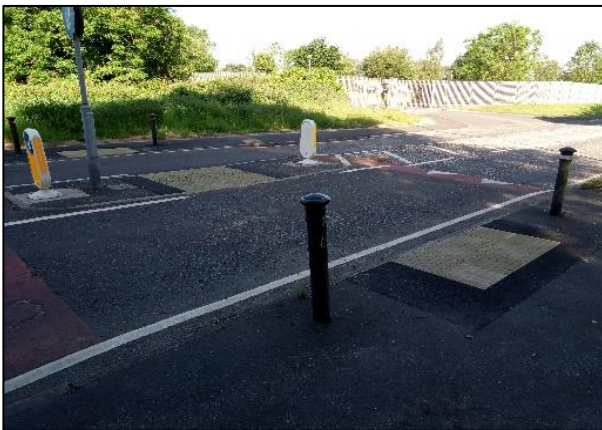
Pedestrian crossing and Footway link to school