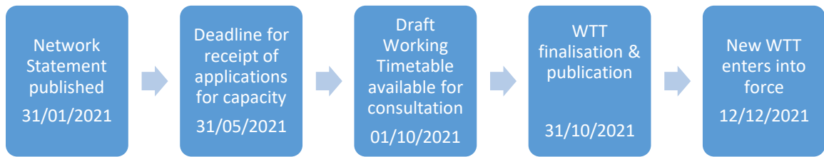
Figure 1 - Allocation Timescales