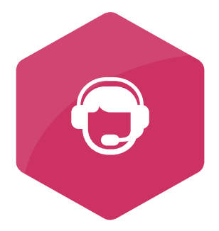
supporting local government to deliver services