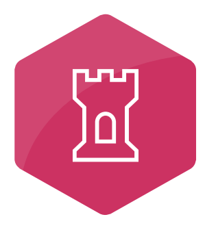
realising the value of our built heritage