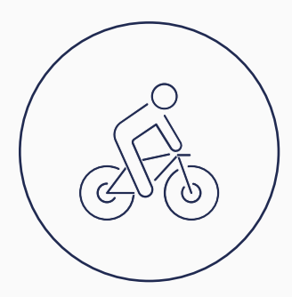
Launched 'Active Living a new Sport and Physical Activity Strategy for Northern Ireland'.