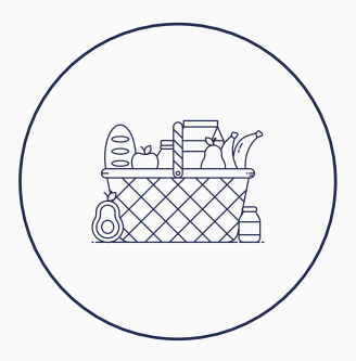
Continued to pilot 5 Social Supermarkets [with a rolling total of 300 participants at a time ].