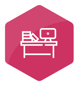
providing free access to books, information, IT and community programmes through our libraries