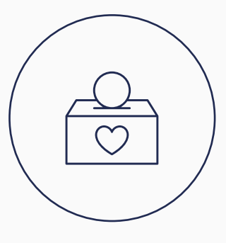
Delivered Charities Bill and Independent Review of Charities Regulation.