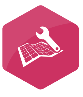
revitalising town and city centres