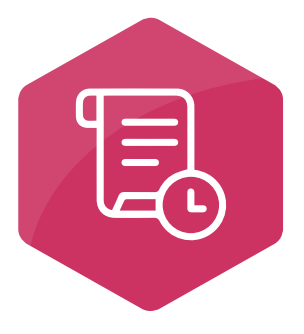
identifying and preserving records of historical, social and cultural importance to ensure they are available to the public and for future generations