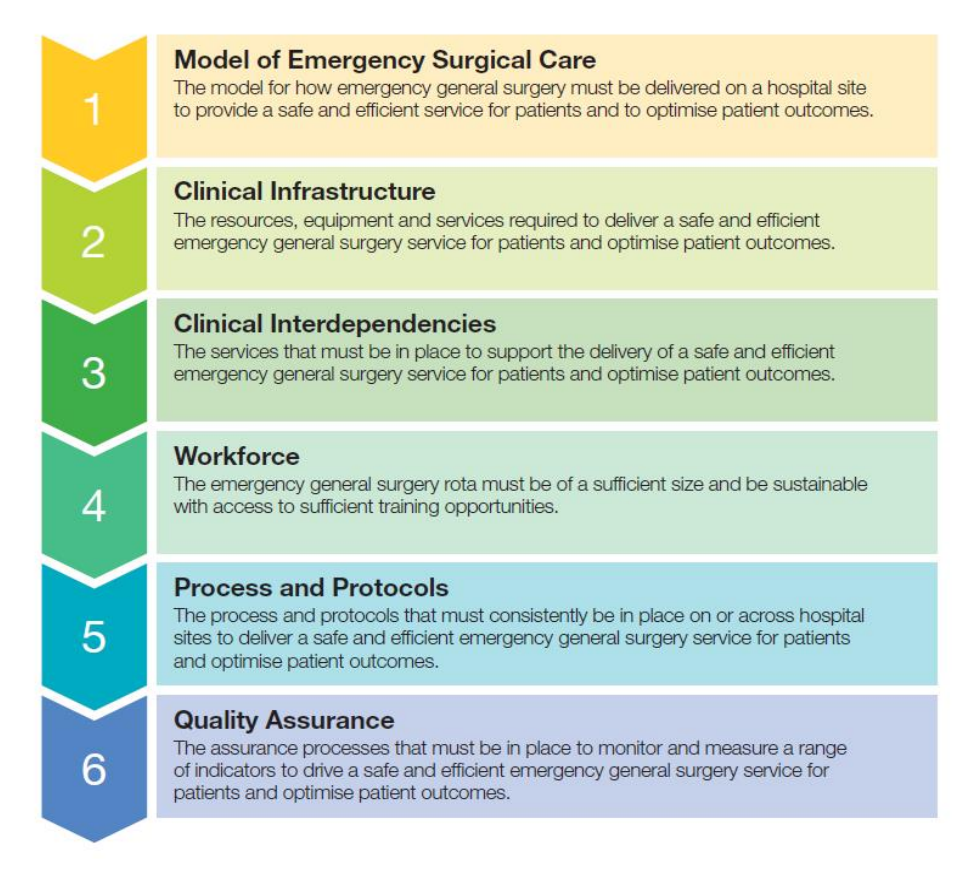
Figure 2: Review of General Surgery in Northern Ireland – Standards and a Way Forward - 2022 – This can be access via the attached link: Review of General Surgery in Northern Ireland | Department of Health (health-ni.gov.uk)