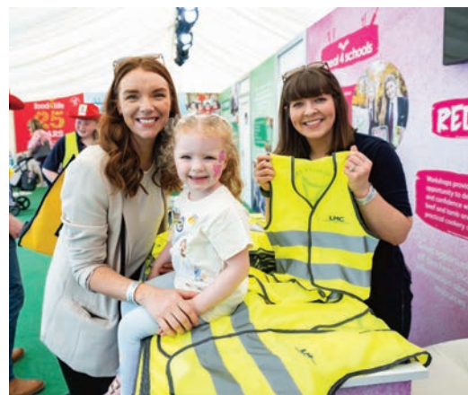
Image 3: LMC distributed high vis vests to thousands of families with children at Balmoral Show.

The silage making season is already with us and the myriad of machinery items involved in this process will feature prominently in fields and on our roads from now right through and until the autumn. The health and safety-related risks associated with silage making are significant. "It is imperative that farmers and