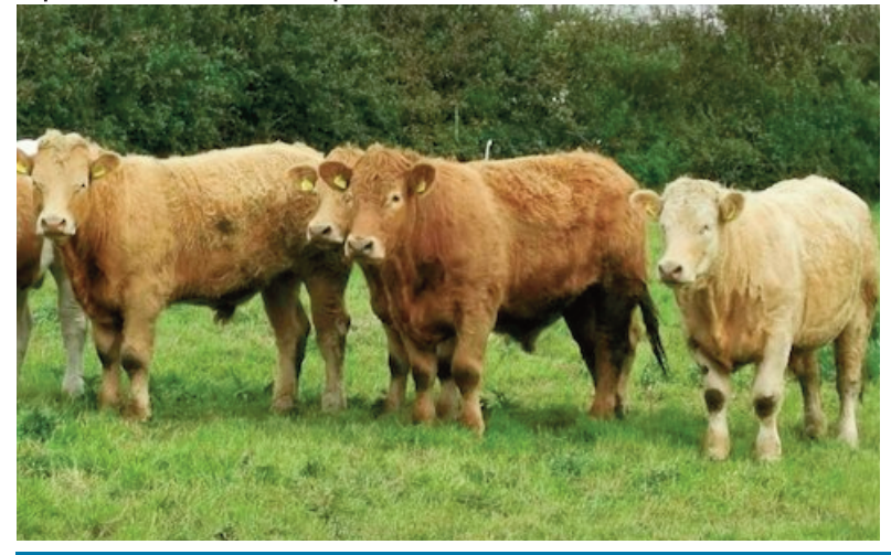
Image 1: There has been a strong increase in the number of beef sired cattle being imported from ROI for further production on local farms.

number of Irish born cattle on local farms as outlined in Table 2 . Cattle for beef production aged from 12-18 months totalled 1,648 head at the end of October 2020, up almost 1,000 head from October 2019 levels.