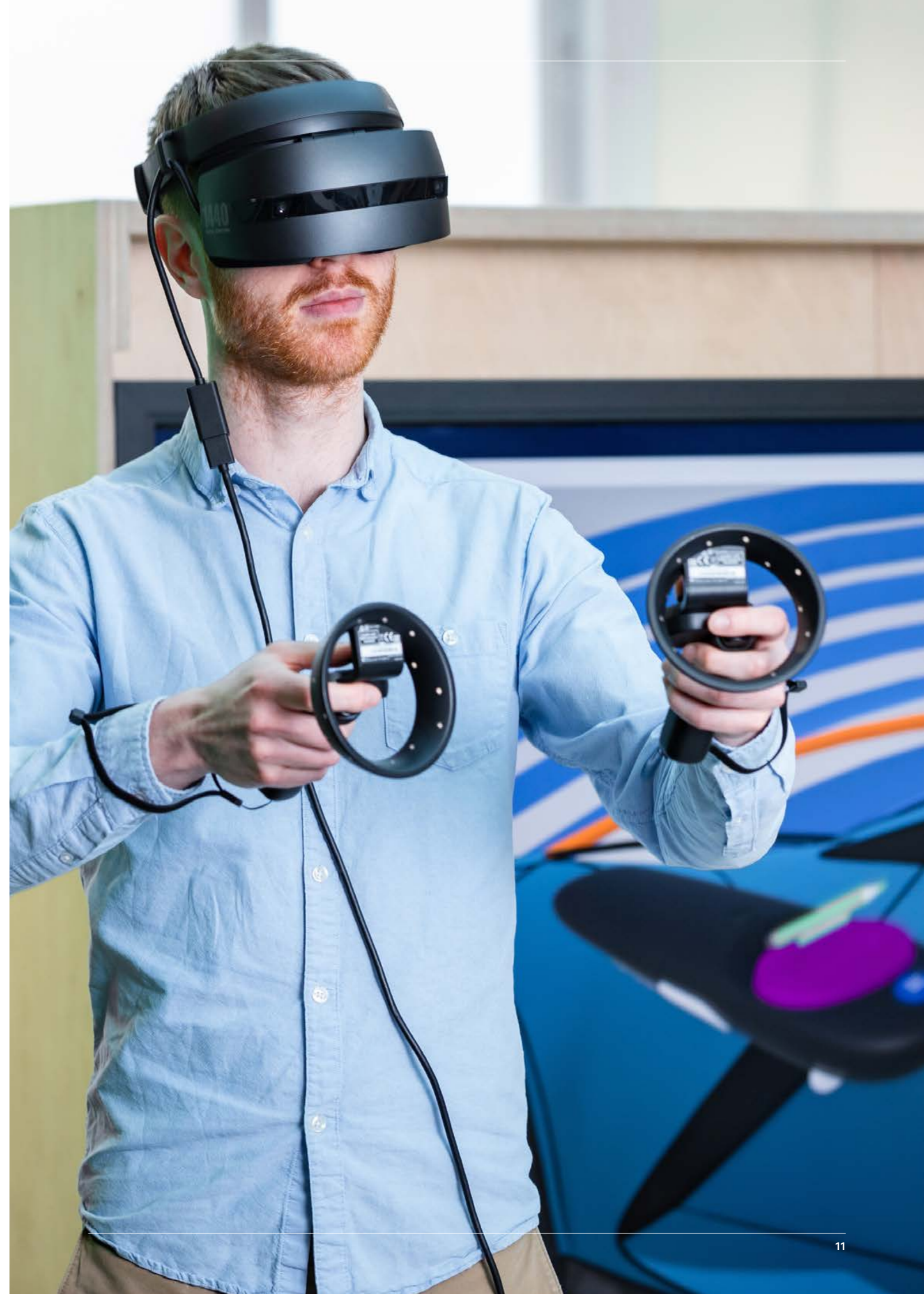
Right Arts Council and Future Screens NI support innovative partnerships using the arts in new and emerging digital, immersive technologies.