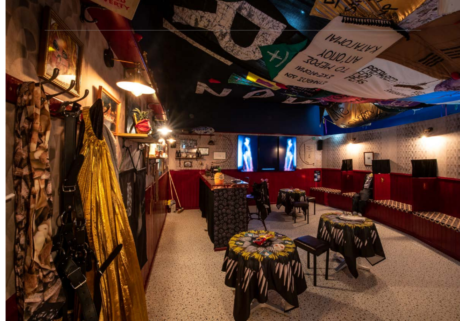
The Druthaib's Ball, Array Collective, Turner Prize exhibition, Herbert Gallery Coventry, 2021.

The additional demands placed on the Arts Council website in 2021-22 simply exacerbated the problems associated with legacy software and outdated technology that currently surround the website. Arts Council will develop a new website and improve access to its services in 2022-23.