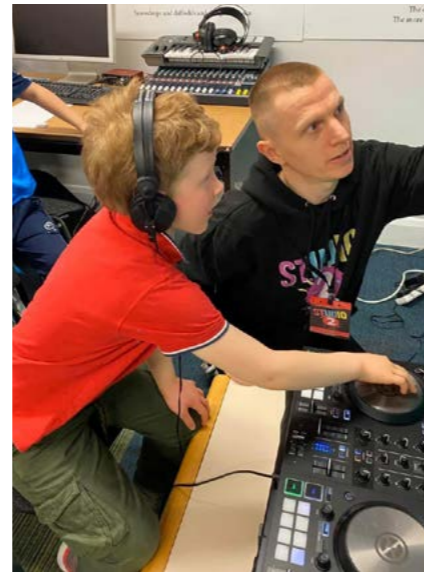
Greater Shantallow Community Arts, one of 13 key arts organisations in the Derry-Londonderry and Strabane area to receive Arts Council support through the Annual Funding Programme

We want the increasing diversity of Northern Ireland society to be reflected in the audiences, leaders, producers and creators of a progressive and dynamic arts sector. We will measure our progress by collecting, analysing and reporting on data relating to the equality and the diversity of the work and organisations we fund. Changes to the Annual Funding Survey's gender identity and sexual orientation classifications demonstrate our ambitions here.