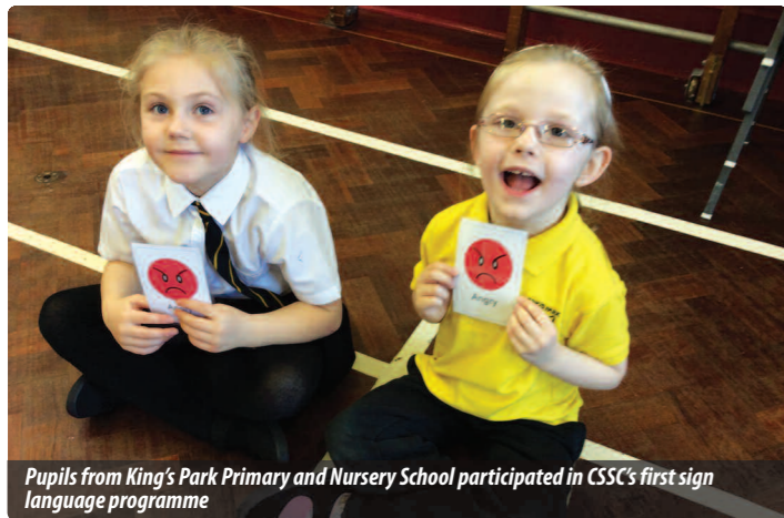
Pupils from King's Park Primary and Nursery School participated in CSSC's first sign language programme

The workshops will raise awareness of the needs of the deaf community and teach basic sign language skills.