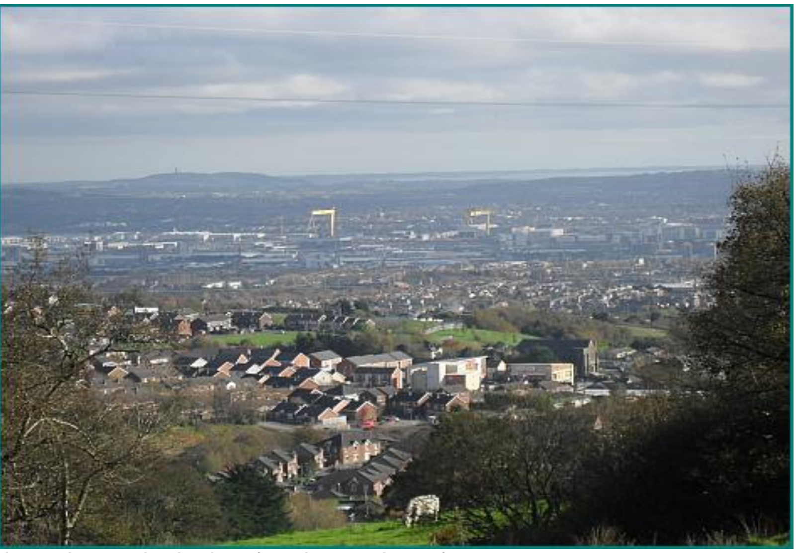
View looking over Ligoniel Village