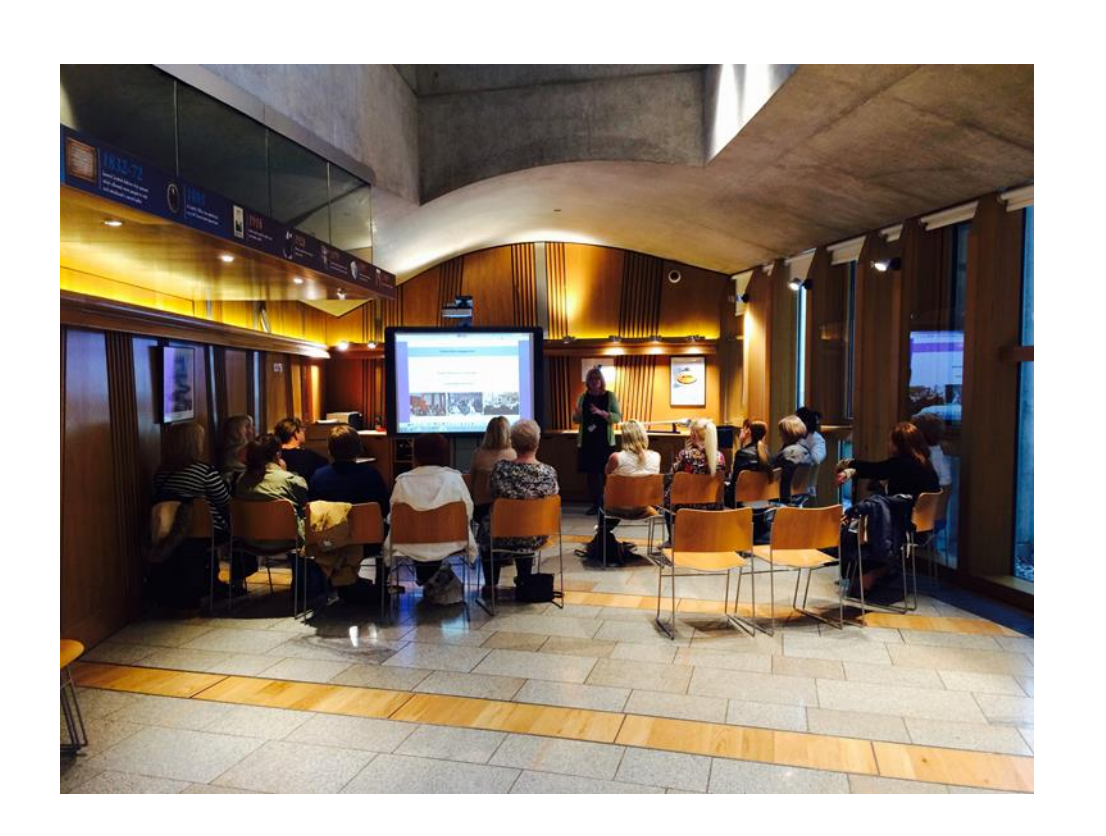
Finding out how the Scottish parliament works