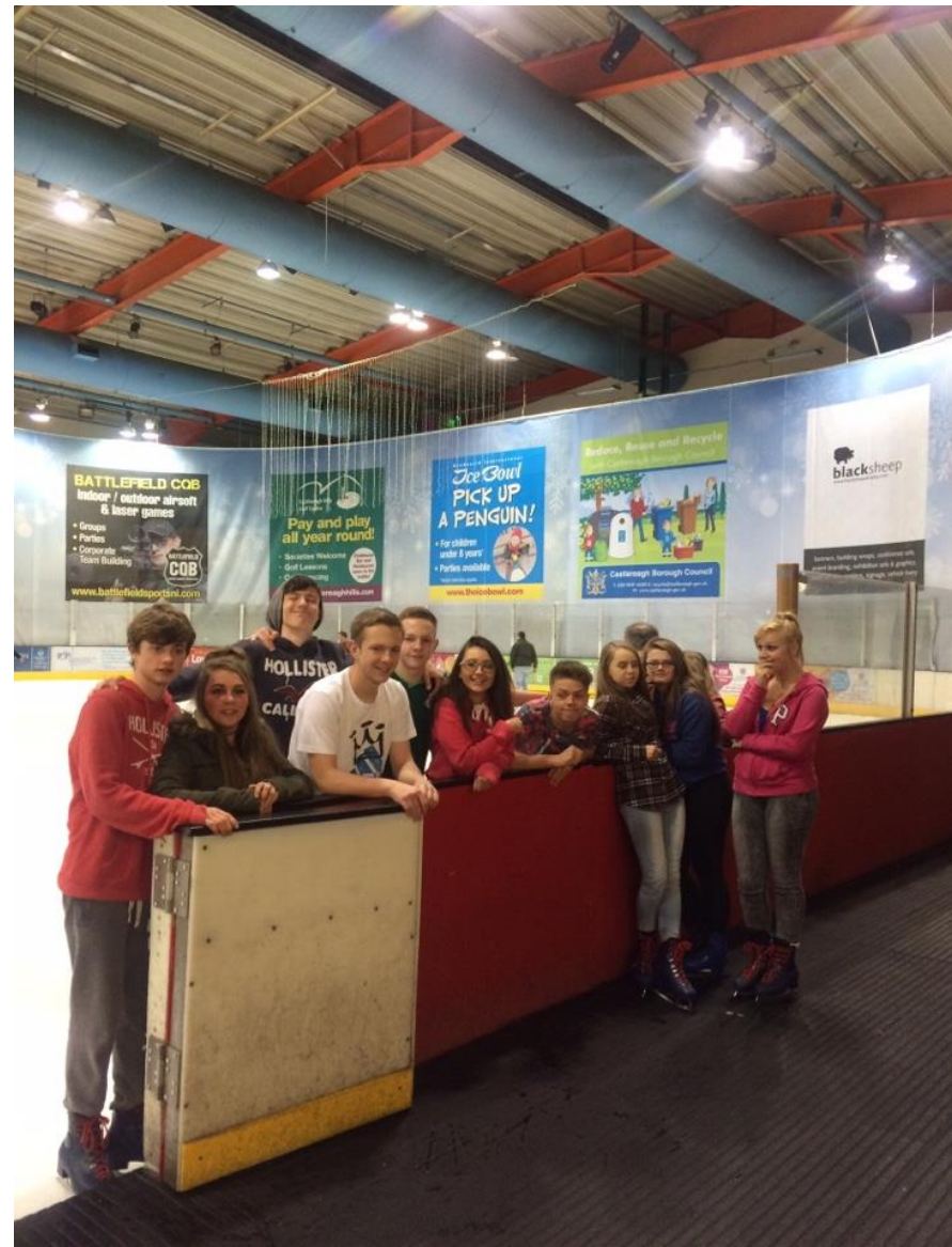
DV8 - Ice hockey