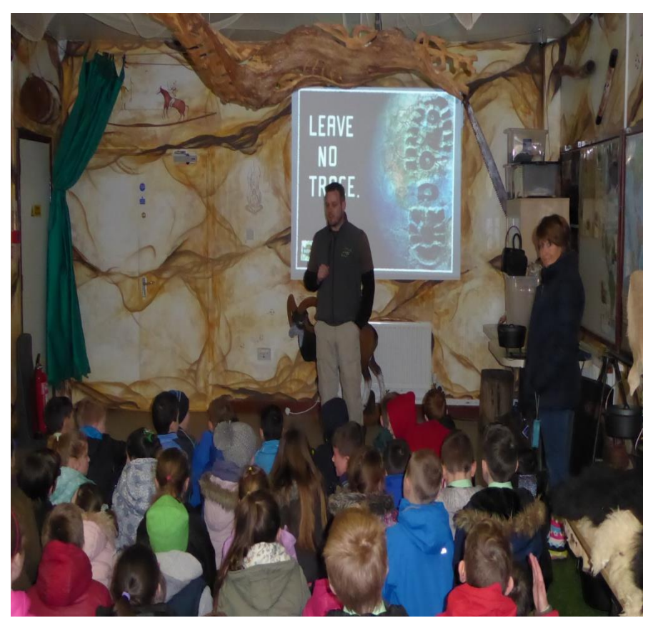
Bushcraft Centre – respect the local environment