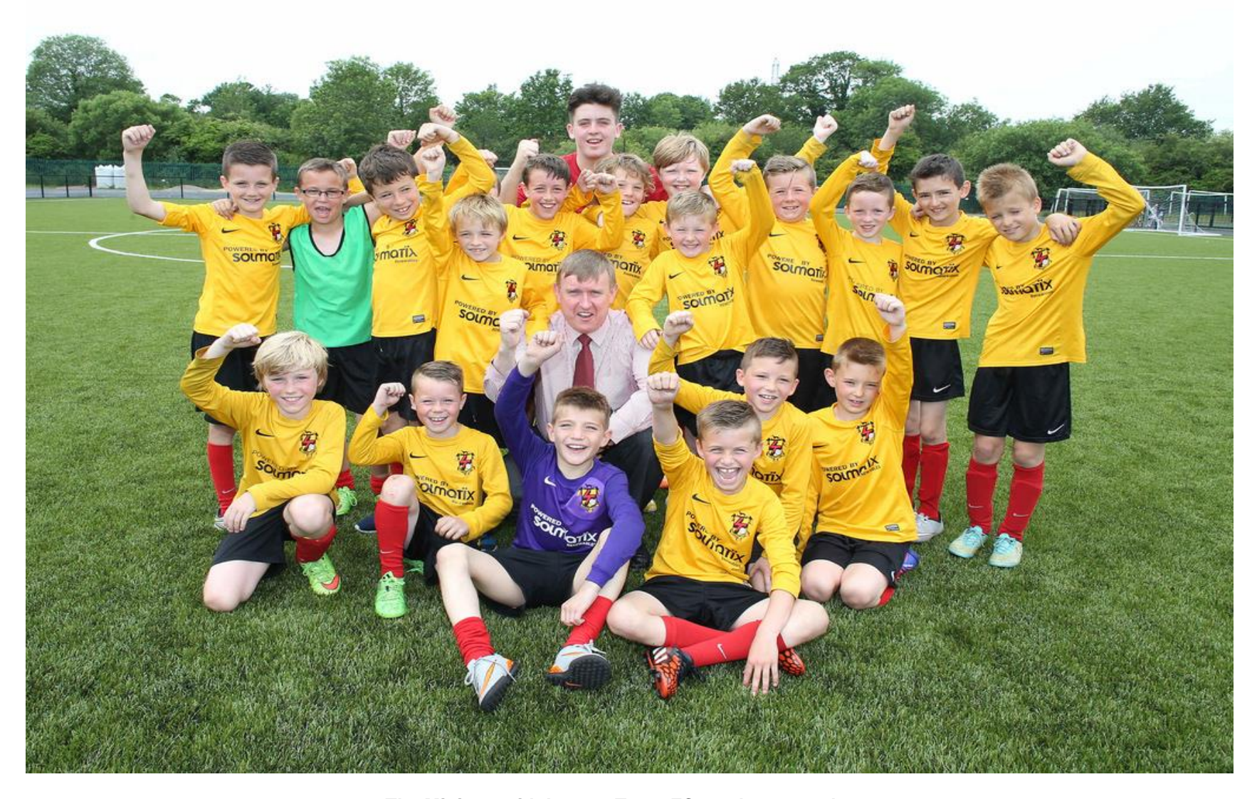
The Minister with Lurgan Town FC academy members