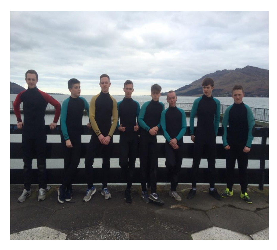
DV8 Youth Sports Residential

For the previous five years the Council have supported several health initiatives in the Neighbourhood Renewal areas through coordination of physical activities including venue hire.