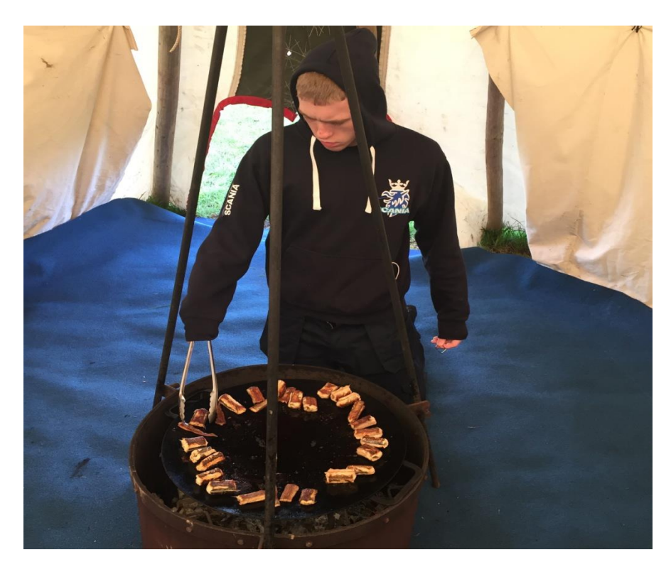
Outreach programmes – Bushcraft Centre