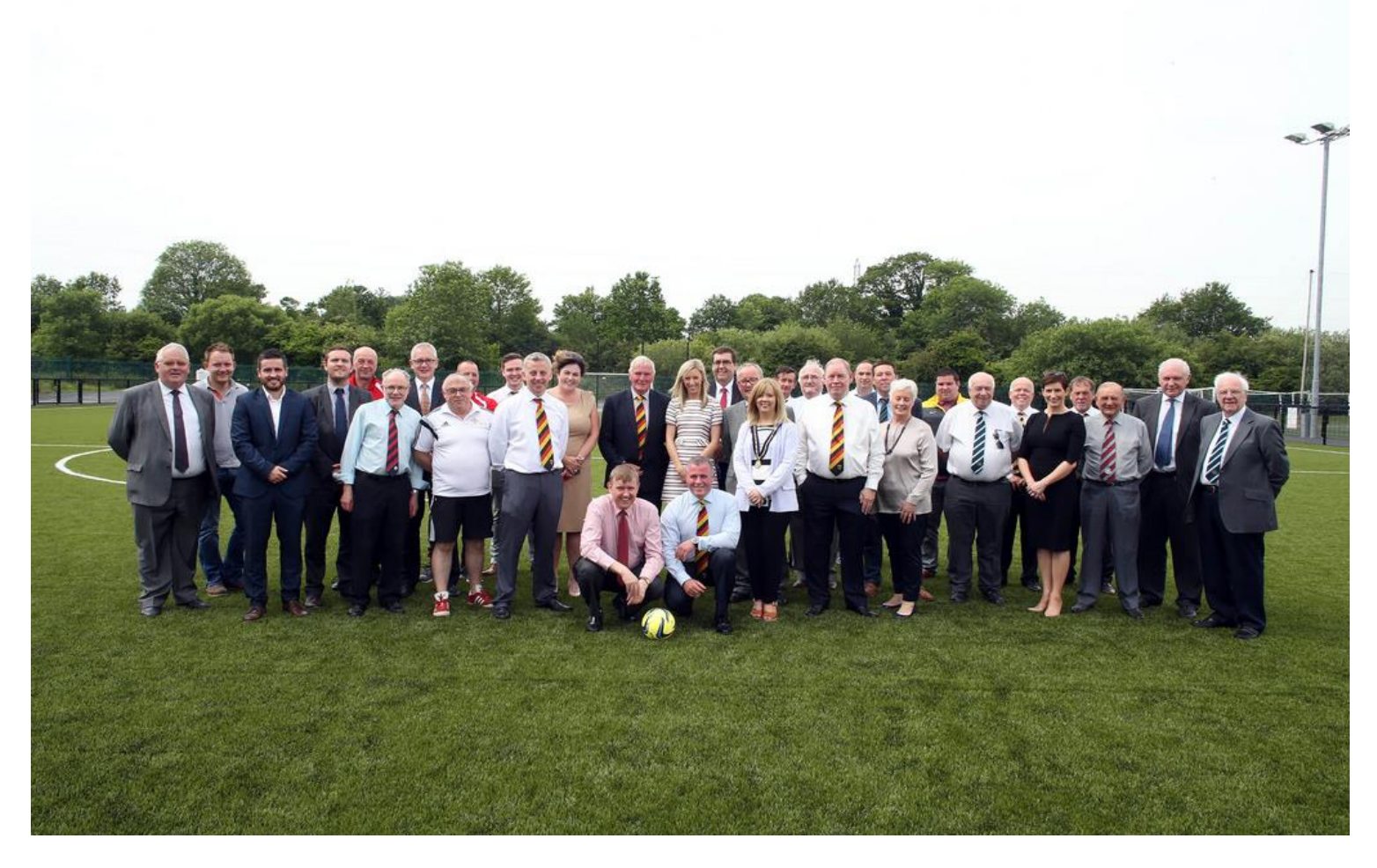
Minister for Social Development, Mervyn Storey MLA, officially opened a new £513,000 sports and community facility at Lurgan Town Football Club on 1 July 2015.

1. Lurgan Town Football Club – redevelopment – this project involved the construction of a modular building clubhouse with kitchen and social area, (ii) tarmacing of the car park, (iii) replacing damaged fencing, (iv) construction of a half size 3G pitch and (v) replacement of the flood lights.