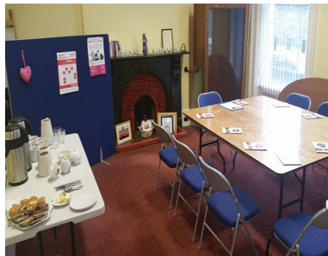
Newly furnished counselling/meeting room