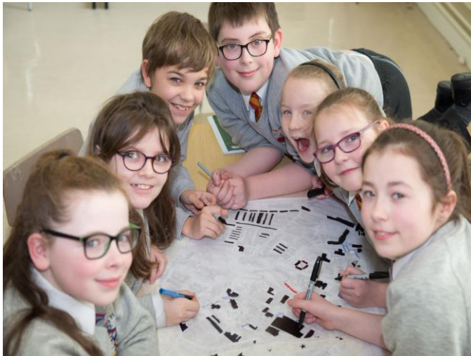
Children visioning the future

The Fountain Primary School is vital to the regeneration and sustainability of the Fountain area and community. The school plays a vital role as a community facility in the past year with numerous meetings and consultations having taken place in the school and with the co-operation of the school. The school council members took part in Urban Village consultation workshops, which they thoroughly enjoyed. The children have fully availed of programmes run by Council to recognise diversity and inclusion.