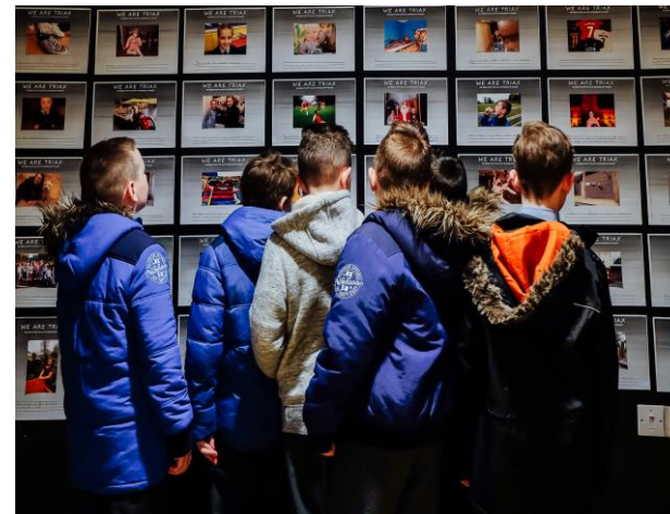
Schoolchildren at 'We Are Triax' Exhibition