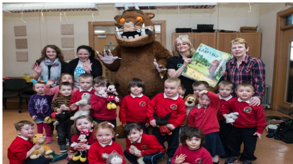
Local school children engaged at Creggan Country Park