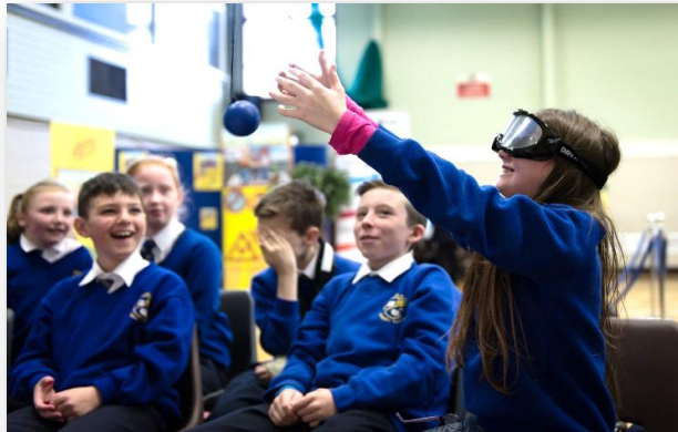
Children enjoying the YES Programme

Just under 1,500 young people across Derry and Strabane took part in the YES - Youth Educated in Safety – Project over the past few months. The project, delivered by Shantallow Community Resident’s Association and funded by Derry and Strabane PCSP, Department for Social Development, the Council’s Community Relations Programme and the Housing Executive, provides a multi-agency health and safety awareness programme to primary school children in the area. Shantallow Community Residents Association delivered the YES Project in the Long Tower Youth & Community Centre with Triax NMT and CRJI on 1st & 2nd March 2016. 10 Primary schools and 230 P6 Pupils from within and near the Triax NRA took part in the YES multi-agency project.