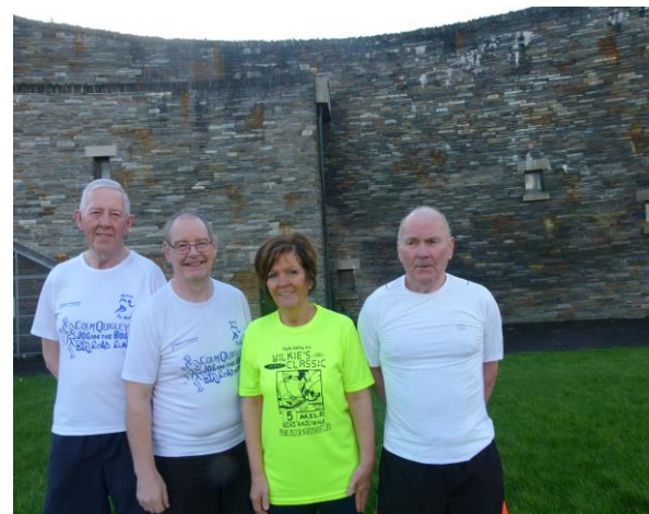
Participants in the NHIP Physical Activity Programmes