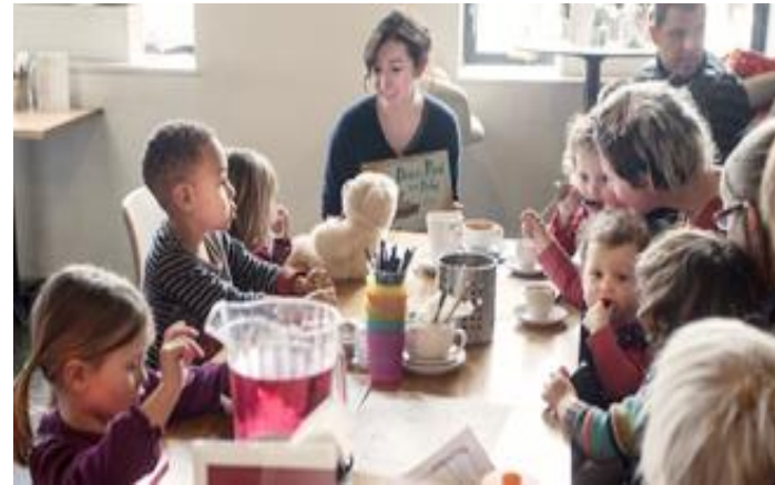
Children Arts & Crafts