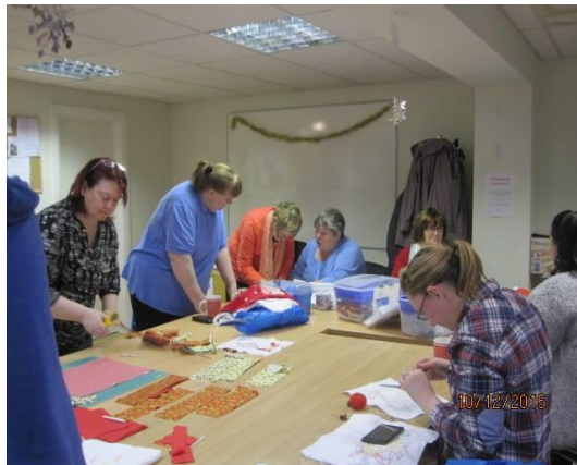
Adult Education Class (Quilt Making)

In 2015/16 CPTT launched the first in their series of new interactive play sessions aimed at parents/carers and toddlers. This BOOK IN A BOX session covered interactive play through sharing stories, creating book boxes, story sacks, singing and rhyme time. The children also had the opportunity to swap their books and to receive a free book also. CPTT invited the Kidz Farm into the playgroup - this is a traditional, mobile petting farm providing interactive fun with a range of farm animals. The kids loved this and even got to groom, pet, hold and to feed the animals. As part of the Adult Education programmes a group made Christmas Quilts, quilted bags and table runners and also took part in a project making baby blankets for the refugee children who have recently been displaced due to conflicts in the Middle East.