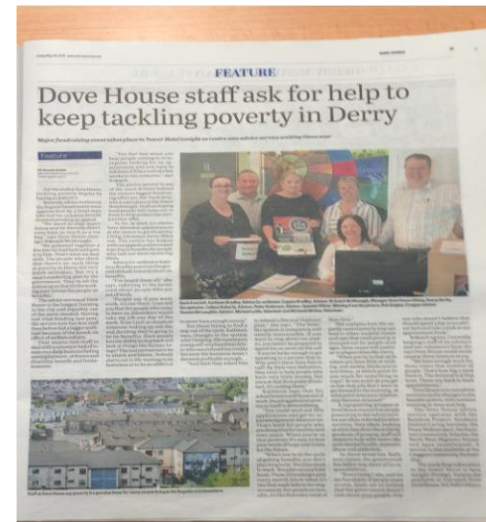
Article in Derry Journal from Dove House Advice Services