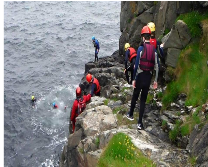
Young people completing an Outdoor Pursuits Programme