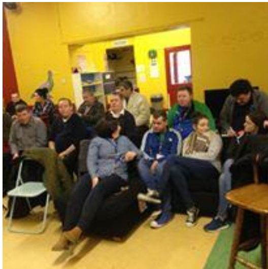
Dove House staff engaging with residents

While a number of projects funded through the General Advice Services provide advice to residents in the Triax area Dove House is the key advice project in this community. Over 2015/16 Dove House Advice Project dealt with 329 telephone calls regarding advice, tax credits per quarter. Dove House dealt with 13,116 issues including benefit advice, DLA, Appeals, Housing, Employment and completed 15 DLA forms per week with approximately 9,000 unique beneficiaries. £9 million was recouped and generated for low income individuals and families as a result of benefit advice or tribunal representation.