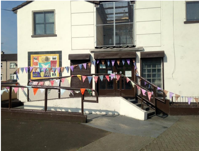
Dove House repainted outside

Dove House Community Trust is one of the key projects in the Triax area providing a range of community, family and youth services. The small grant for Renovation and Decoration to Dove House has been discussed and supported at the Triax Infrastructure Sub-group and endorsed by the full Triax Board. The work will allow Dove House to enhance the facilities and provide a wider range of services to the local community. It is important that community facilities are kept clean, warm and to a standard that exudes professionalism.