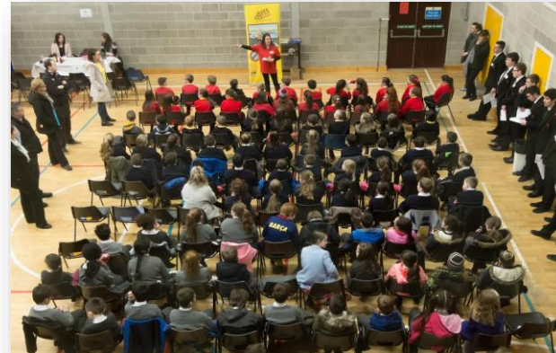
Children from Longtower Youth Club taking part in YES Programme