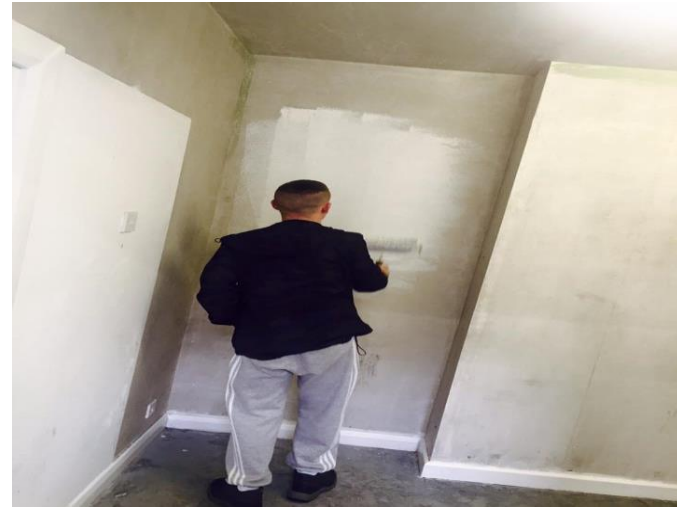
Dove House being redecorated