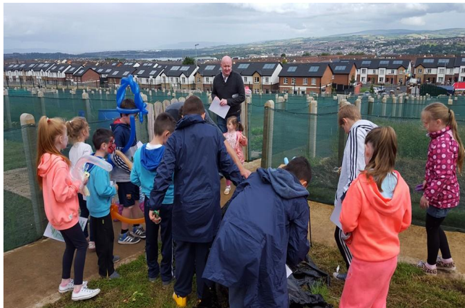
Children and residents at Ballymagowan Allotments

2015 has been a very busy and productive year for Bogside and Brandywell Initiative (BBI), with many changes and developments. The organisation has continued to develop with new projects including the Ballymagowan Allotment Project and Urban Park, creating a new opportunity for partnership with Apex Housing Association. BBI manages the IFI funded Peace Walls and the Tús Maith project. The BBI focus continues to be the physical and social regeneration known as the liveability agenda, which is ensuring people have a better quality of life and live in safe, clean and welcoming neighbourhoods.