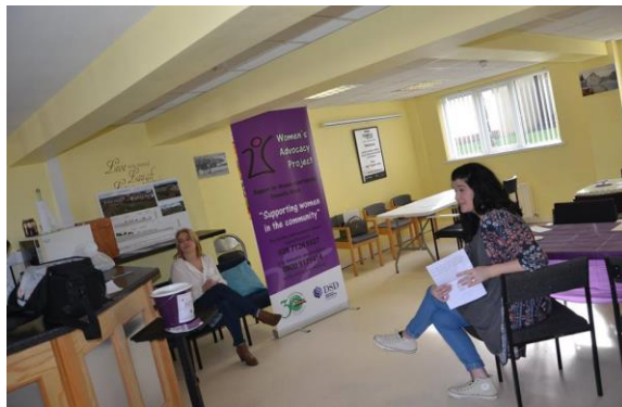
Women's Advocacy Outreach at Hillcrest House

Dove House delivered on the first ever Domestic Abuse Awareness week within Derry during March 2016. Funded by DSD and Awards for All, the initiative rolled out a number of key events that helped raise awareness amongst individuals, professionals and communities in regards to the prevalence of Domestic Abuse in our City. Crisis intervention training was delivered throughout 4 Neighbourhood Renewal Areas to highlight to community workers how they should react when faced with a disclosure of Domestic Abuse. To end the week, the Mayor walked with the participants across the peace bridge holding purple tea lights in support of those who have been the victim of Domestic Abuse.