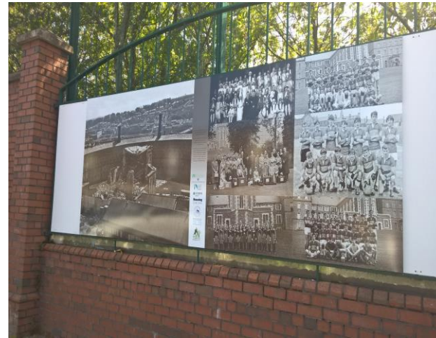
Re-imagining works at Peace Wall at Bishop Street carried out by Cathedral Youth Club working alongside the Triax Peace Walls Project