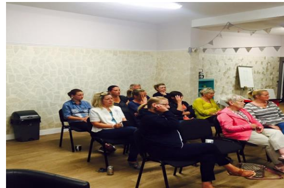
Women's Advocacy Project Workshop