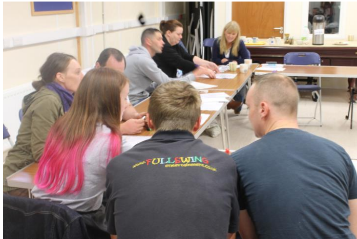
Triax Community Safety Forum

A very strong Community Safety ethos has been established across this area and a lot of good work has been done and continues to be carried out on a daily and weekly basis. CRJI is to the forefront on this work with support from various organisations and agencies. A lot of work has been done over the past year on oil thefts, bonfires and trouble at Derry City football matches. CRJI is the lead contact in this area around Resilience Planning with Council and the blue light services and is the first on the ground in times of crisis like bomb scares or localised flooding.