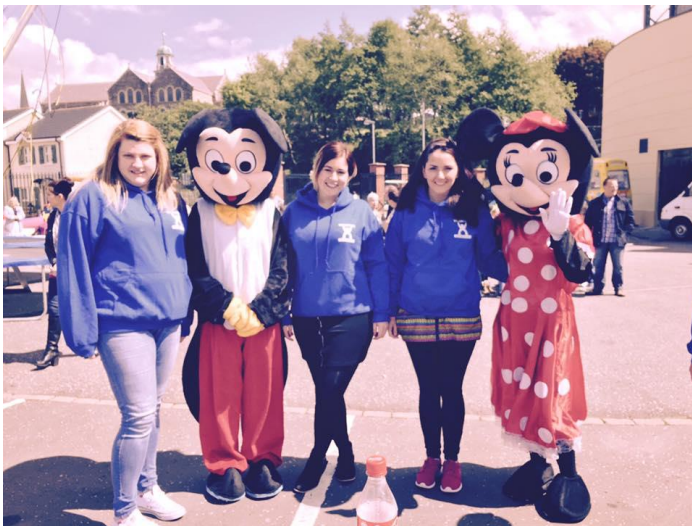
Young Volunteers assisting in a Family Fun Day

The project, through its approach to volunteering and in its ability to interact with individuals at “grass roots” level is a unique programme that works in collaboration with all groups and residents within the Triax area through door to door surveys, one day family events, welfare rights, community festivals etc promoting volunteering. The VIP assisted Triax by collecting 100 surveys and collecting footfall data for the RESTORE Project on Bishop Street without. It has successfully supported 85 volunteers with eight receiving full time employment as a direct consequence of the project, nine community organisations and 80 people received accredited and non-accredited qualifications in the year.