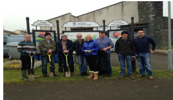
Staff and Volunteers