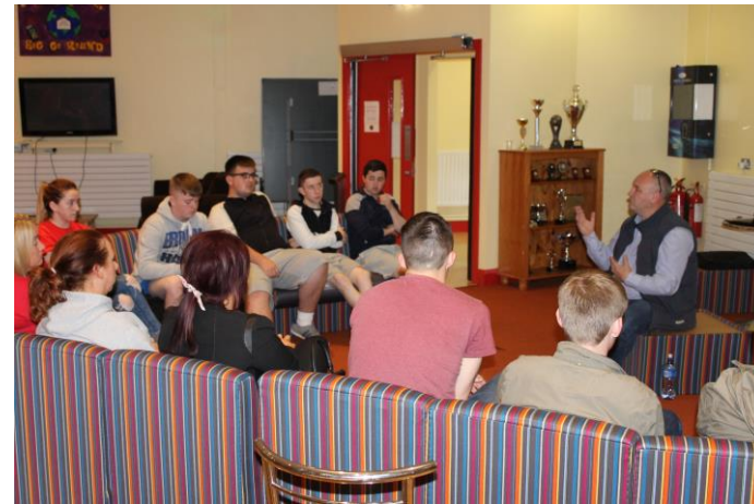
Young people engaging with Londonderry Bands Forum