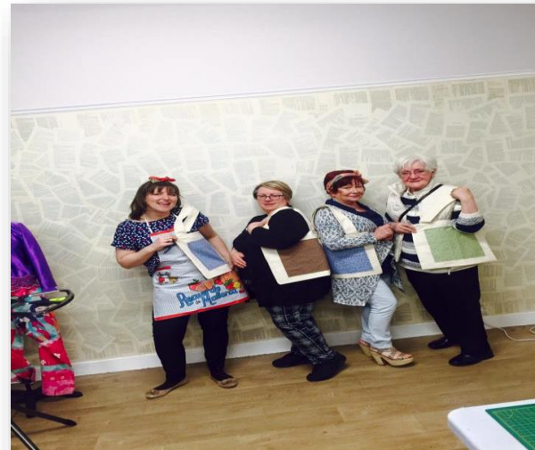
Local Women displaying Handicrafts