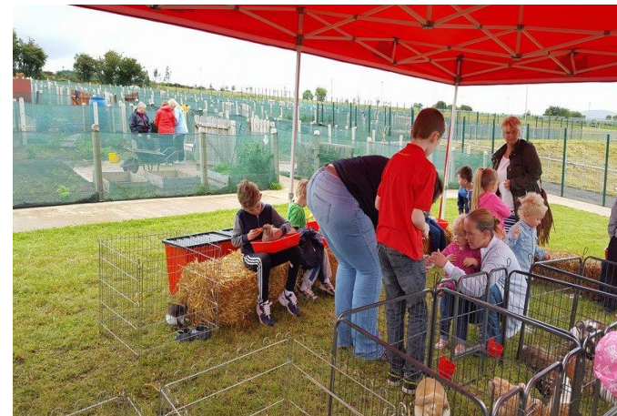
Petting Farm at Ballymagowan Allotments Fun Day