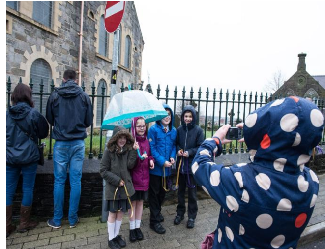
Children taking part in Urban Village Consultation