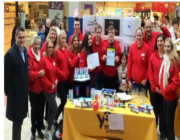
Young people taking part in Young Enterprise Programme