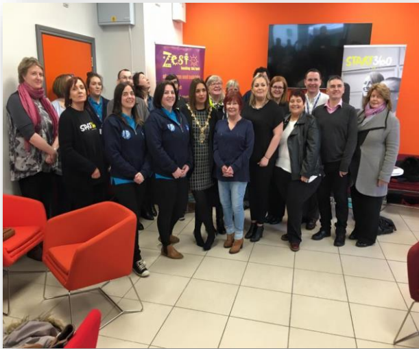
Launch of Women's Hub

Dove House continues to be the lead Community Education Hub within the Bogside/Brandywell area encouraging local people to develop their skills from the most basic level to enhance the opportunity of upskilling, further education, training and employment. Dove House launched its new Women's Hub in March 2016, a community space based at Meenan Square shops dedicated to delivering services for local women. The provision has hosted courses such as Mindfulness, Beginners Sewing and Prescribing Prevention.