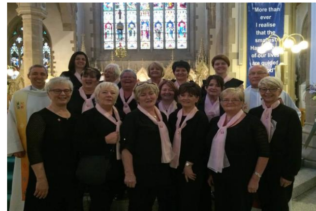
Pink Ladies Choir