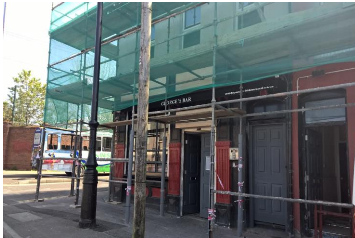
Restore Project on Site

The Restore programme will complement the Public Realm Schemes that has already been completed and the other improvements planned for the street as part of the Urban Village Programme.