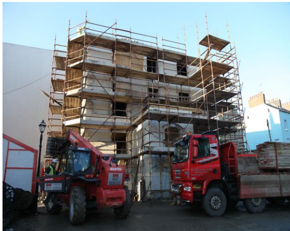
The Manse during the building phase of refurbishment

The growth of An Gaeláras over the last 2-3 years has meant that they have outgrown their current premises and the new Manse building is also fully programmed for 2016 and it has only recently opened. Through this development An Gaeláras is pioneering another phase in the development of the language in Derry by establishing an Irish language quarter-an Cheathrú Ghaeltachta, situated in the Creggan, Bogside and Brandywell districts of the city and stretching from the Cultúrlann in Great James Street through the Bogside to Gaelscoil Éadain Mhóir in the Brandywell and up to Creggan.