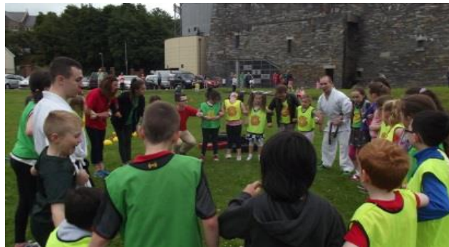
Games on the Gasyard Field

After the completion of capital works to the centre there has been an exciting year developing new programmes, activities and partnerships. The Foyle Sign Language programme has relocated to the Gasyard Centre alongside Drink Wise Age Well and Lifeline offering specialist services and activities targeting the most isolated residents in the community. GDT used the purchase of a Bow Top Wagon as a carriage of creativity to connect people across the city to arts and culture. GDT’s History and Childcare programmes continue to provide first class provision to reduce barriers preventing people from becoming part of community life. The new dance studio is proving very successful with classes in Ballet, Jive, Hip Hop, Street Dance, Roller Blading among others.