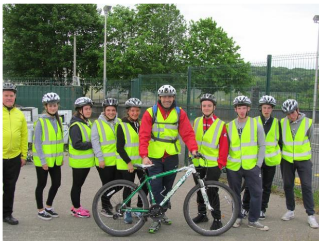
Participants at Bike Week

Across the Triax area in the past year some 1,154 people have participated in a wide range of NHIP programmes including physical activity, grow your own, counselling, stress management, GP referral, cancer support, eating disorder awareness workshops and youth support. Also this year the project actively engaged in a number of campaigns including bike week, men's health week and Movember. With additional funding from the PHA a further 41 people benefited from the GP referral programme.