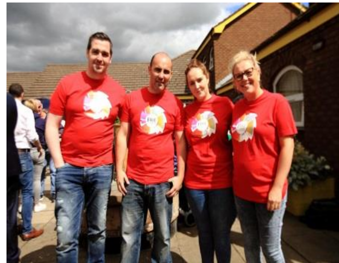
Volunteers at House in the Wells