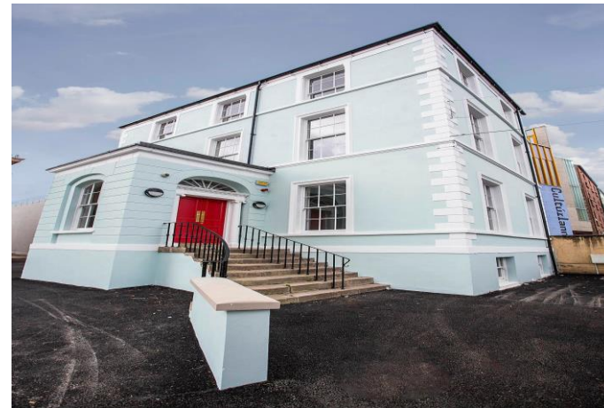
The Manse fully refurbished