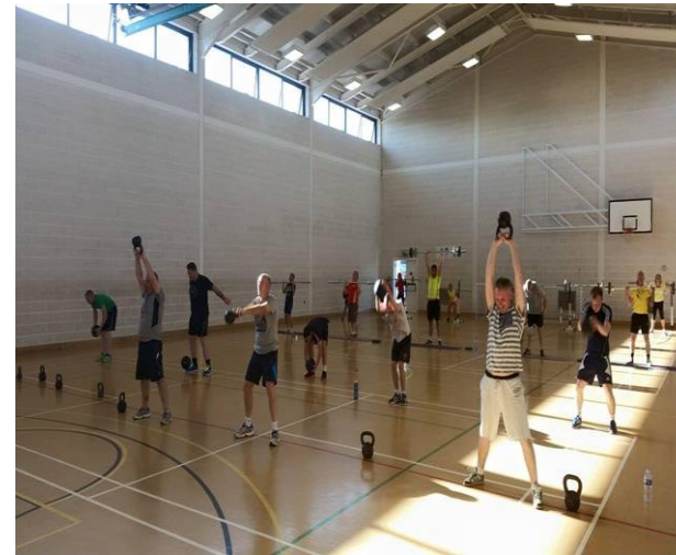
Participants at an Exercise for All Programme