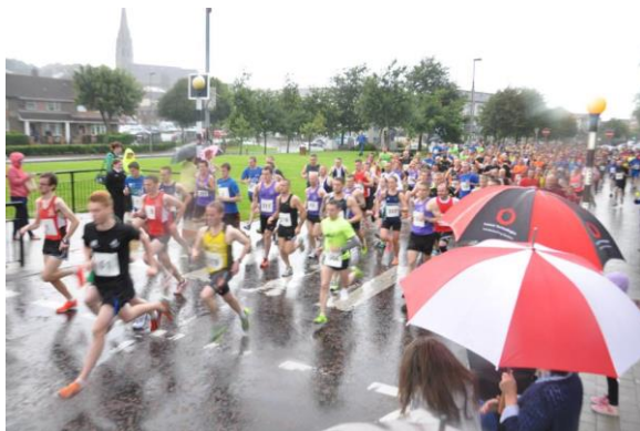
Jog in the Bog

The Active Citizenship Through Sport programmes is crucial to the delivery of some of the most innovative and groundbreaking programmes run in this community. This funding has enabled both the Health Sub-group and the Youth Sub-group to build meaningful collaborations and partnership across the Triax area with community and statutory sector organisations to come together to deliver programmes for Older People, Summer Activity Programmes and Health Programmes for hard to reach groups of young people and men. Over 800 people have taken part in these programmes in 2015/16.