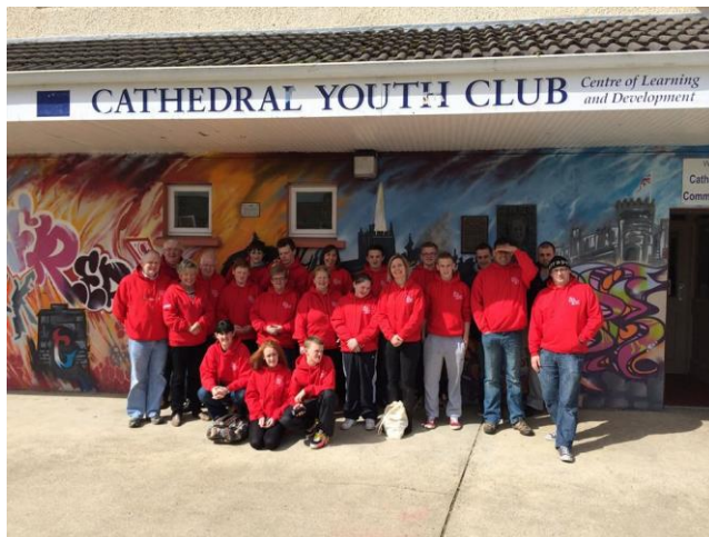
Young people and volunteers at Cathedral Youth Club

The highlights of 2015/16 for the Cathedral Youth Club has been working alongside young people from Pennyburn Youth Club looking at politics of the different parties and the Young Enterprise Programme, the youth club was delighted to win the best overall company 2015-2016. The Cathedral YC took part in the OFMDFM Summer Camp Programme, which brought young people together from all over Northern Ireland and again they were able to take part in a residential and sports programme. Relationships were developed and a better understanding and respect for cultural differences.