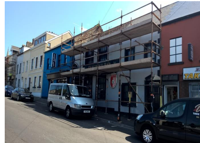
Restore Project on site