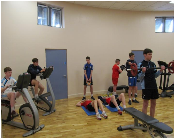
Young people participating in Health & Wellbeing Programme

Creggan Neighbourhood Partnership, Dove House Community Trust and Cathedral Youth Club have an SLA with the EA to deliver this project in the Triax area. These three projects play a very active and positive role in the Triax Youth Sub-group. The sub-group ensures co-ordination and collaboration across the area and has provided for our young people to be engaged in a range of personal and social development programmes all year round. These three projects play a key role in diversionary programmes over the summer at times of high tension and work closely with young people around bonfires and anti community activity.