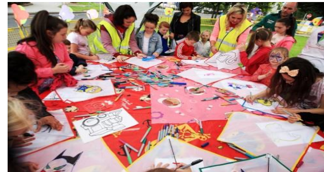
Arts and crafts session at Gasyard