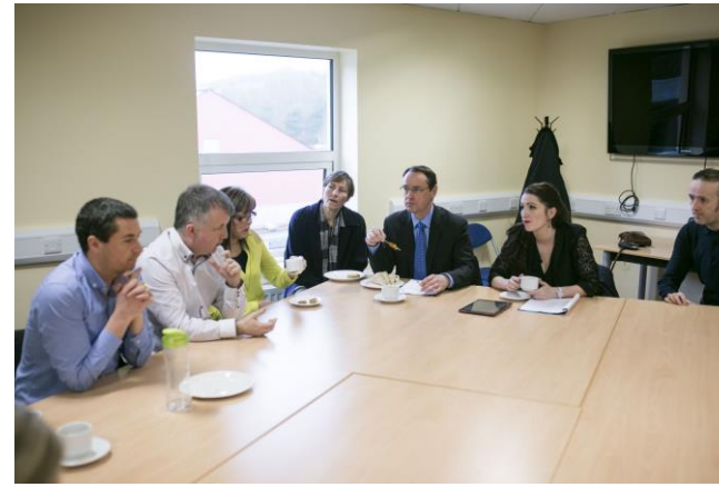
Strategy Manager engaging with OFMDFM