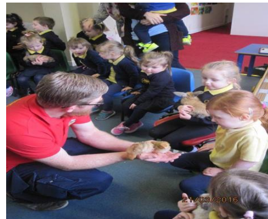
Children enjoying the Kidz Farm