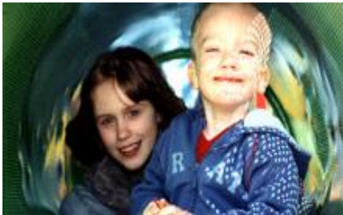
Children on Day Trip

The One Plus Centre offers free membership to all lone parents in the area and a range of member services such as newsletters, regular mailings and the opportunity to get involved in consultation about matters important to one parent families.