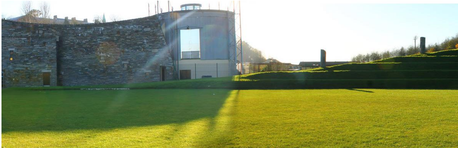
The Gasyard Centre and Parkland

The Gasyard Centre was built and opened in 2001 and has become one of the key community facilities in this area delivering a wide range of community services and programmes. The Centre also plays host to a number of community and voluntary services. The building is in constant use seven days and nights a week with health programmes, Arts and Culture programmes and events and it is also used for the community to meet and discuss issues that impacts on their lives. With this amount of usage and traffic through the building it is important that community facilities are kept to high standard. This funding was provided to lay a new floor and complemented the extension that was built in 2014/15.