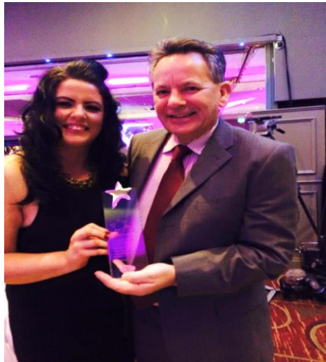
DEED Project Winners of the All Ireland Health Award

The OLT continues to grow and expand the range of services and programmes on offer not only in their base in Creggan but across the Triax area and further afield. They deliver a full range of programmes, interventions and services for all abilities and ages including the Family First Hub, Sweet Programme, 14, DEED Derry Engaging and Empowering Dementia, Step Up GP Referral, Exercise For All and through to Health for Life for Older People. Over 1,000 people use the services of the OLT on a weekly basis.