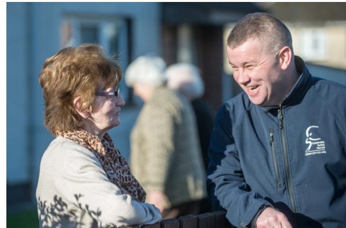
Neighbourhood Wardens engaging with residents