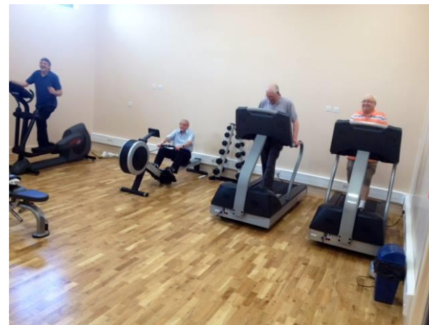
Men's Health Programme