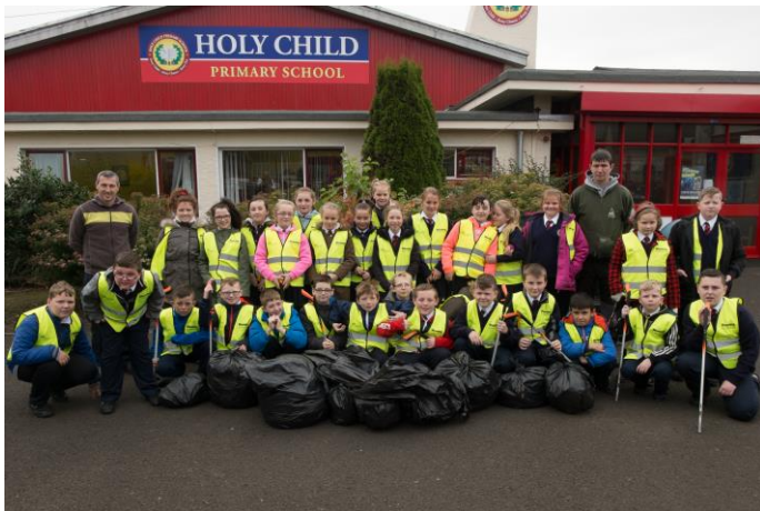
Environmental Clean Up with Pupils from Holy Child Primary School

During 2015/16 the NIHE Social Education Project's activities within Triax focused principally on the Tús Maith Educational Project facilitated in partnership with the Triax Neighbourhood Management Team. Over 1,600 pupils, from all seven local primary schools, took part in the project throughout the autumn school term. Tús Maith events included classroom talks, poster competitions, environmental activities, shared history tours and a photography project that culminated in the 'We Are Triax' exhibition in the Gasyard Centre in March 2016. The project aims to raise the children's awareness of their local community and the positive role they can play within it. The Social Education Officer also supports the YES Project.