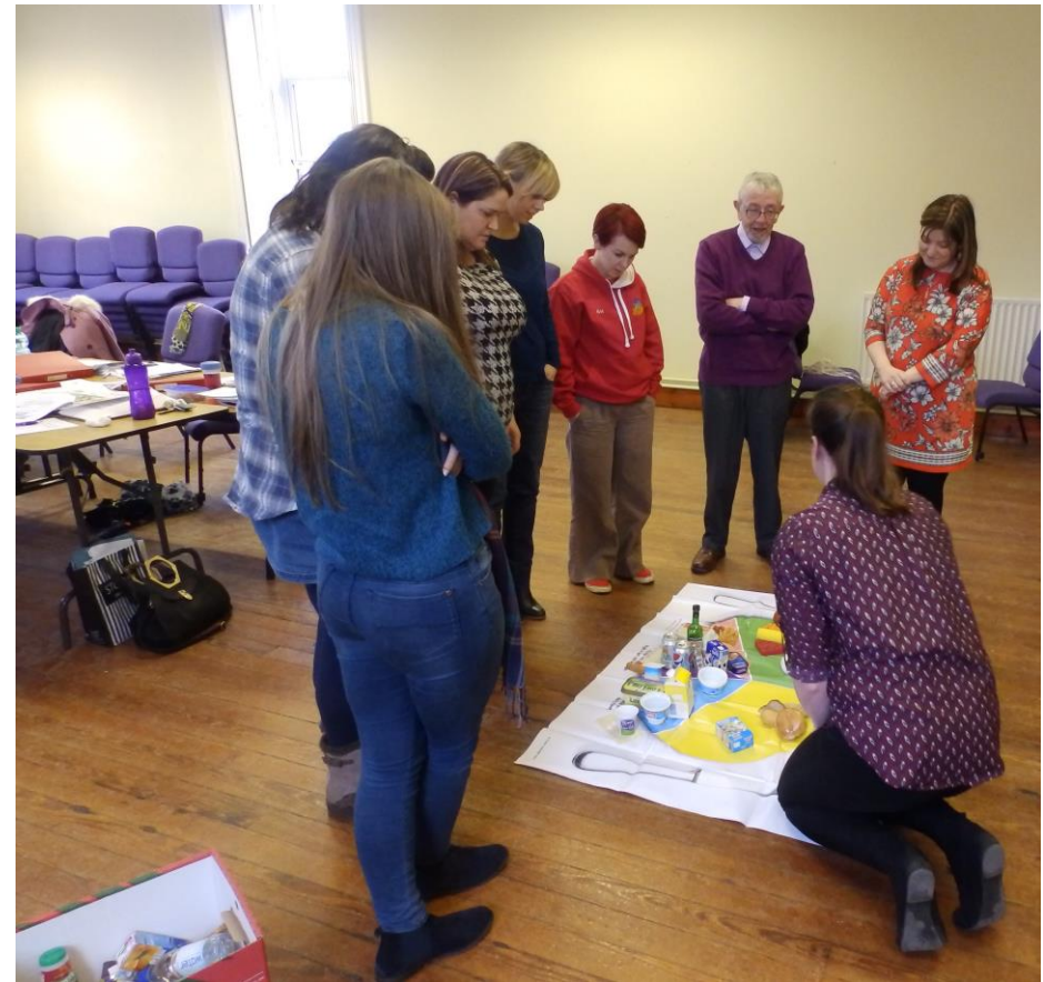
Health trainers training session