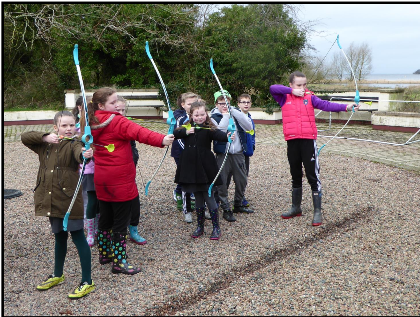
Children from Craigavon taking part in activities as part of the Building Sustainable Communities Programme held during the 2015 summer months.