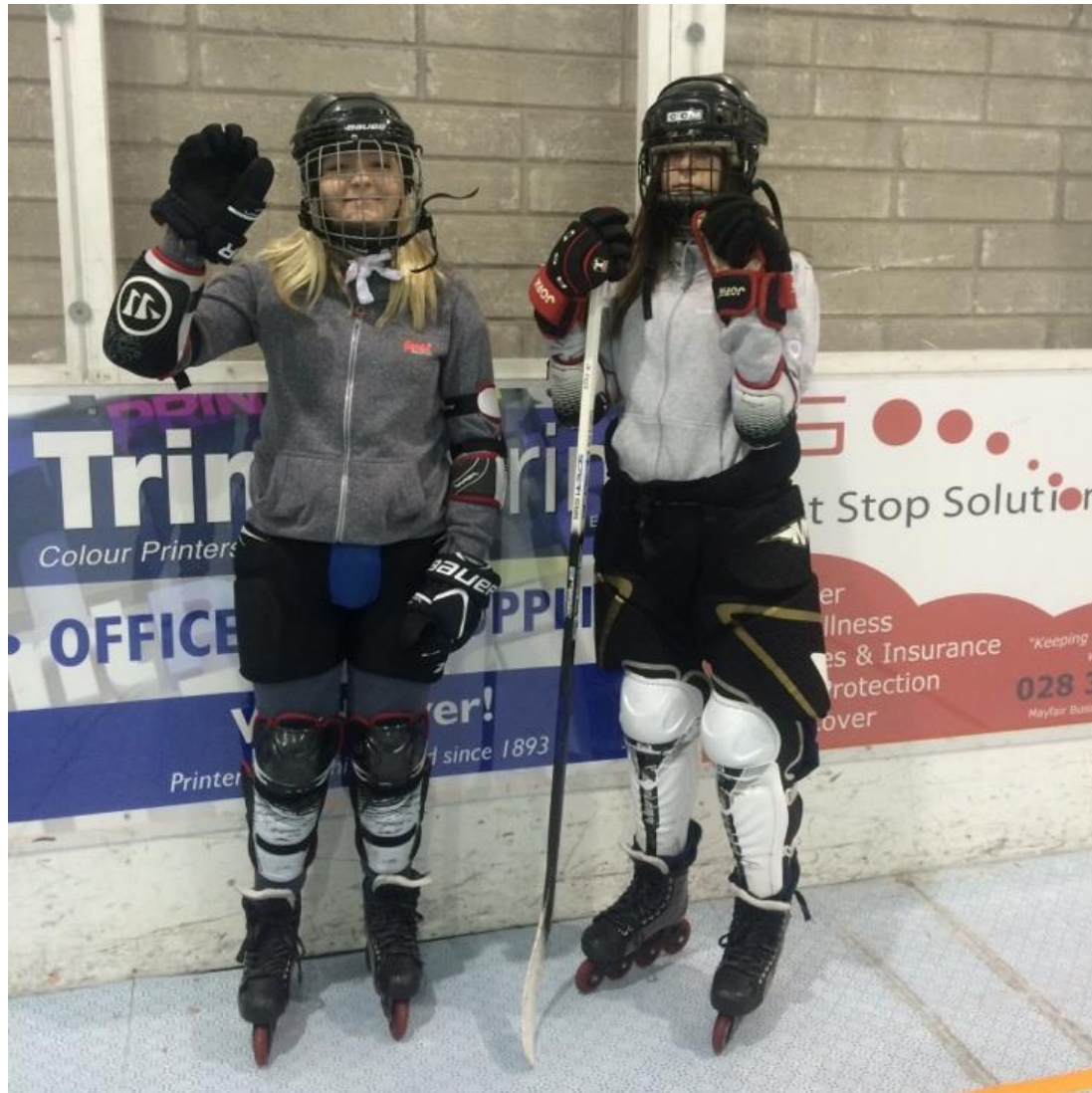
Community Youth Diversion Project, DV8 – Ice Hockey in Dundonald Ice Bowl