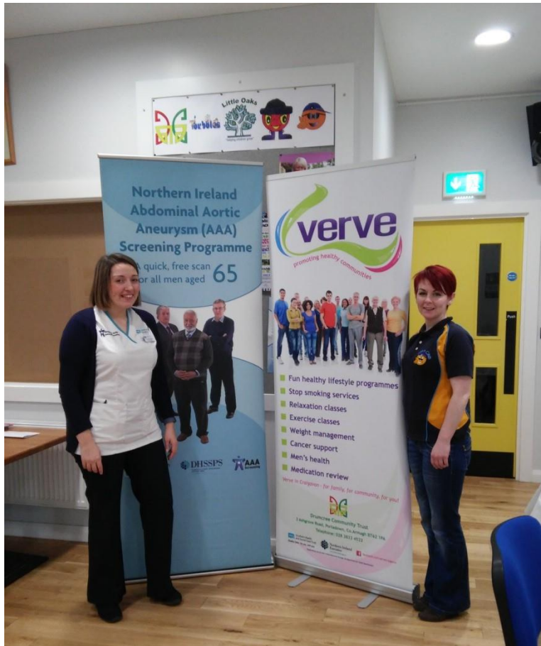
Aortic aneurysm screening at with Health Trainer pop up clinic