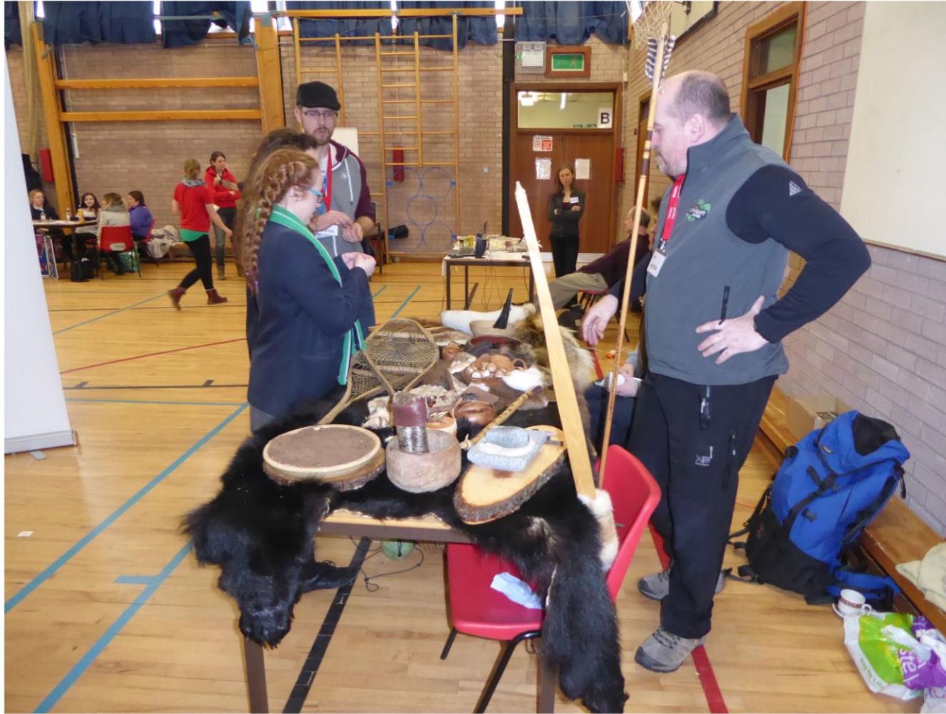
Bush Craft event and exhibition held at Lismore School Craigavon.