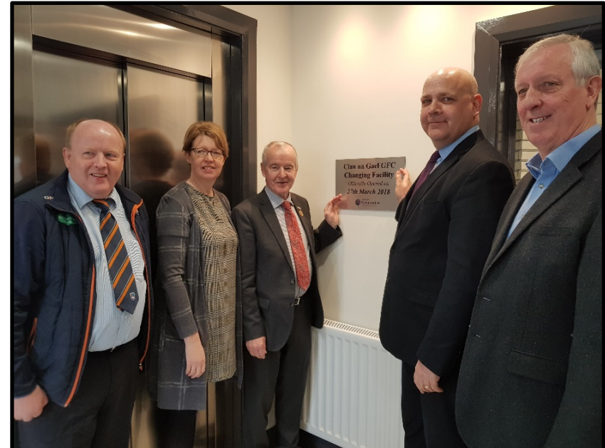
Representatives from Clan na Gael GFC, Armagh GAA, Ulster GAA & DfC at the official opening of Clan na Gael's new changing facilities