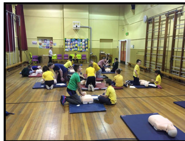
Children from Lurgan Model Primary School Taking in a First Aid Course as part of the Building Sustainable Communities programme