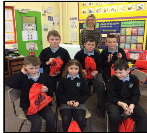
A video project was carried out as part of the Transitions programme, where pupils in the Learning Support Centre in Carrick Primary School created an information video for parents and potential future pupils. This video is now used by other schools with pupils transitioning to a Learning Support Centre. The video is available through the Moving Forward website.