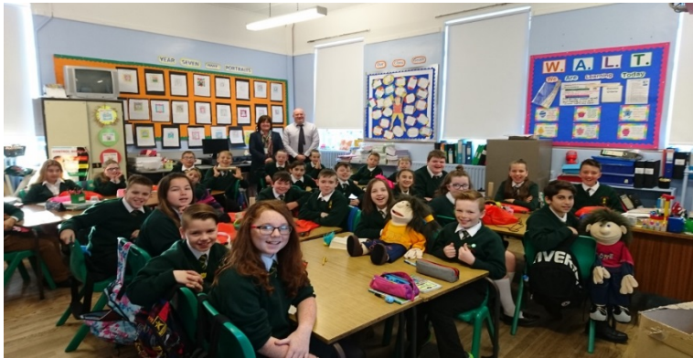
Primary 7 Pupils in Lurgan Model Primary school who participated in a Moving forward programme based on attendance and transitions into post primary education.