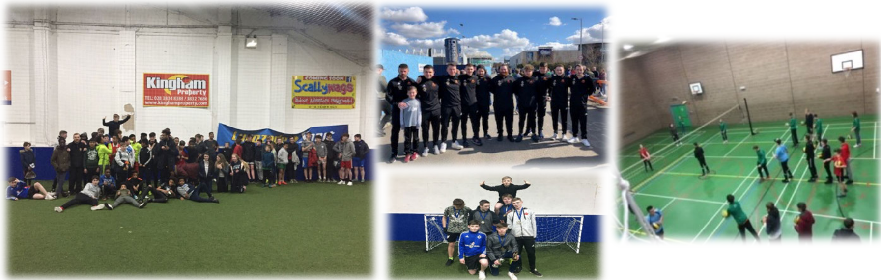
Numerous participants at the Midnight Soccer, DV8 and Kickback projects, all part of the Sport in the Community Programme