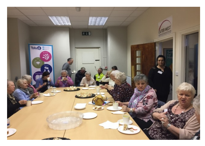
Express Yourself Seniors programme to combat loneliness and isolation