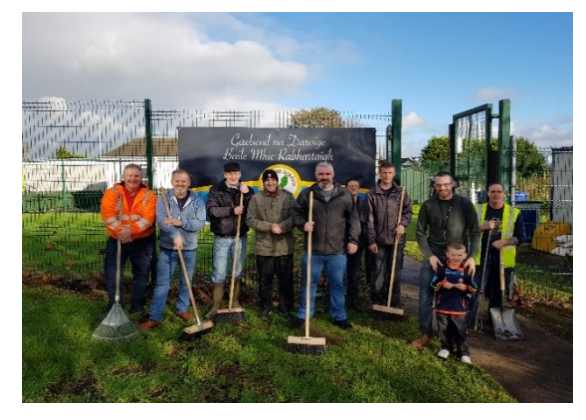
Teamworks and CRJ carry out clean-up at Gailscoil na Daróige

The mediation service assists with crime prevention and via partnership working victims of crime have been supported and home security increased. CRJ also seeks resolutions to youth related issues by employing intervention, preventative and diversionary methods and by signposting some of the young people to outreach workers and other youth providers. CRJ supports victims of crime and helping them to make their homes more secure through the Lock Out Scheme. CRJ provides a service for people with drug addictions and signpost them to the relevant organisations.