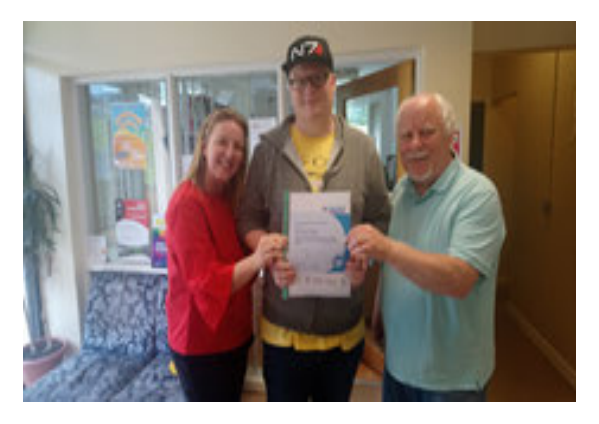
GDI Foyle Community Works Graduate