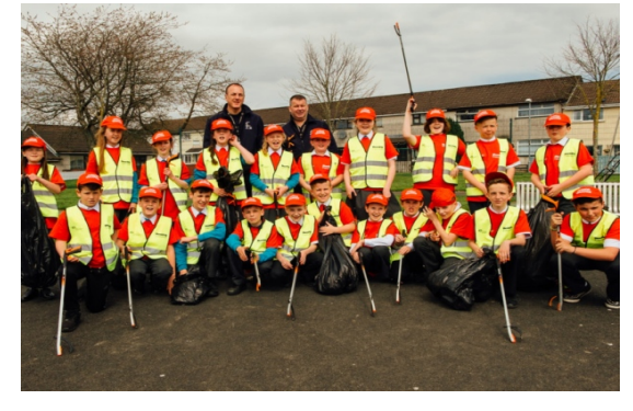
Community Clean-Up with the Junior Wardens