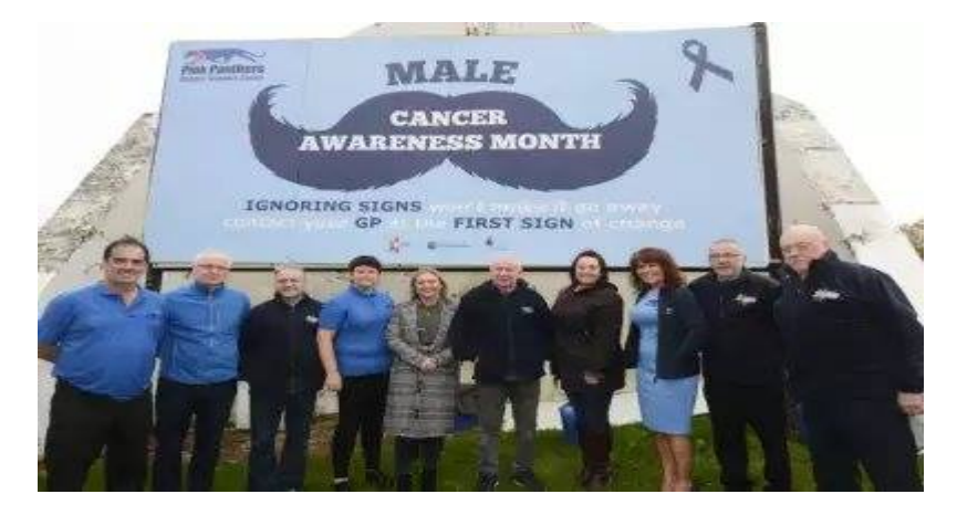
Pink Ladies and Pink Panthers launching Male Awareness Month

The Pink Ladies is a relatively new project that has already established itself within the NRA becoming the go-to service for cancer support and prevention services. The project is represented on the Health Working Group and has contributed to the action planning process.