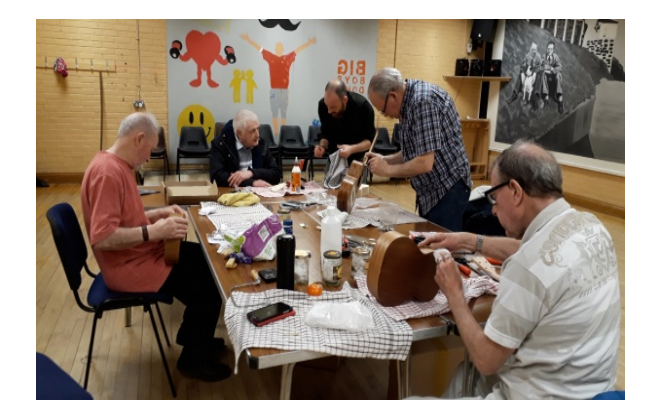
GDI Men's Shed Ukulele workshop

DfC Neighbourhood Renewal Unit currently fund a Manager and two Development Workers plus associated running costs.