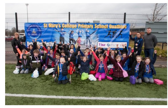
Outer West Neighbourhood Renewal Partnership "Just Du It" Festival funded by The Executive Office Central Good Relations involving city-wide schools.

The role of the Strategy Manager, funded by DfC through the NR Investment Fund, is to work closely with the OWNRP and DfC to strive to develop and achieve a confident community that is able and committed to improving the quality of life in the Outer West. The Strategy Manager assists in delivering new projects and increasing services and programmes which benefit all residents in this NR area therefore reducing the gap in deprivation measures between Outer West and non NR areas. The Strategy Manager engages with all relevant statutory bodies and non-Government funding bodies to lever in additional funding to deliver on priorities identified within the NR Action Plan.