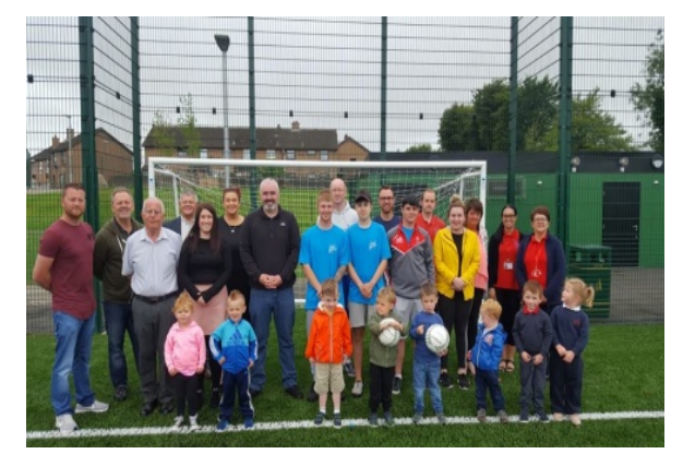
BHCP Family Fun and Cultural Day at the Outer West Cultural Hub