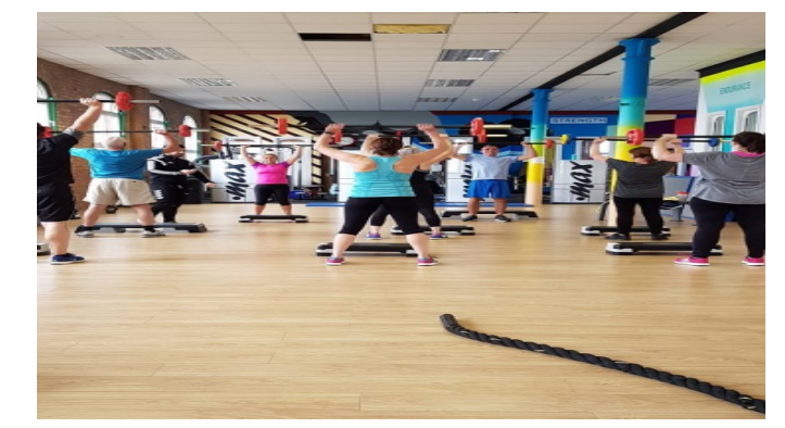
The Fitness Factory classes