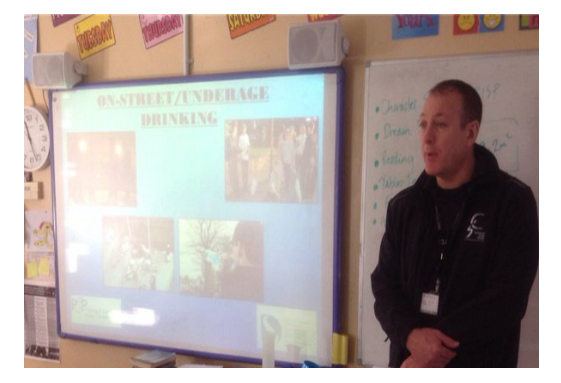
Youth Workshop – On Street /Underage Drinking

The project also focuses on reducing the fear of crime and will implement crime prevention initiatives in order to reduce incidents of anti-social behaviour within each of the four NRAs.