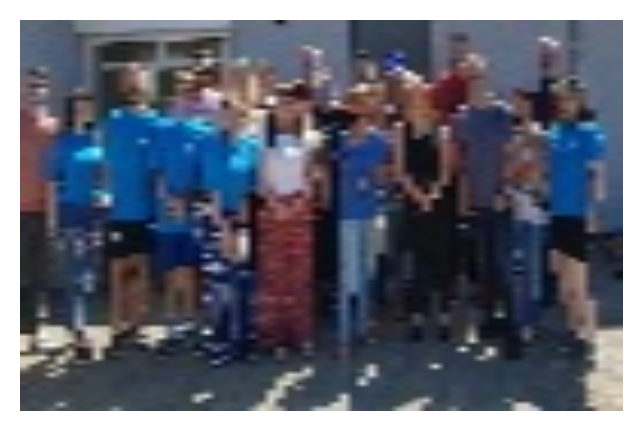
CRJ Outer West pictured with BHCP staff at the launch of the BHCP Summer Scheme