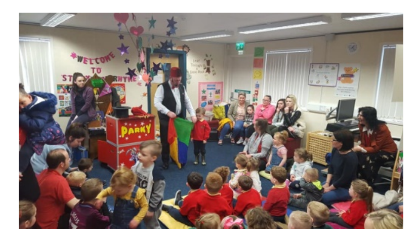
Community Library Activities at Little Hands SureStart in Outer West

The employment of a full-time Library Administrator will continue to allow the Community library to open during the day and at evenings as well as all day Friday and Saturday. This will allow residents of all ages from within the Outer West Area to avail of the educational services provided through this easily accessible and well-located building.