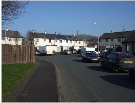
Magirr Park (completion of previous Magirr Park scheme)