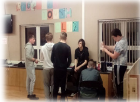
Drop in at Lisnafin