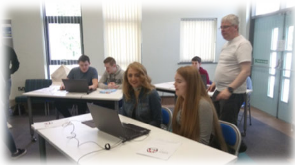
OCN Qualification in Design & Printing

The programme provides leadership training and peer mentoring which includes pathways to qualifications/accreditation leaving a lasting legacy of new community leaders across the Strabane Neighbourhood Renewal area. The key drivers of the programme are the Neighbourhood Renewal Youth Forum made up of 18 young people aged 16-25 years. Two Drop in Centres have been established within Community Centres in Ballycolman and Lisnafin estates to engage young people on a weekly basis in various activities i.e. Arts and Crafts, Sports and Recreation, Group work, Social Skills, residential weekends. Alongside these activities young people can avail of accredited and non-accredited courses i.e. OCN Leadership, Youth Support Worker qualifications, Child Protection, Health & Safety, Health & Well-being, Good Relations with support from an area youth worker. During the summer months young people engage in the Summer Youth Intervention Programme during periods of social unrest/heightened tensions to reduce incidents of anti-social behaviour. Young people are involved in a number of programmes that address community relations, health issues, promote active citizenship and volunteering to build community capacity and cohesion within local neighbourhoods.