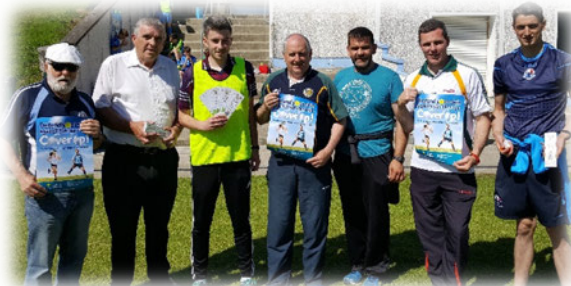
Cancer Care in the Sun