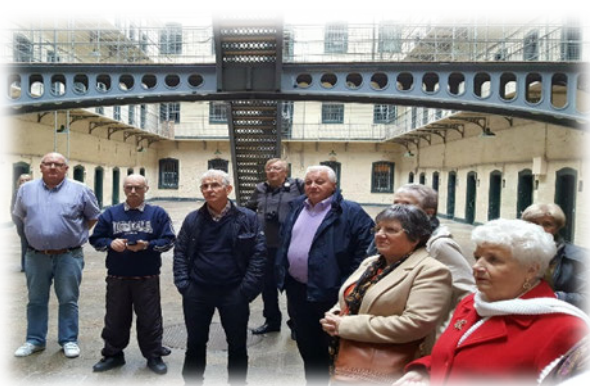
Cross Community Good Relations trip to Kilmainham Gaol