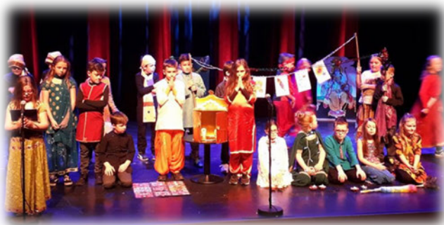
Diwali at the Alley Theatre