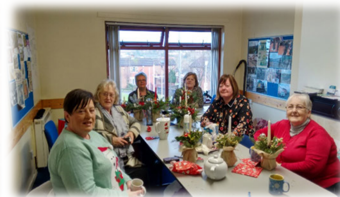
Melmount Forum's Women's Group