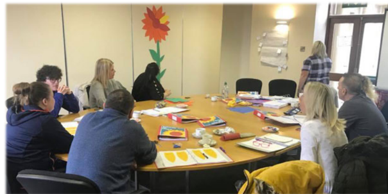
Schools for Hope Workshop, March 2018

During 2017/18 the Education Steering Group focused its efforts on researching and reviewing resilience programmes to help deal with the growing problem of child mental health distress. The partner organisations have agreed to design and deliver a bespoke resilience programme to the parents of children attending local nursery schools. The programme will be based on the 'Schools for Hope' (SfH) model and will also incorporate the best elements of other programmes run by Surestart and schools. SfH is a mental health and well-being awareness programme based on research that suggests hope is a teachable skill. It aims to equip children and young people, their educators and parents with the tools they need to find and maintain hope even during the most trying of times.