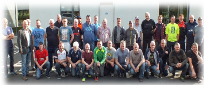
Banter around the Bridges