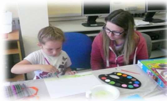
Stay & Learn Class for Children and Parents