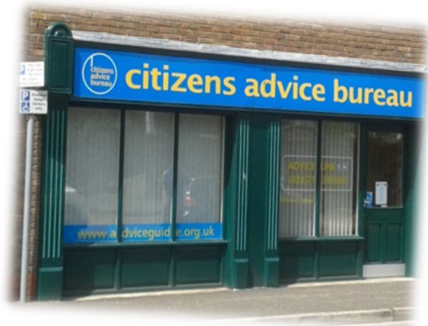
CAB Office, Strabane