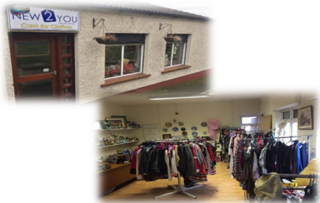
New to U Charity Shop