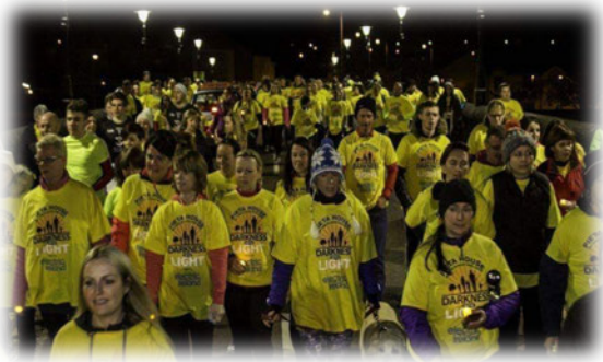
Darkness into Light Walk, 2018