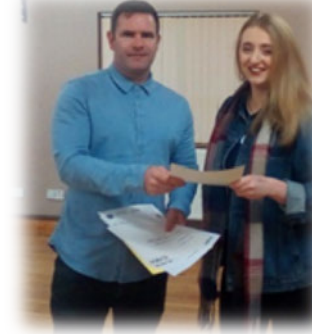
OCN Level 1 Digital Fabrication