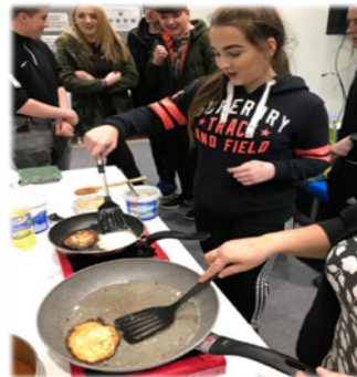
Multi-cultural Food Night