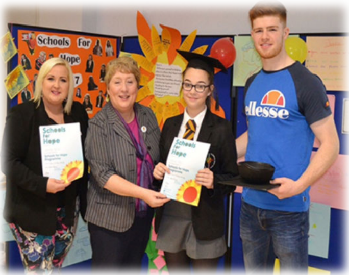
Schools for Hope Programme

Holy Cross College, in partnership with Strabane Academy delivers this programme that targets pupils who are disengaged from the current education system providing academic and pastoral support. A Learning Mentor works with pupils on an individual basis and assists them to remain engaged with mainstream education. Pupils are offered a tailored education support and personal development plan to meet individual needs. The Learning Mentor supports each young person in academic and vocational courses that are not available at local schools. Some of the initiatives delivered includes Literacy & Reading Support, one-to-one mentoring, learning together programme, amazing brains workshop, after schools student support, parent support, peer pressure/bullying initiative, bereavement & loss support group, summer scheme etc. The programme aims to help students improve their opportunities for further/higher education, training or employment.