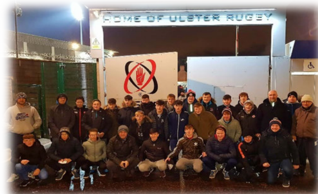
Good Relations Trip to Ulster Rugby