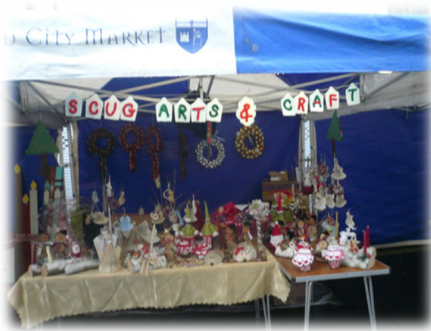
Strabane Christmas Fayre 2017