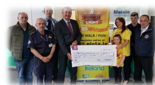
Darkness into Light Walk