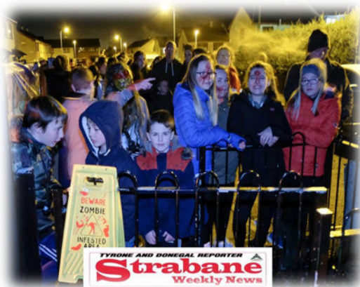
Halloween Burn Walk