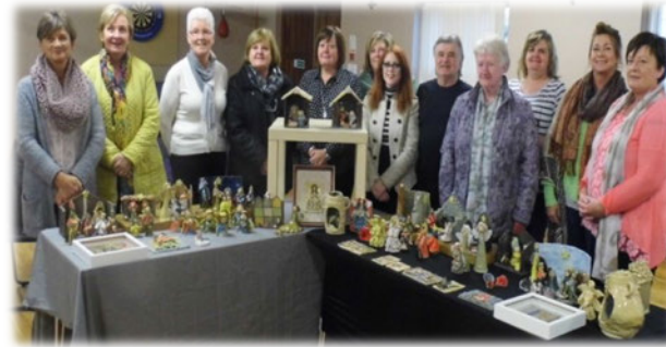
Over 50’s Art & Craft Classes