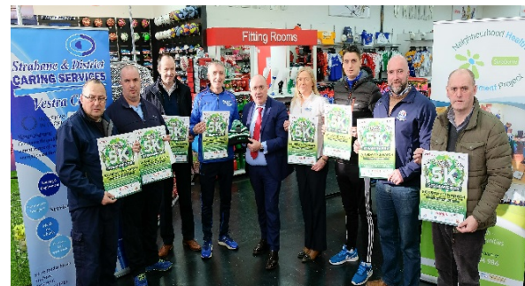
Launch of 2018 St Patrick's Day 5 K Run