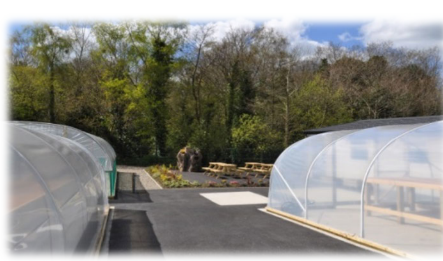
Koram Centre's allotment site at Tulacorr, Strabane