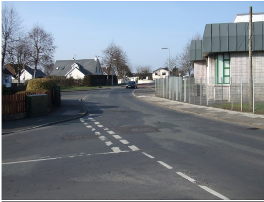
Lisnafin Park, Distributor Road