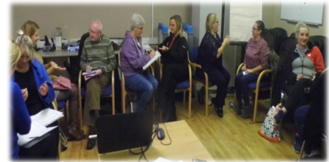
Sign Language Course