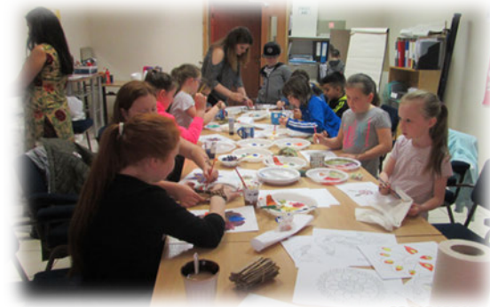
Henna Art Temporary Tattoos