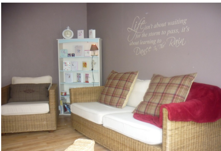
Counselling Rooms at the Koram Centre

The Koram Centre works closely with the Western Health & Social Care Trust (WHSCT) – Public Health Agency and receives self-referrals, referrals through the local health centre and social services.