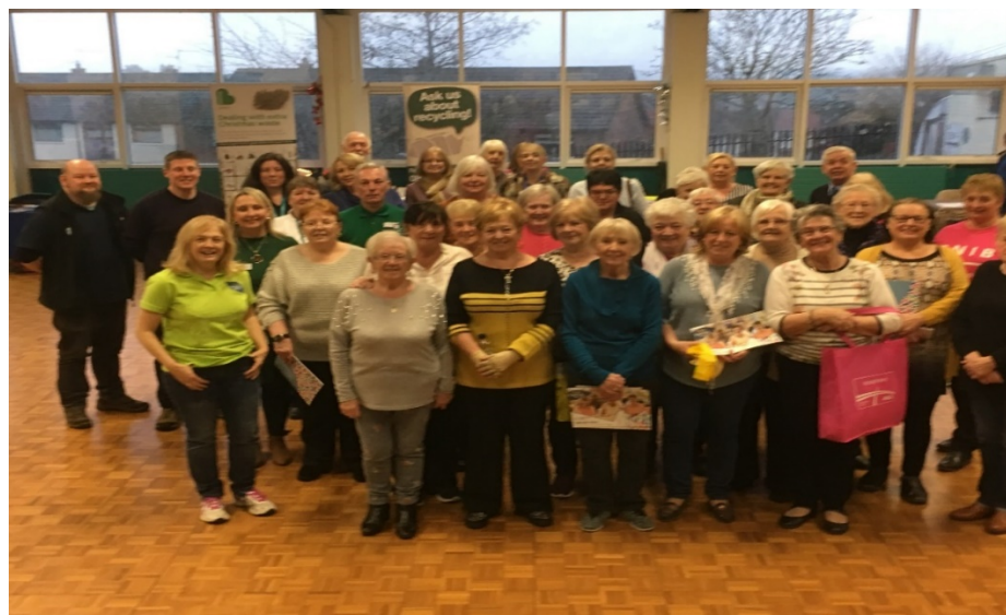
Participants at Lenadoon Forum's Safer Winter Community Information Day in Nov 2018.