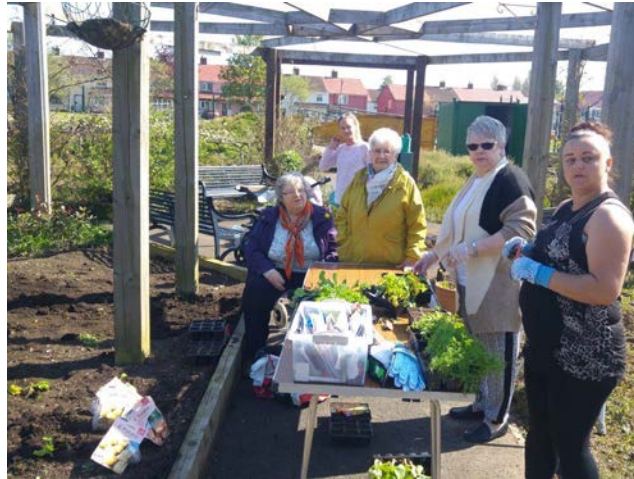
Gardening is good for you!