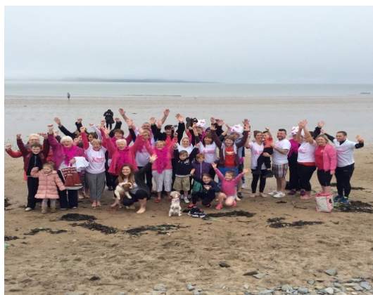
Pink Ladies Easter Splash

In the past year, as a result of a successful application to National Lottery Community Fund, the Pink Ladies have grown and expanded to include increased staff capacity, volunteers, new services and have been able reach out to other identified communities. They continue to deliver a unique model of vital cancer and holistic support services at a community level and this year can report 3,395 individual people have benefited from their programmes. Pink Ladies also have added to their existing programmes - a new Education and Prevention project, an enhanced advice service in partnership with DHCT and a much needed befriending/listening ear service operating throughout the Triax ~ Cityside area at present. The support programme - HUGS (Help Us Get Stronger) has developed further with an increase in numbers using the services.