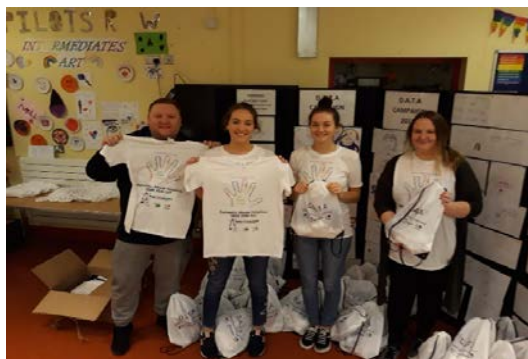
Woman's Advocacy Awareness Programme

Research has shown that domestic abuse amongst young couples is increasing at a frightening rate. In order to combat this the Women's Advocacy Project, based at Dove House, in partnership with the Yes Project and Youth First, launched its "D.A.T.A Campaign" (Domestic Abuse Teen Awareness). They carried out information workshops with local youth clubs and secondary schools in the Triax ~ Cityside area. Participants were then asked to create a logo that they felt best depicted domestic abuse, with the winning logo being printed on t-shirts and distributed amongst the participants. The hundreds of entries were judged by local women who engaged with the Women's Advocacy Project and who had experienced domestic abuse.