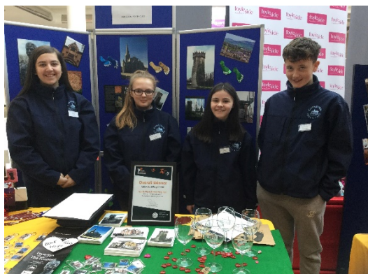
Young Entrepreneur Winners at Foyleside

The Cathedral Youth Club is the key Neighbourhood Renewal Funded Project in the Fountain Estate. Over the past year the Cathedral Youth Club has worked closely with a wide range of community and statutory partners to provide an extensive range of programmes and services. These ensured that young people and families gained skills and qualifications including First Aid, Leadership, Fire Safety, Child Protection and Personal Success. The highlight of the year was young people winning the overall Young Entrepreneur award at the Foyleside Shopping Centre.