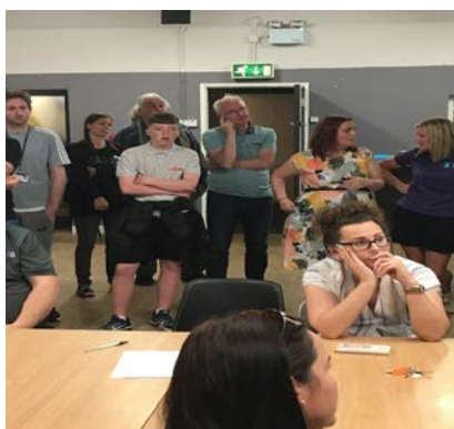
CRJ at Community Meeting

CRJ (Triax) plays a leading role in this community on bonfire management and engaging with residents and statutory partners. CRJ was also central to the development of the Fire Festival as part of the 15 th August Feile Celebrations. CRJ chairs the Triax Community Safety Forum which has led on many community safety campaigns including road safety, anti-sectarianism, hoax bombs, floods, neighbourhood watch and home safety. CRJ also provides community mediation services, support to victims of crime, support to people with addictions, delivers OCN Child Protection and Restorative Justice Training and supports Community Relations Projects.