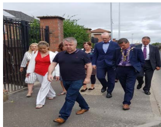
Triax Strategy Manager with Politicians and Residents in Bogside