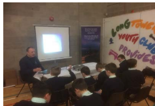
Wardens Engaging with School Pupils