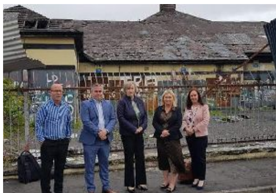
Engagement at Meenan Park

Dove House Community Trust has been central to the ongoing negotiations and resident engagement process around Meenan Park. Iona Entreprises, working closely with Apex Housing and Dove House, hope to redevelop Meenan Square and provide accommodation for community space for Dove House, Social Housing and Community & Social Economy Units. Alongside this Dove House has seen thousands of residents avail of benefits advice and support at information events, at advice clinics and in their homes.