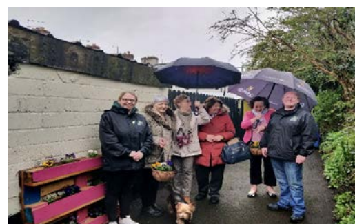
Residents and staff viewing finished work