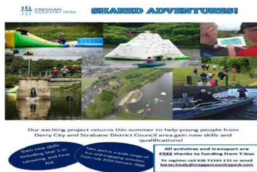
Creggan Country Park Advertising Poster

Creggan Country Park is the key outdoor education facility in this community and over the past year has increased its footfall and engaged with numerous community and youth groups, schools and residents from the wider Triax area and further afield. Creggan Country Park is often an ideal getaway in the middle of a large built up urban area. Creggan Country Park have begun Splash Sessions which has proved to be very popular with young people and families. Alongside these outdoor activities they run numerous environmental and heritage projects.