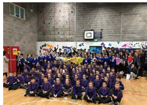
Triax Participants at YES Project