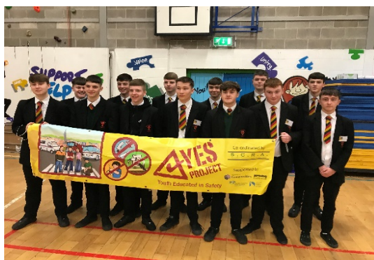
St Joseph's Boys Volunteering at YES Project

Shantallow Community Residents Association co-ordinated the range of agencies and schools to deliver the multi-agency Youth Educated in Safety Project for Primary Schools in or adjacent to the Triax ~ Cityside NRA. The project took place over two days in Long Tower Youth & Community Centre in February 2019. 22 senior students from St Joseph's Boys School volunteered to assist in the project by guiding the groups of younger pupils through the range of interactive workshops. 8 Primary Schools participated with 287 Primary 6 Pupils taking part in 13 interactive workshops.