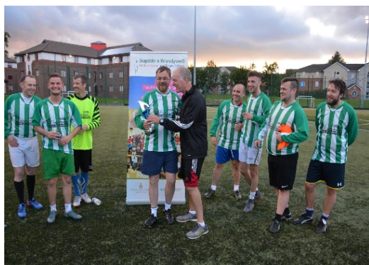
Men's Health Football Competition

Derry City and Strabane District Council is the lead partner in this programme with the Bogside and Brandywell Health Forum, The Old Library Trust, Long Tower Youth Club, St Mary's Youth Club and Cathedral Youth Club delivering this programme throughout the Triax Area. The key targets for this programme is Older People, Health Programmes and Summer Activity Programmes for Children & Young People. In excess of 1,100 people took part in these programmes during 2018/19.