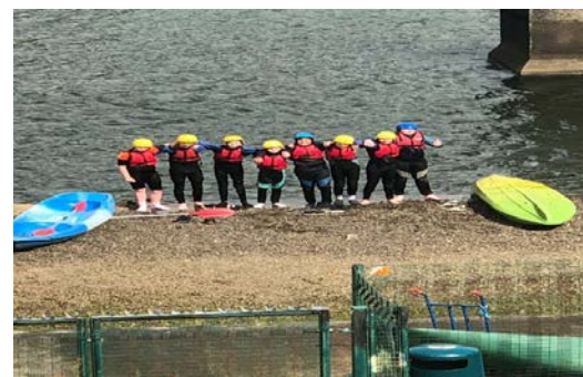
Young People Enjoying Creggan Country Park