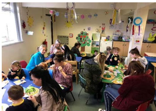
Arts and Craft Session at CPTT

Creggan Pre-School Training Trust (CPTT) deliver a wide range of health, training and education projects to parents, carers and families across the Triax ~ Cityside area. CPPT support these families to deal with numerous diverse issues and needs. The training and support enables these individuals to rebuild their often diminished confidence and skills which enables them to support their children and re-enter the employment market. Organisations like CPPT are the cornerstone of Neighbourhood Renewal as they often are the first step to engaging the most marginalised residents.