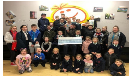
Young People Fundraising for Children in Need