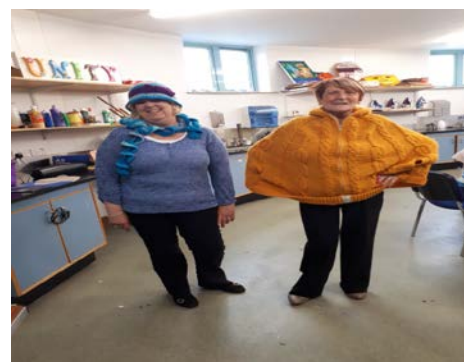
Crafts at the Gasyard