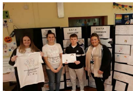
Youth Information Session