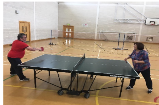
Games Session at OLT