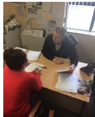
Dove House Staff offering Advice