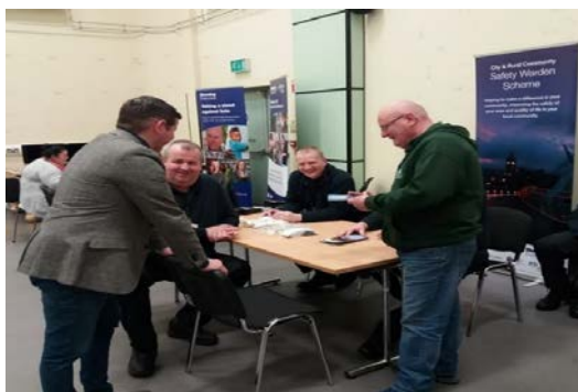
Wardens Engaging with Local Representatives

In the Triax ~ Cityside area between April 2018 and March 2019 the wardens dealt with 218 address referrals, carried out 1,288 patrols in hotspot areas, attended 24 fortnightly Triax Community Safety Forum meetings and assessed homes for additional home security equipment. The Community Safety Wardens are on duty from 12 noon to 5pm - Monday to Wednesday and from 5.30pm to 3.00am - Thursday to Sunday.