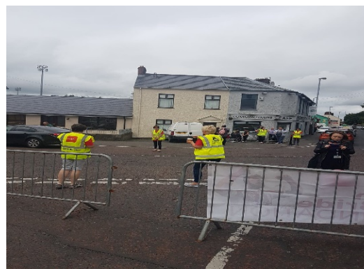
Volunteers at Community Event