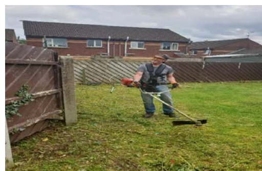
Strimming a Community Space