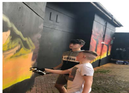
Young People Spraying Mural at Meenan Square