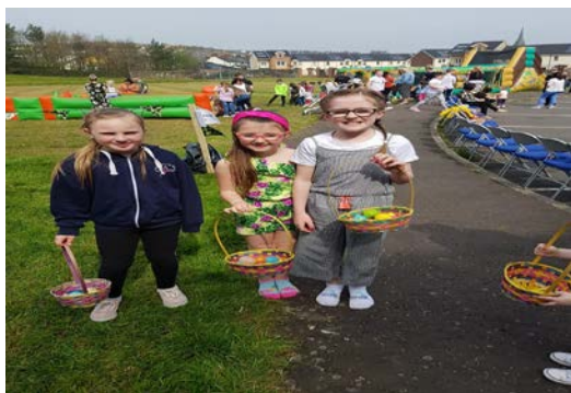
Funday at Gasyard