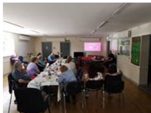
CRJ Home Safety Presentation