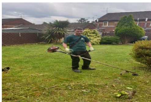
Staff Cutting Grass

Tús Maith provides support and assistance to elderly and vulnerable residents across the area with a range of services including home assistance, painting, grass cutting and power-washing. The support to residents has been complemented by the communal works, graffiti removal and educational campaigns that have characterised their work over the last 5 years. Tús Maith has worked in every part of the community and has engaged with thousands of residents and young people. It is of vital importance to the Neighbourhood Renewal Strategy how the area looks and that residents feel pride in their community.