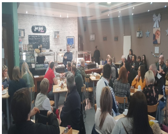
Staff Engagement Event at Mental Health Week

Triax is also heavily involved in the Urban Village Programme for the Fountain/Bogside area and the Communities in Transition Programme in the Creggan and Brandywell areas.