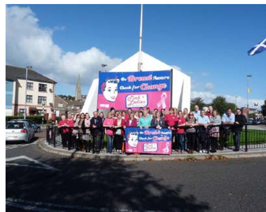
Pink Ladies Campaigning at Free Derry Corner