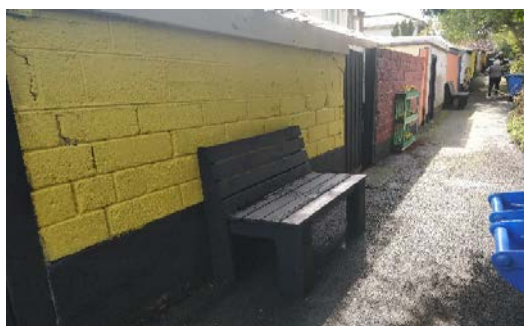
Mews Lane – Demense Gardens

TNMT continues to lead the way in developing many environmental regeneration and social economy initiatives in this area - Tús Maith, the Ballymagowan Allotments, Turning Triax Green, the Bogside Residents Parking Scheme and various interface projects. These initiatives have and will continue to make a difference to the lives of local people. TNMT has been working alongside residents and the Creggan Men's Group to tackle the ongoing problem of Mews Lanes within the Triax area. Mews Lanes are back lanes which are not the responsibility of any statutory agency, therefore neither Derry City & Strabane District Council, Northern Ireland Housing Executive, Roads Service nor any other statutory body will clean or maintain Mews Lanes. TNMT have initiated a partnership process where the lanes are maintained by residents and TNMT with support from the statutory partners.