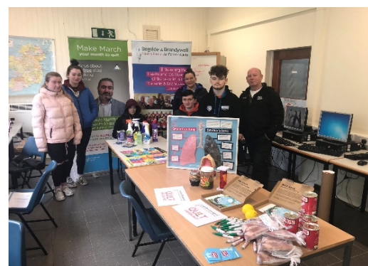
Smoking Cessation Programme