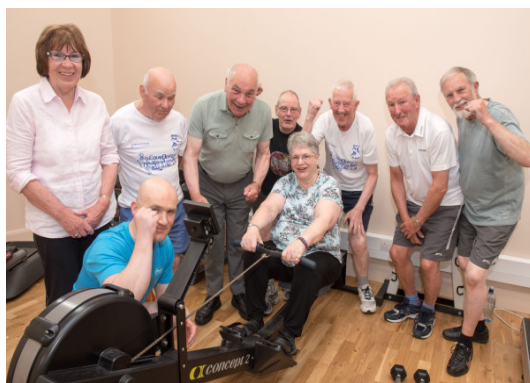
NHIP Active Aging Programme

The Neighbourhood Health Information Project (NHIP) is managed in the Triax ~ Cityside area by the Bogside and Brandywell Health Forum and is supported by numerous groups. The key themes have been men's health, obesity and mental health. The programmes include physical activity, gardening, counselling, stress management, mindfulness, women's support, cancer support and active ageing. Over 1,300 people participated in NHIP events and programmes during 2018/19. The NHIP project is one of the best examples of community partnership and collaborative working.