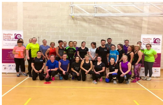
OLT Exercise Programme