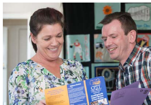
Participants looking over CPTT courses