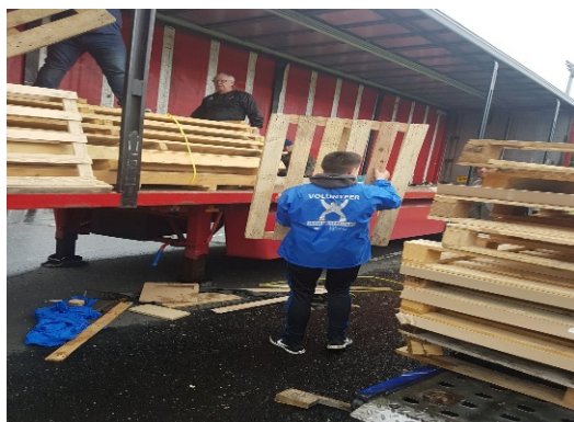
Volunteers at Fire Festival

The Volunteer Investment Project provided volunteering opportunities to 200 volunteers with 7 securing full time employment and 65 volunteers received seasonal work as a direct result of receiving personal training and skills development during 2018/19. 48 volunteers received non-job specific training and 33 volunteers received job specific training - this enabled them to work within their community in roles involving Childcare, Administration, Stewarding, Youth Work, etc. VIP provided trained volunteers for a number of civic events in the city including the Walled City Marathon, Halloween Parade Awakening the Walls, St Patrick's Day Parade, Halloween Haunted House, Spring Festival Carnival, Christmas Market and the Feile Festival.