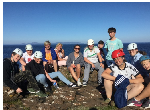
Young People on Adventure Trip