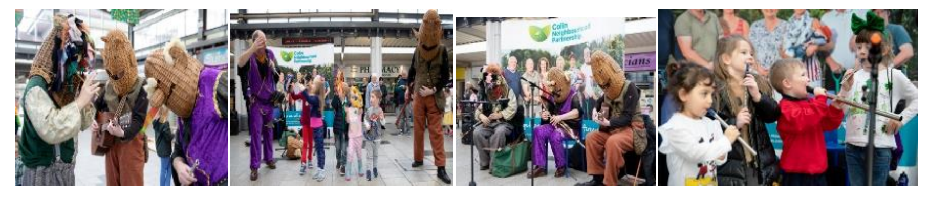
Armagh Rhymers entertaining the crowds and giving lessons to kids on the tin whistle