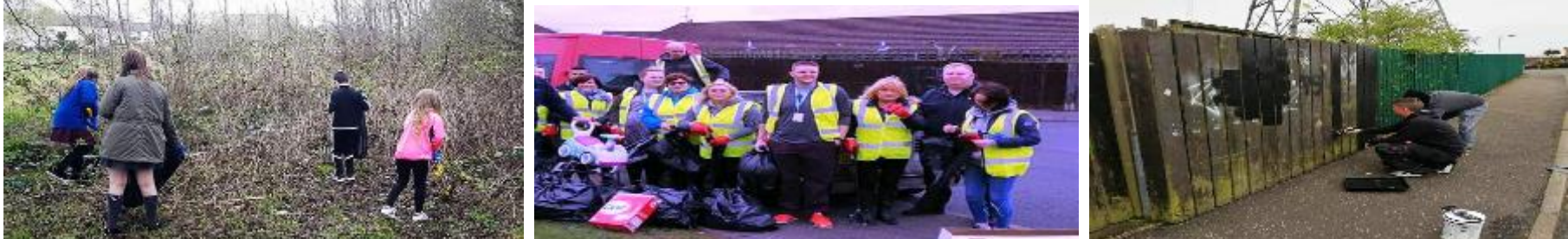
Residents throughout the area helping to improve the look of their own neighbourhoods with the help of Conservation Volunteers, BCC and Housing Associations.

As a recognition of all the good work, Belfast City Council supported a Family Fun Day that included cooking demonstrations, face painting, junk art workshops and many freebies.