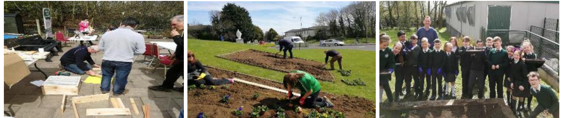
Supporting Locals to build their very own beehives