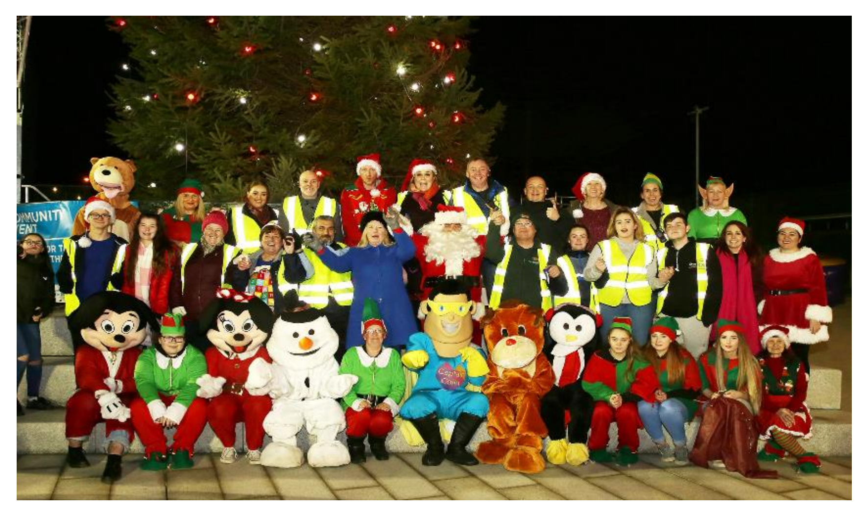
Staff and volunteer team that worked extremely hard on the night.