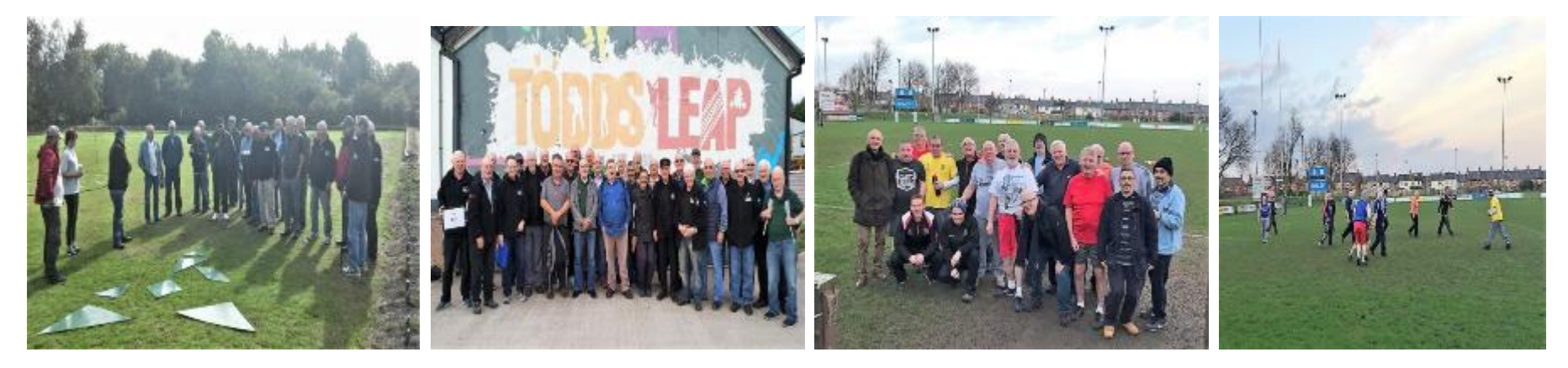
Colin area Men's Shed and East Belfast Men's Shed involved in a number of projects under the Urban Villages Cross Cutting Theme