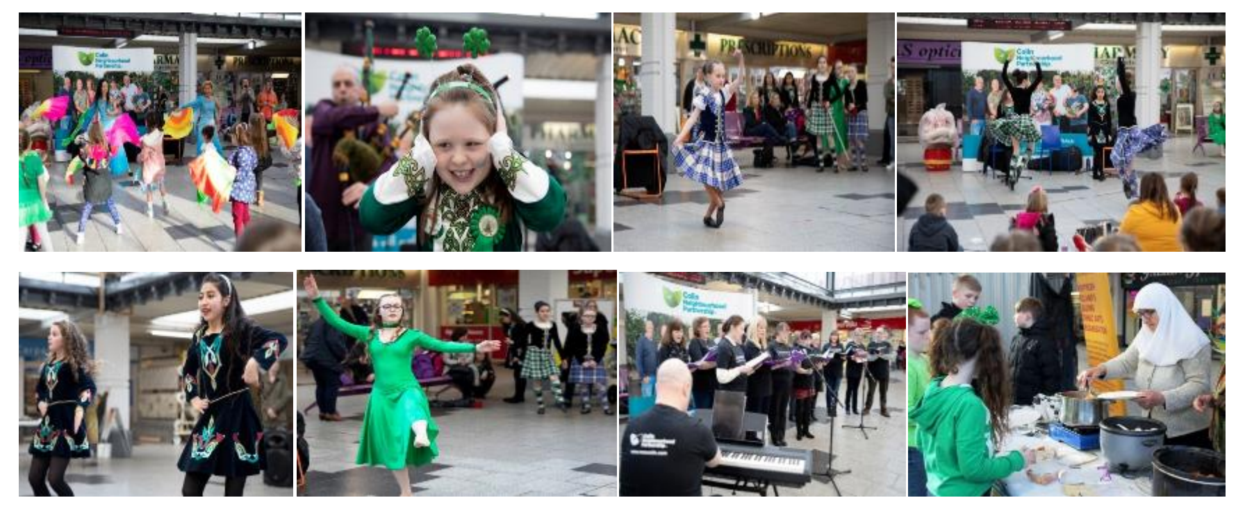
All sorts of sorts of new dancing experiences and food from various parts of the world.