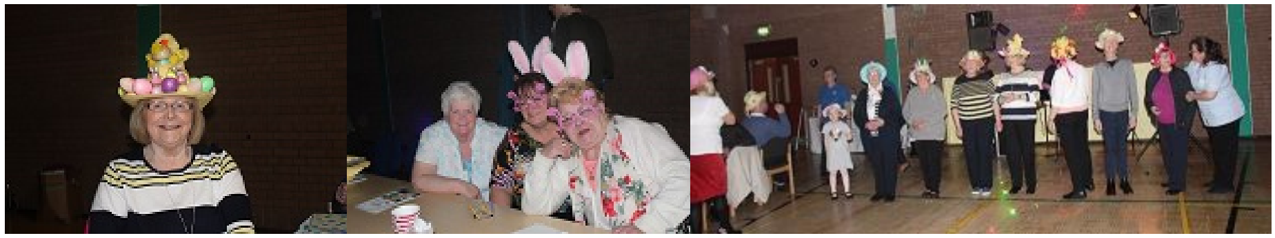
Easter Bonnet Competition