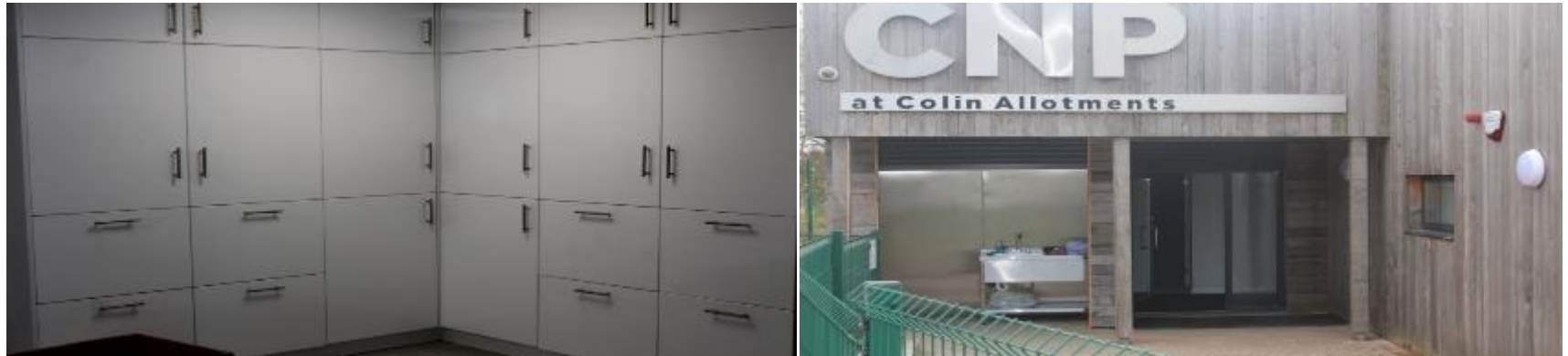
Much needed additional storage space at the centre