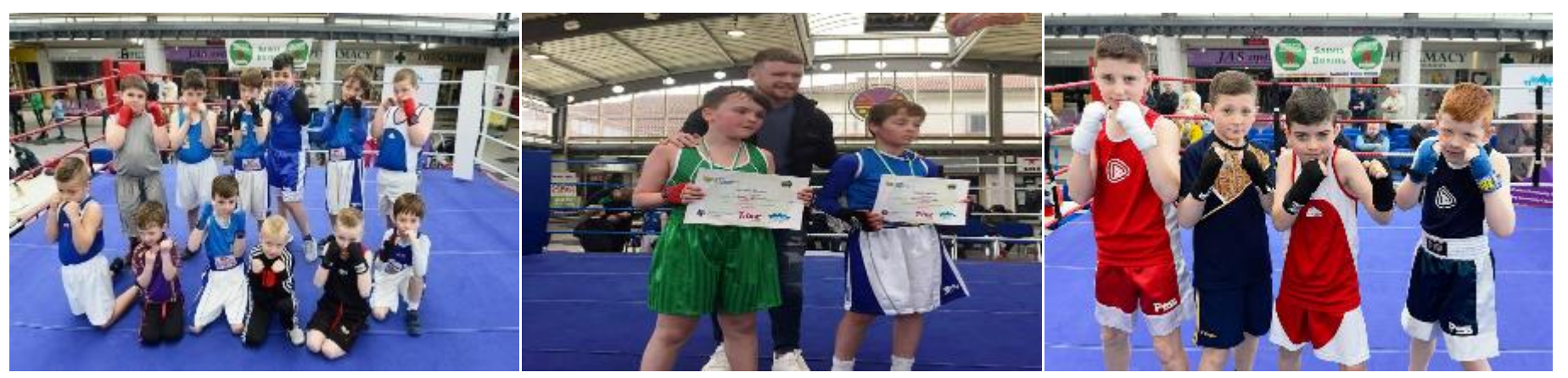
Community Boxing Event