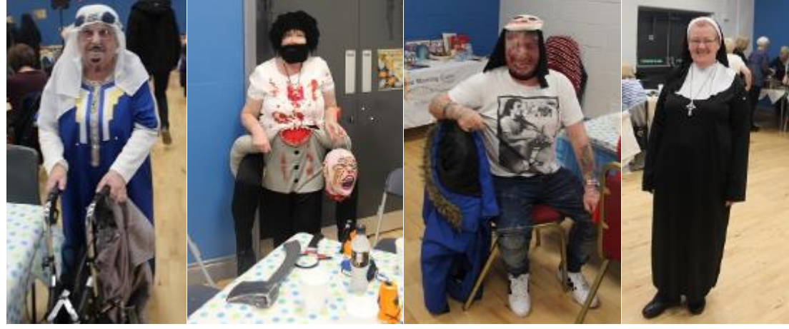
Halloween Fancy Dress Party