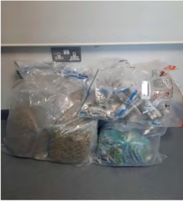
Suspected Class A and Class B controlled drugs

possession of a Class A controlled drug. Enquiries are continuing.