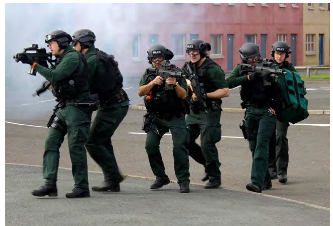
Armed Response Unit (ARU)