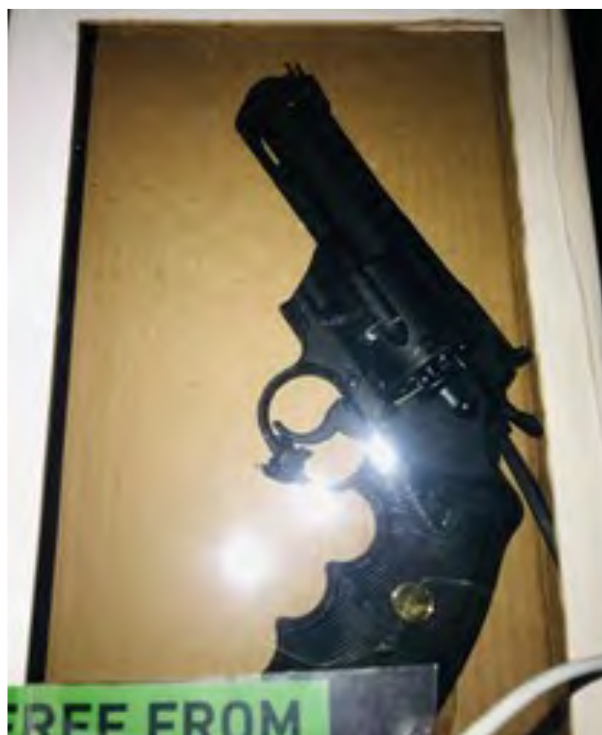
Image of a suspected firearm seized during one of the searches

Two men, aged 36 and 31, were arrested on suspicion of a number of offences, including possessing criminal property. Both have been released on Police bail pending further enquiries.