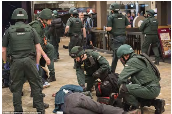
Hazardous Area Response Team (HART)

This decision addresses identified health and safety risks and ensures we have a fit for purpose uniform that aligns with national standards