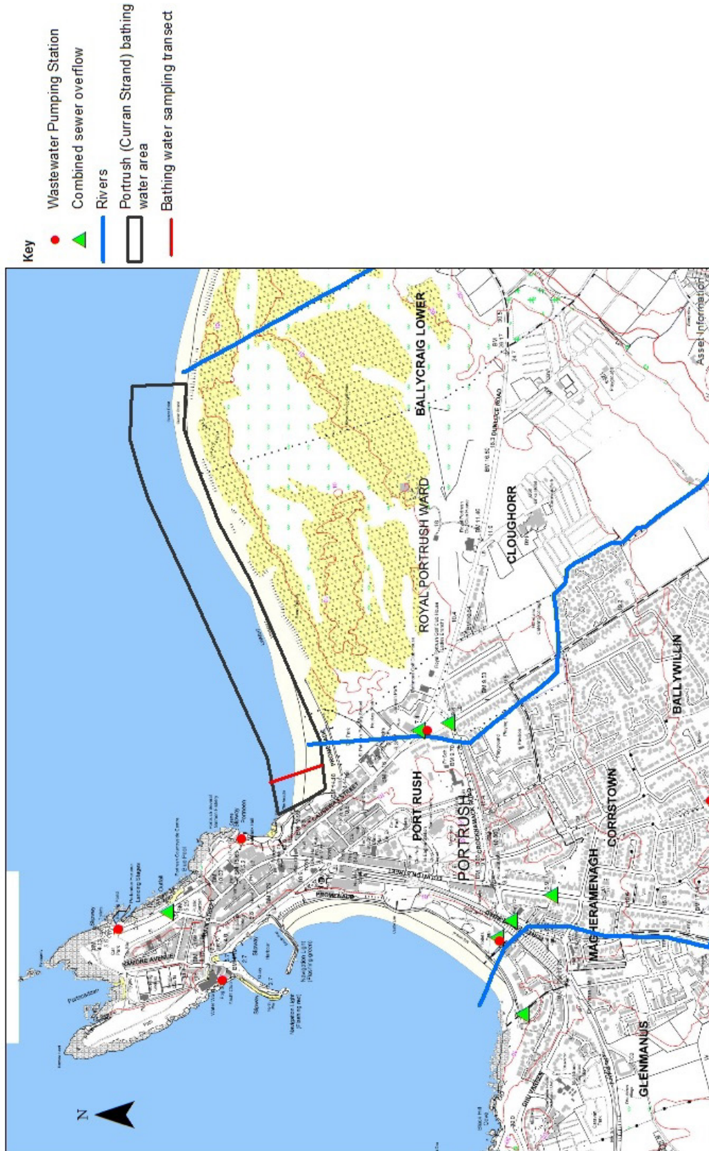
Map 1 Portrush (Curran Strand) Bathing Water - Potential Pollution Sources