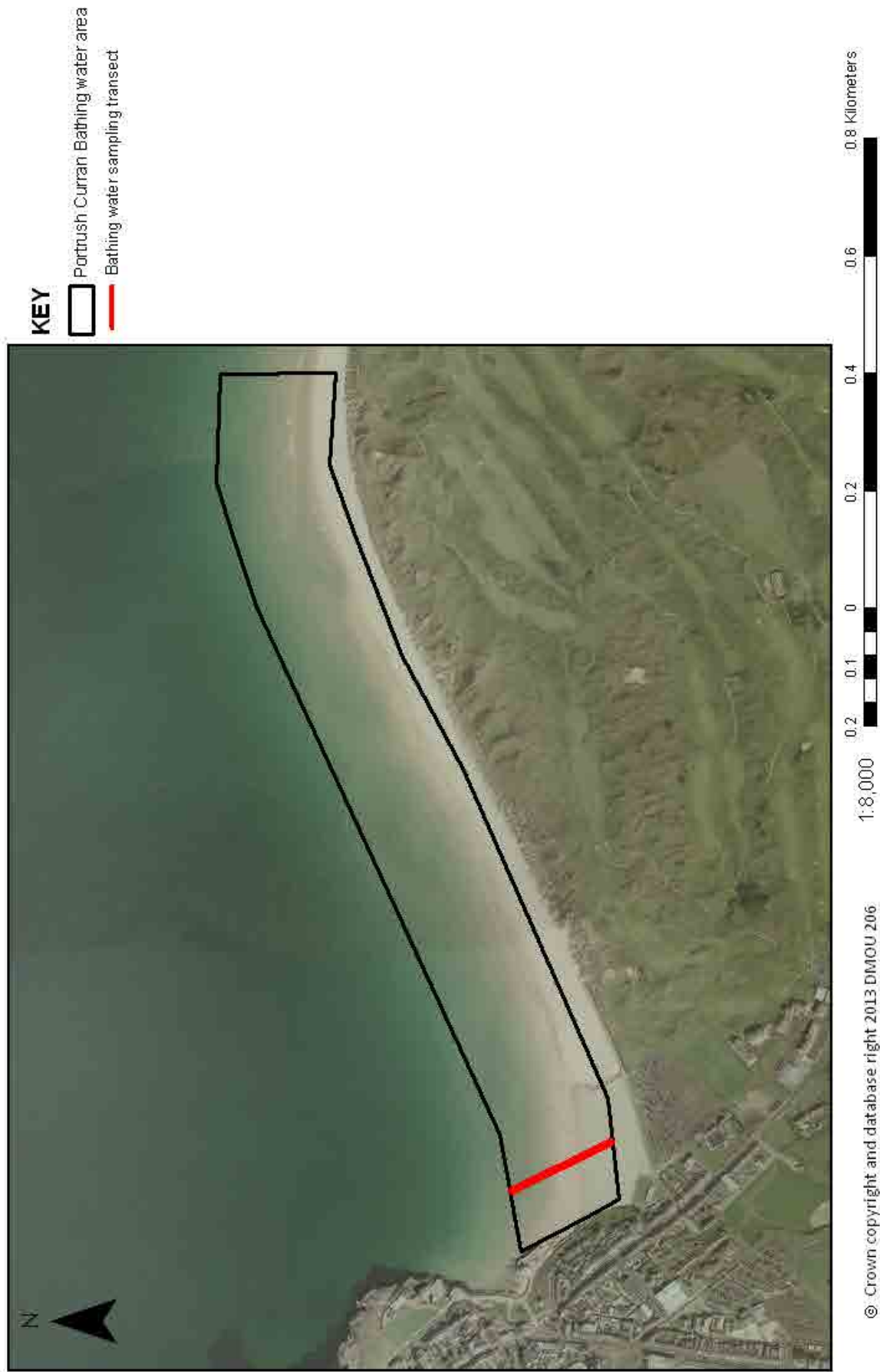
Map 2 Portrush (Curran Strand) Bathing Water - EC Bathing Water Sample Location