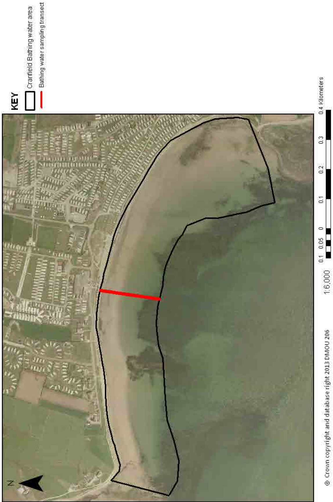
Map 2 Cranfield Bay Bathing Water - EC Bathing Water Sample Location