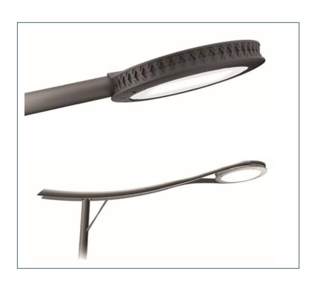
New Street Lighting