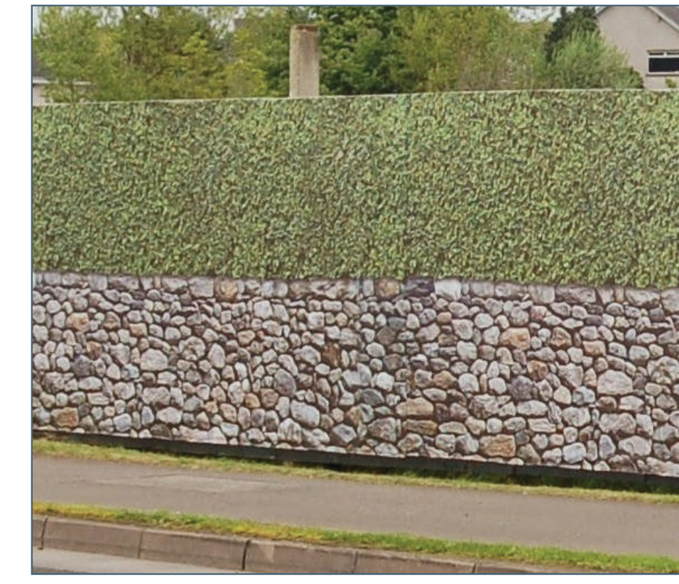
Decorative panel hoarding