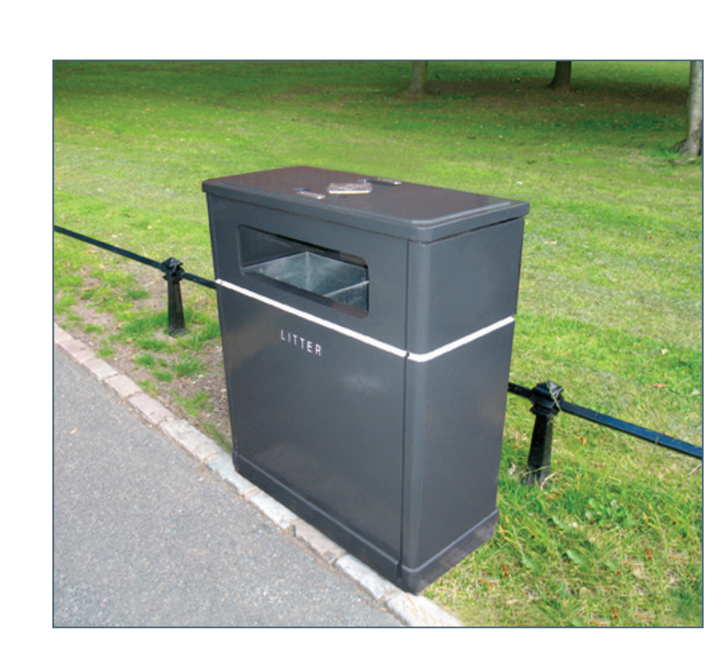
New Street Furniture (Bins & Seating)