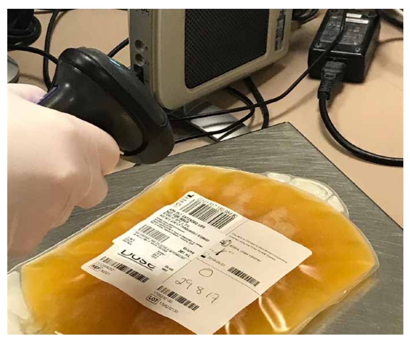
Unit of Plasma being validated

Pension contributions deducted from individual employees are dependent upon the level of remuneration receivable and are deducted using a scale applicable to the level of remuneration received by the employee.