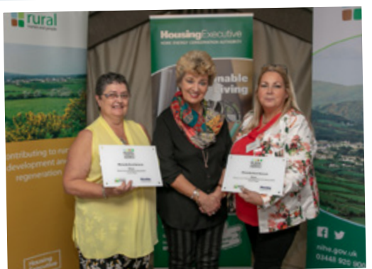
Moneydig Rural Network picked up 2 awards and now have £2,000 to spend on projects that benefit their community.