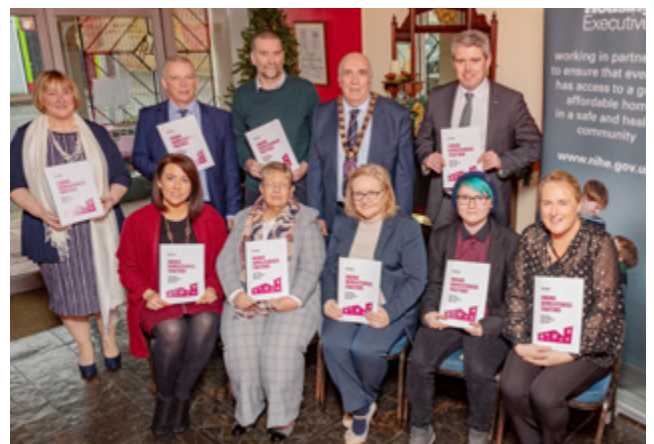
South West speakers promote the new local directory.