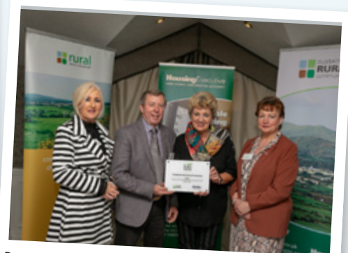
Donaghmore Horticultural Community's blooming beautiful flower displays saw them pick up the Cleaner and Greener award in the large village category.