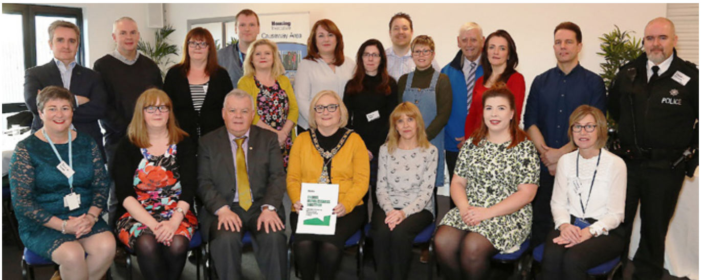
Launching the new directory in the Causeway area.