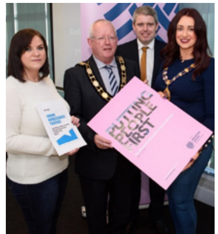
Launching the new directory in Antrim.

In the South West area the Local Mayor opened an event which ended with the launch of a Local Directory of Services. This brings together all of the agencies and support services available in the locality to ensure the public know where to go for help.