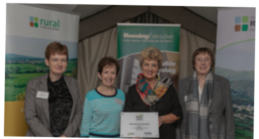
Boho Community Association's efforts to preserve their village for future generations saw them pick up the Sustainable Village of the Year award in the small village category.