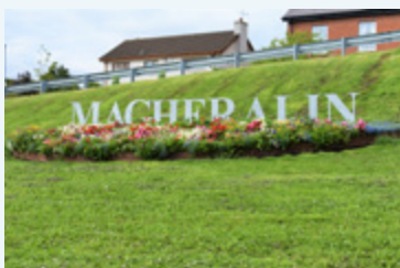
Clockwise from bottom left:- Floral entrance to Magheralin on Flinty Hill; Floral entrance to Donaghmore celebrating the old railway line; Boho community Hall and children's playpark; Moneyreagh Community Centre, home to Moneyreagh Community Association; Floral display at entrance to Moneydig Park.