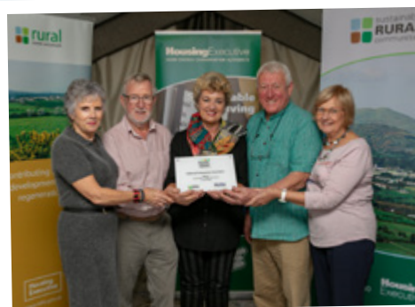
Magheralin Community Association were delighted to accept the Sustainable Village of the Year award in the large village category at the ceremony in Omagh earlier this year.