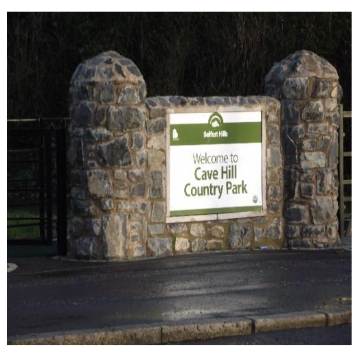
Other improvements have been made to entrance of the Cavehill Country Park and updating the Ballysillan Park/ Ballysillan Road Junction, which has progressed well.